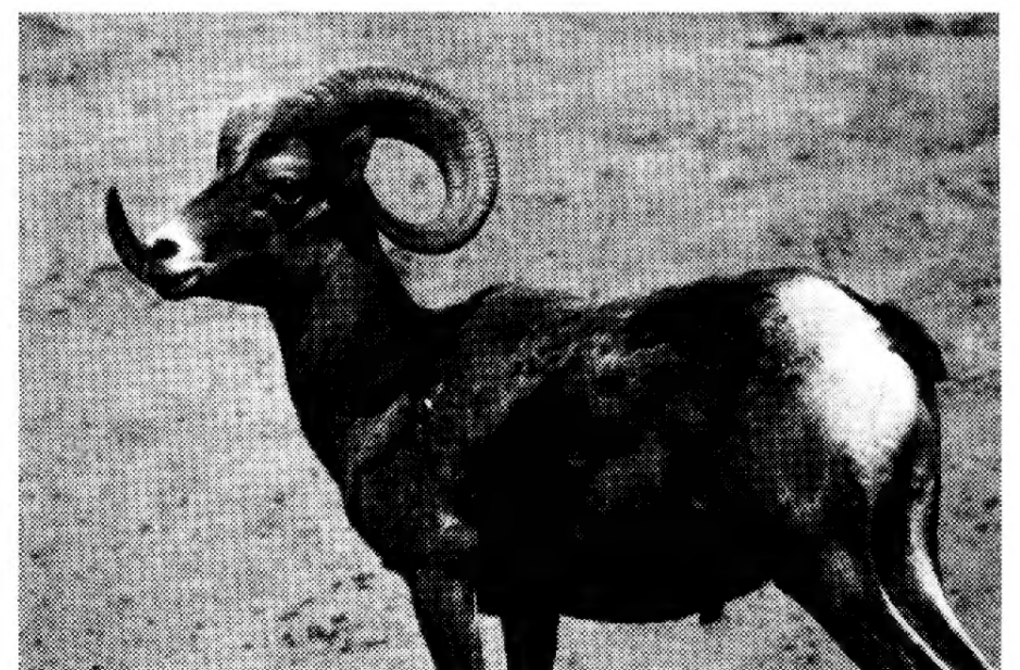
Desert Bighorn Sheep

One of the largest unbroken sections of wilderness remaining in the continental United States, the California Desert, is in peril. A new exhibit at the Academy describes the beauty and natural diversity of the desert with the hope of inspiring greater social consciousness of this fragile ecosystem. The exhibit features photo-murals of the unique desert archipelago systems (such as dunes, playas, springs and mountains) and graphic panels that depict escalating human impacts on the desert environment. Low-impact desert use and beneficial effects of restoration and protection efforts are emphasized. Interactive displays, the Desert at Night and Lowland Desert, feature slide-up panels that reveal hidden desert inhabitants typically camouflaged or nocturnal. The Vanishing Desert will be on display in the Academy's Hohfeld Hall from March 3 to June 2. For more information on the exhibit, please call 750-7142.