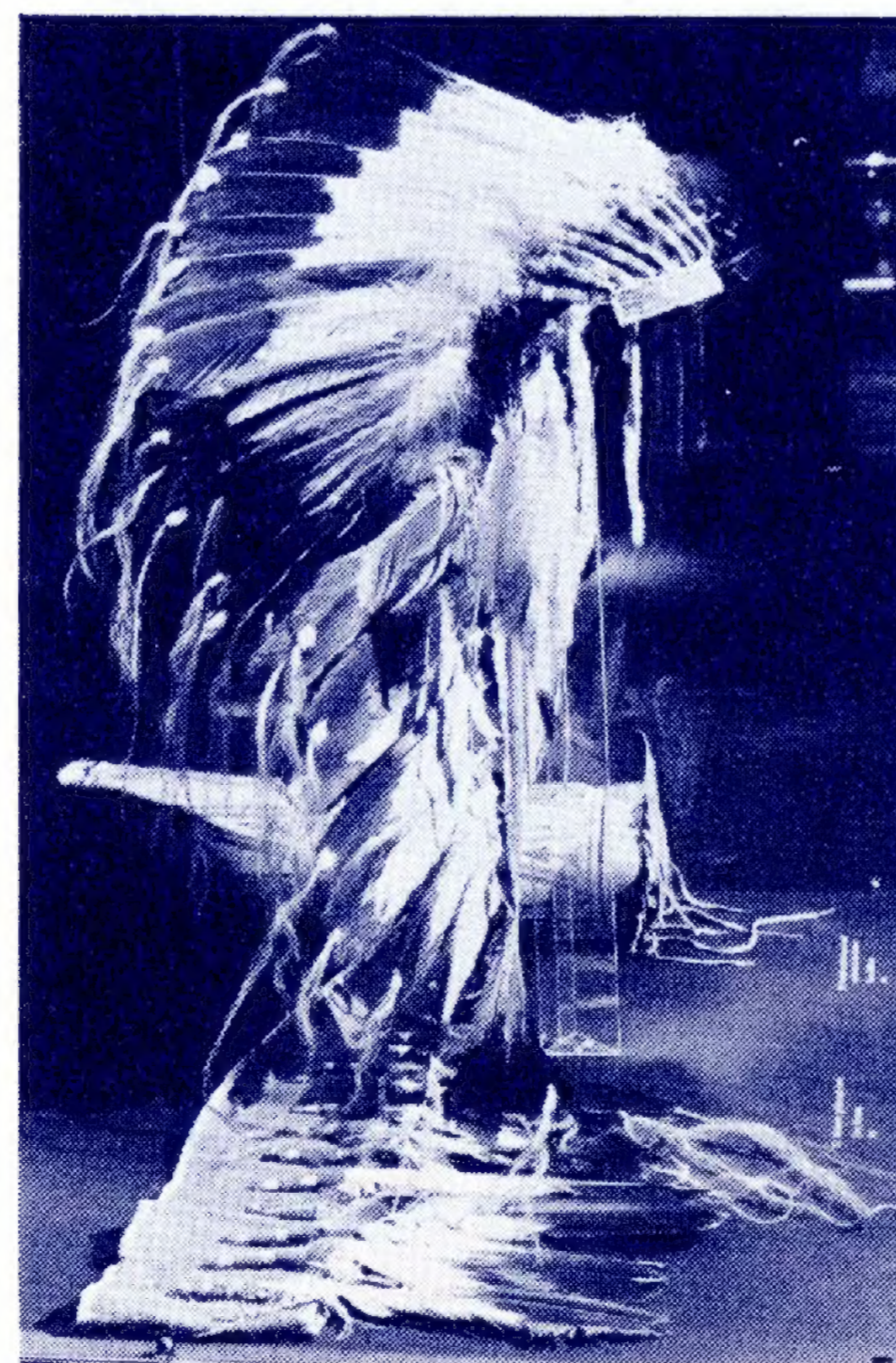
Warbonnet: Crow, Montana from the Feather Arts Exhibit.

The Wattis Gallery now houses a new permanent installation entitled Preservation of the Past from the collections of the Academy's anthropology department. The four sections include: the paintings of Awa Tsireh and the pottery of Maria from the Elkus collection; Peruvian textiles from the Rietz collection; Hawaiian artifacts — mostly fish hooks — from the Ostheimer collection; and mortars and pestles from the Gould collection. All are displayed with photographs and explanatory text.