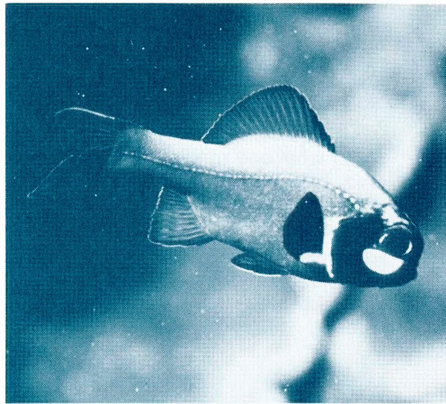
Photoblepharon from first expedition