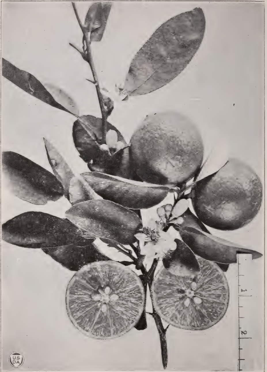
THE WEST INDIAN LIME WAS THE FIRST VARIETY TO REACH HAWAII. BY MANY IT IS CALLED THE HAWAIIAN LIME.