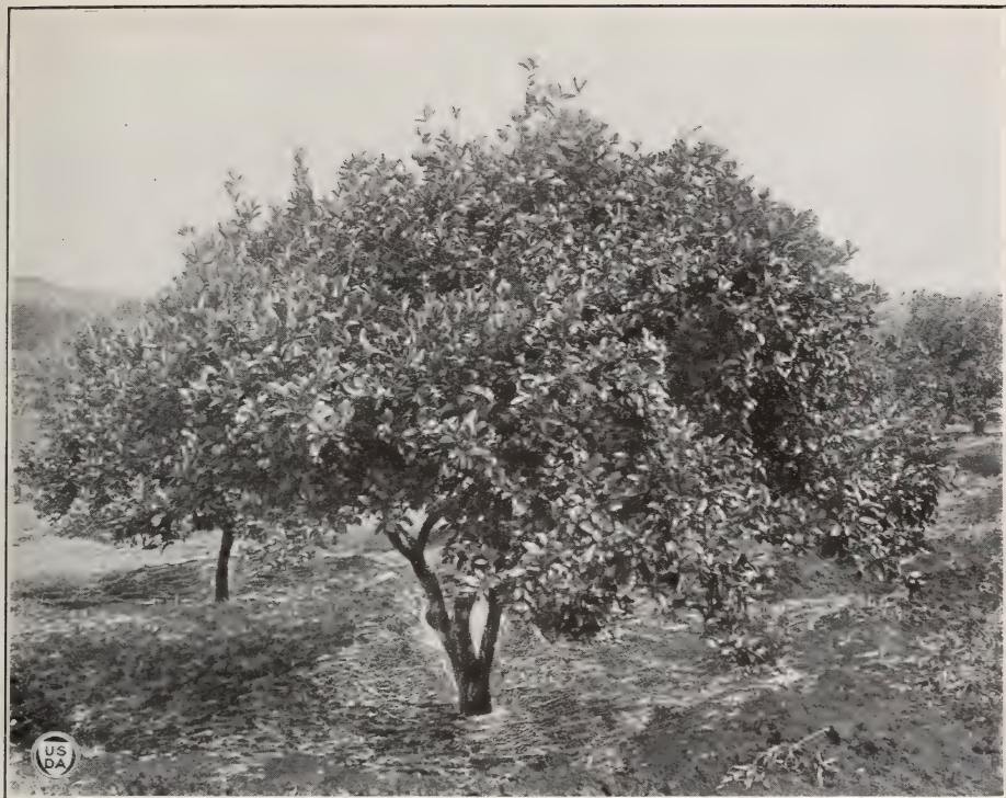
FIG. 1.—KUSAIE LIME TREE. EXPERIMENTAL ORCHARD, HAWAII STATION.