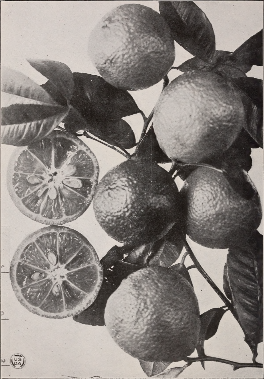
KUSAIE LIMES GROWN AT THE HAWAII STATION.