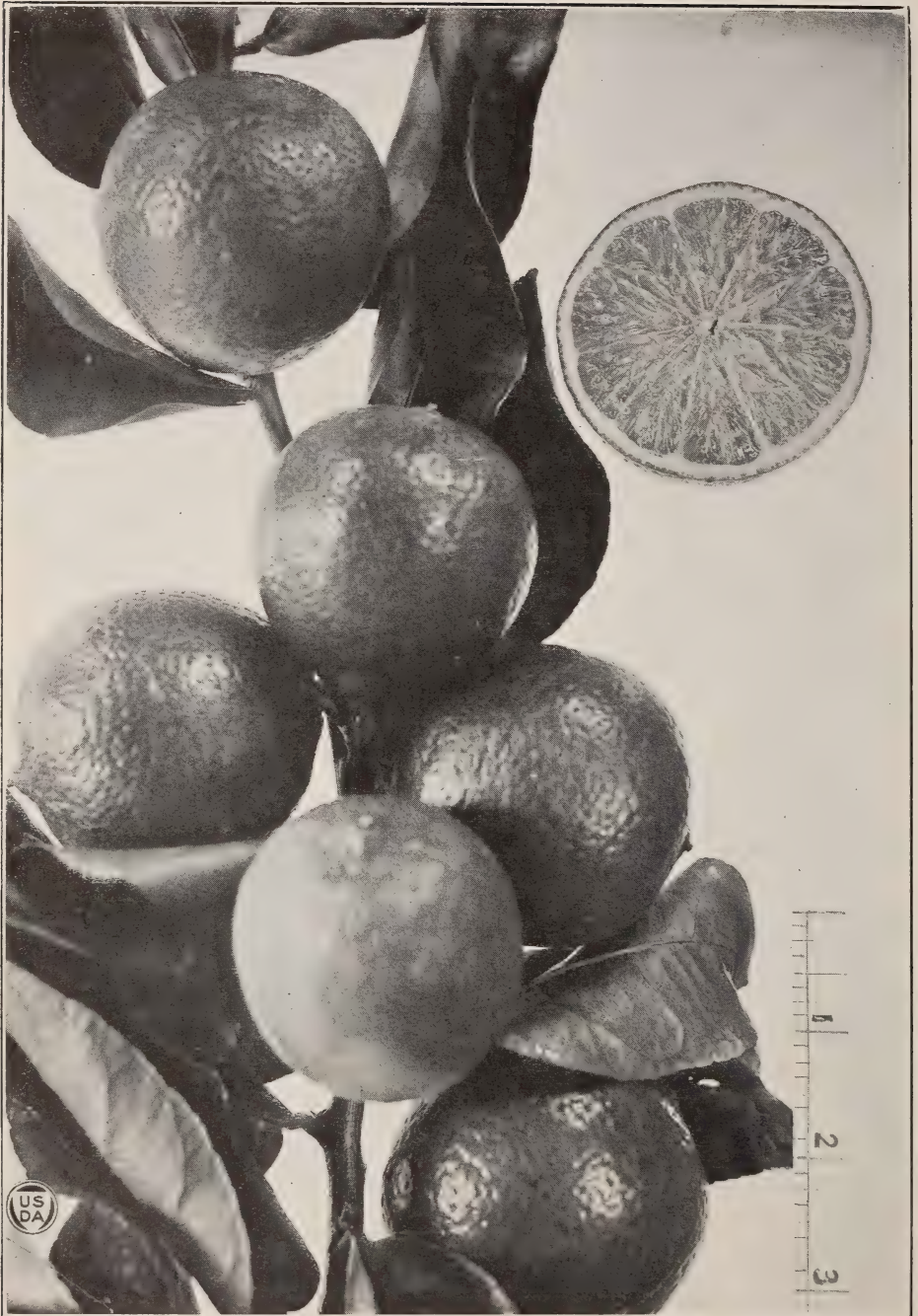
BEARSS, A SEEDLESS LIME, AN IMPROVED TYPE OF TAHITIAN.