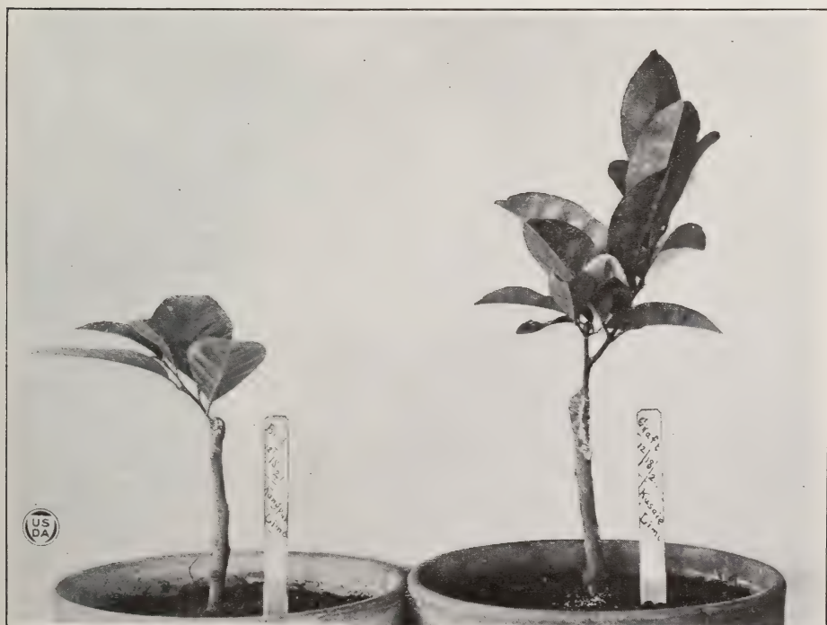
FIG. 2.—LEFT, SHIELD-BUD, LIME ON SOUR ORANGE STOCK. RIGHT, BARK-GRAFT, LIME ON SOUR ORANGE STOCK. BOTH 74 DAYS AFTER GRAFTING.