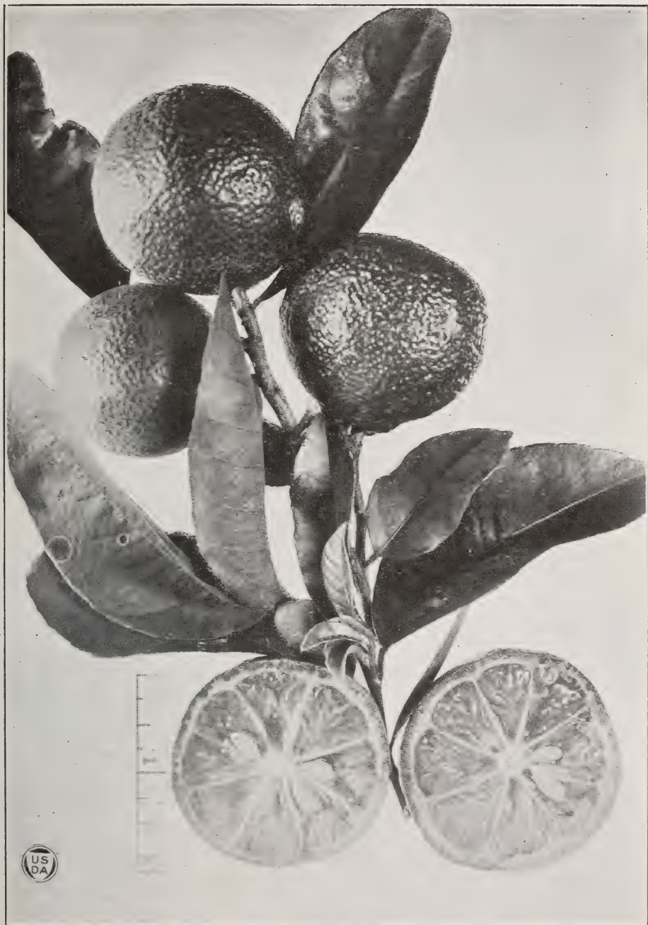
RANGPUR LIME. GROWN AT THE HAWAII STATION.