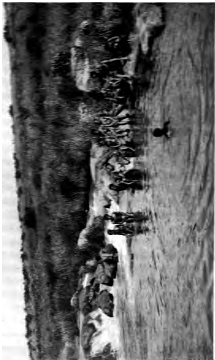
A SCENE AT THE ROYAL BATHING POOL.