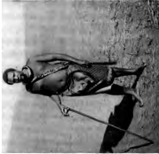
LOMWAZI, SON AND PRIME MINISTER TO THE OLD QUEEN He acted as Regent to the Swazi nation