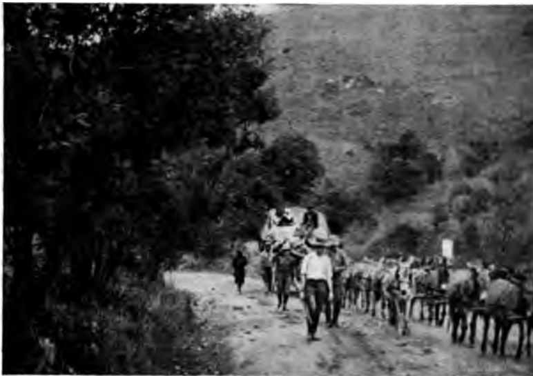
THE SECOND TRIP INTO SWAZILAND The O'Neil caravan shortly after the draft-oxen had died and were replaced by mules and donkeys