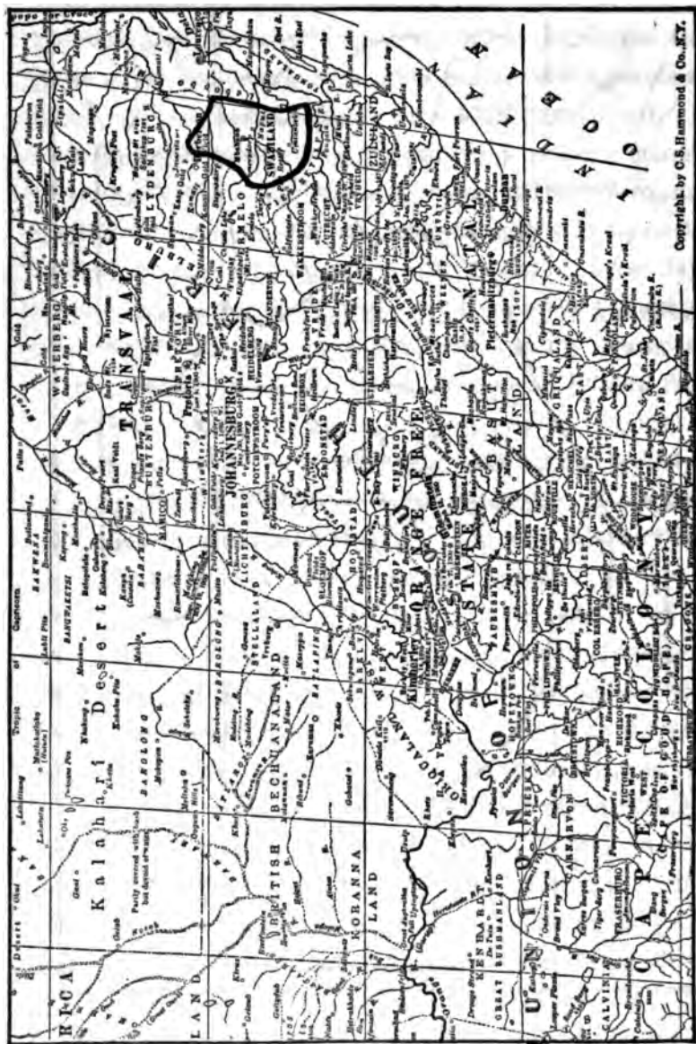
SECTION OF SOUTH AFRICA Showing Swaziland and its relative position to other states