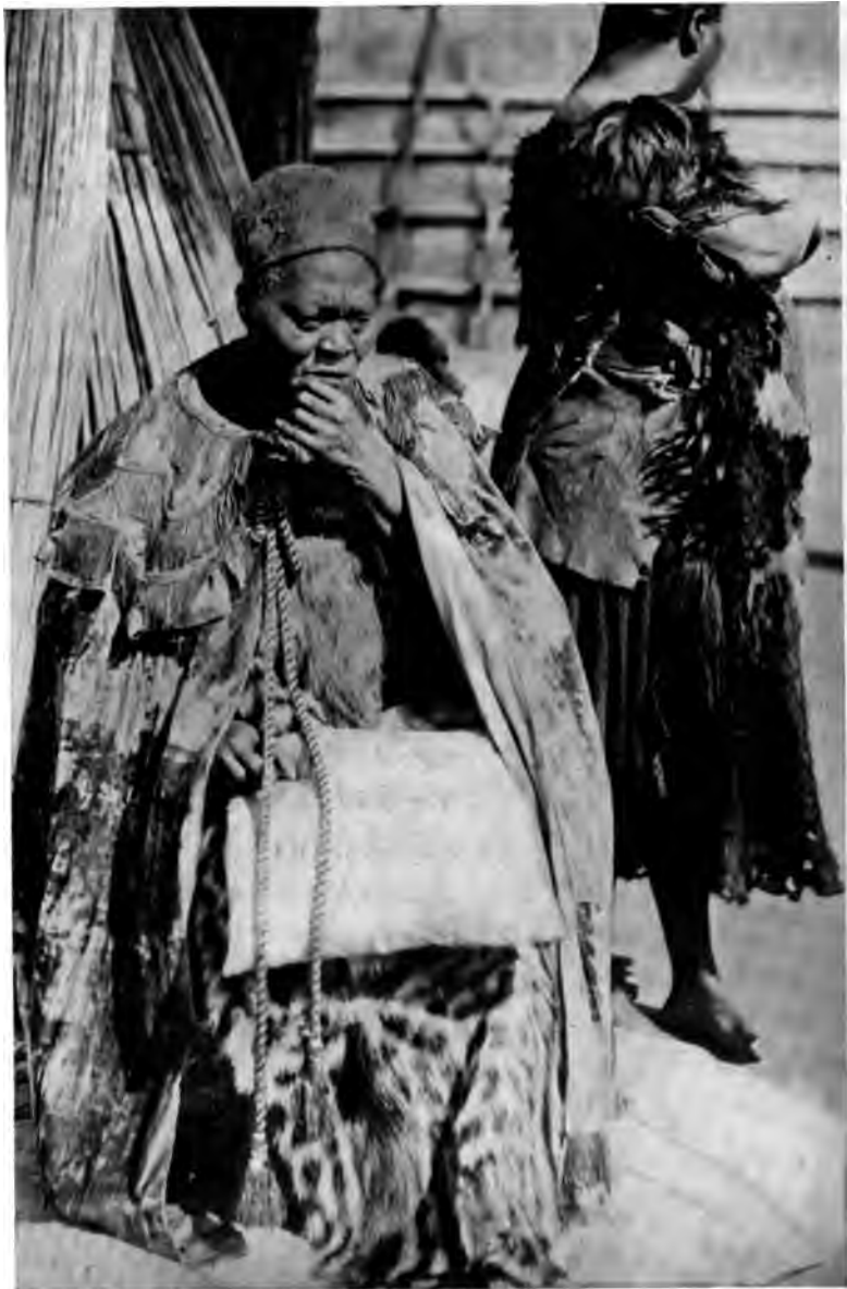
QUEEN LABOTSIBENI, MOTHER OF KING BUNO During Sebuza's infancy and boyhood, the throne receded to Queen Labotsibeni, his grandmother. She was blind and more than one hundred years old