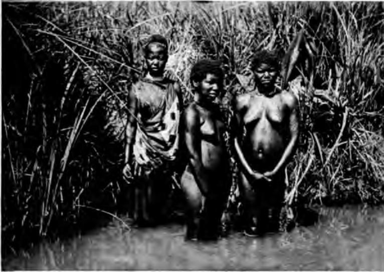
PRINCESSES AND THEIR MAID TAKING A MORNING BATH