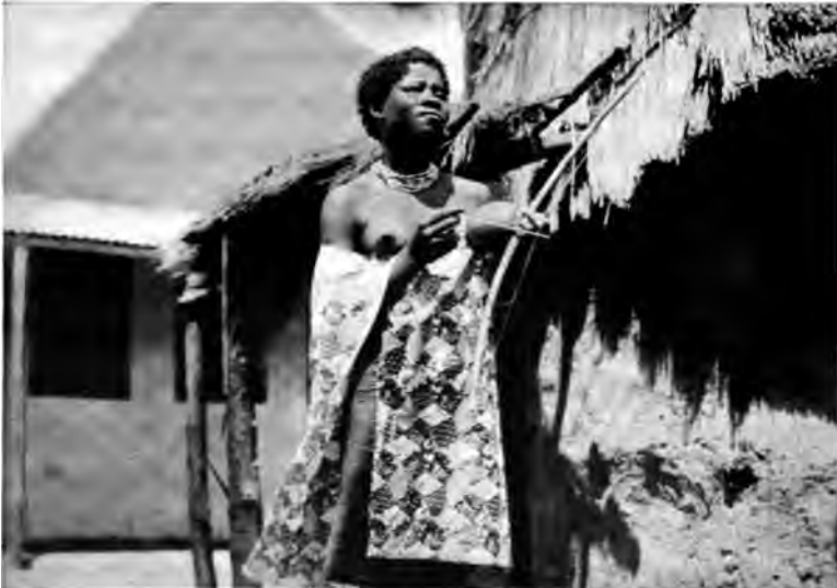
MAIDEN SINGING TO THE CROWN PRINCE SEBUZA She is playing on the native instrument which consists of a bow and one string