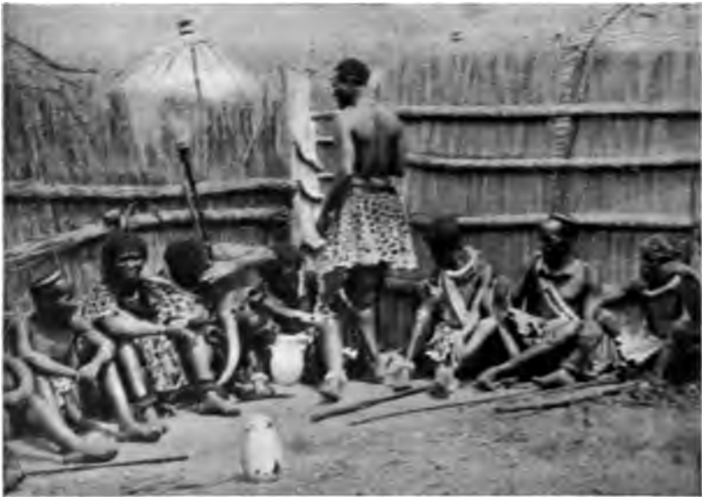
A SWAZI SEMINARY OR SCHOOL FOR YOUNG WITCH-DOCTORS These are being taught the secrets of their profession, one of them being in the act of smoking a Swazi pipe