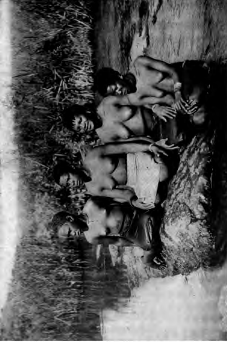
PRINCESSES AT THE SACRED BATHING POOL Previous to being offered for the choice of Crown Prince Sebusa of the Swasia