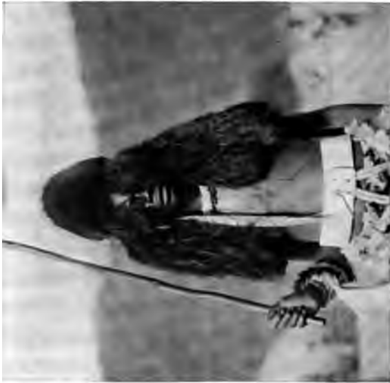
A TYPE OF DRESS WORN BY THE ROYAL EXECUTIONER