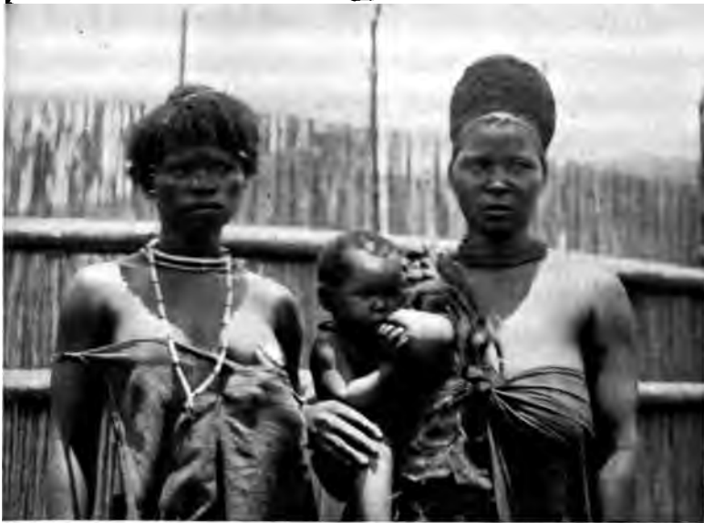
MOTHER FEEDING HER BABY