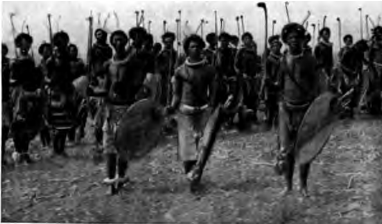
WARRIORS OF PRINCE SEBUZA'S IMPIS STARTING OUT TO BATTLE The enemy was but a short distance away and his warriors were coming forward in like manner to meet those of the Prince