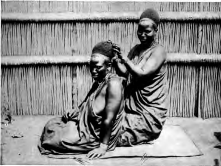
YOUNG PRINCESSES AMIABLY ENGAGED IN HAIR-DRESSING

These are of exceptionally high birth and of remarkable beauty. Either would probably be worth fifty head of cattle and could only be bought for that number. Women are the standard of currency among the Swazis, the average low-caste woman, if young and sound in limb, being worth five head of cattle. The price of women increases according to their birth and beauty