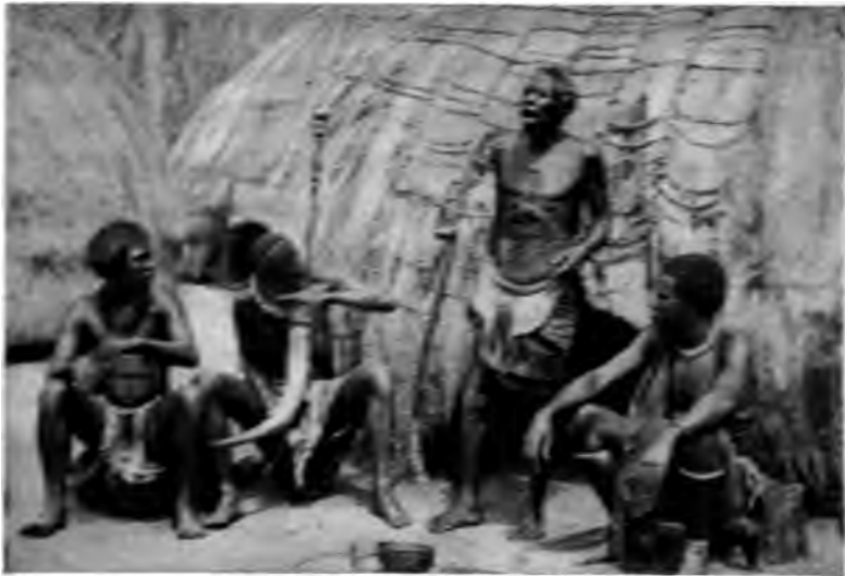
A SCHOOL OF WITCH-DOCTORS