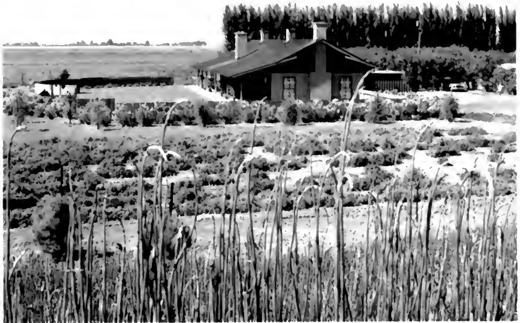
The Gwerder home, 1965