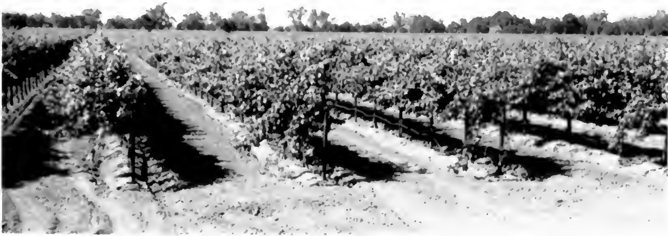
Gwerder Vineyard (Galt, California)