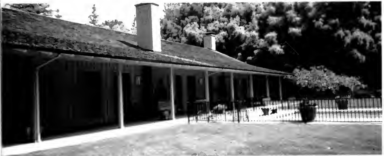
The Gwerder home, 2002