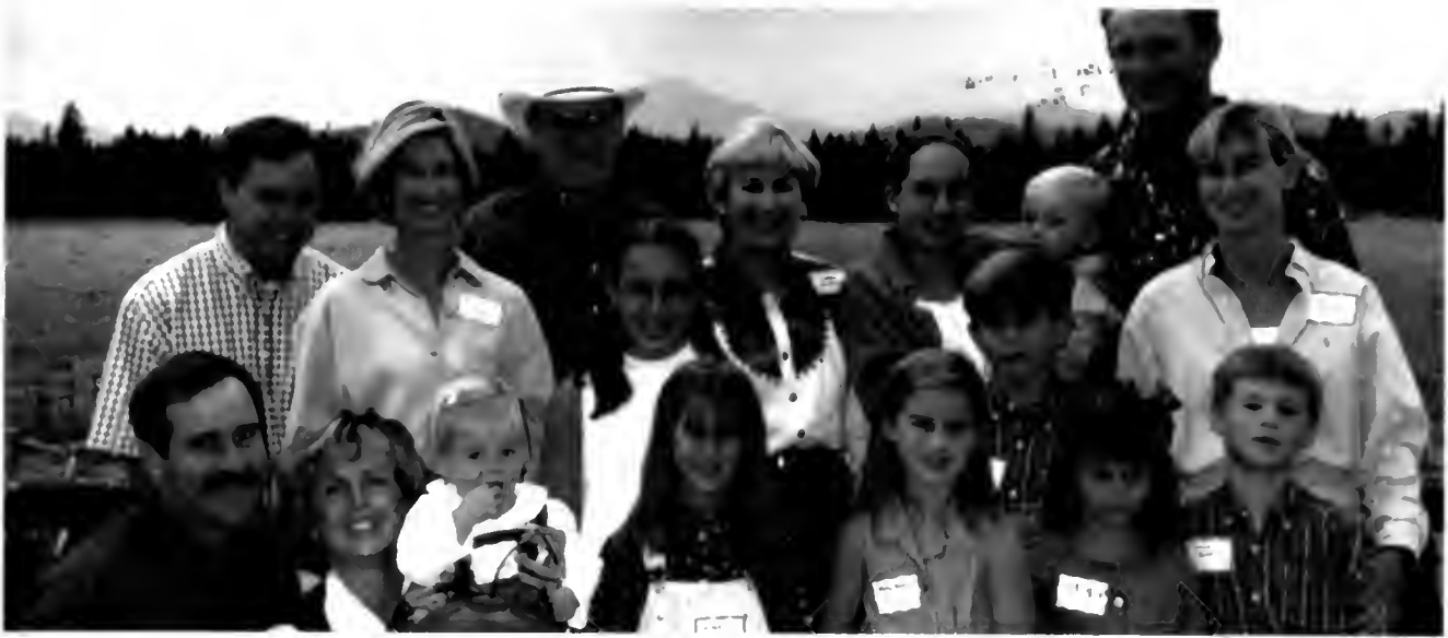
The Gwerder family, 1998