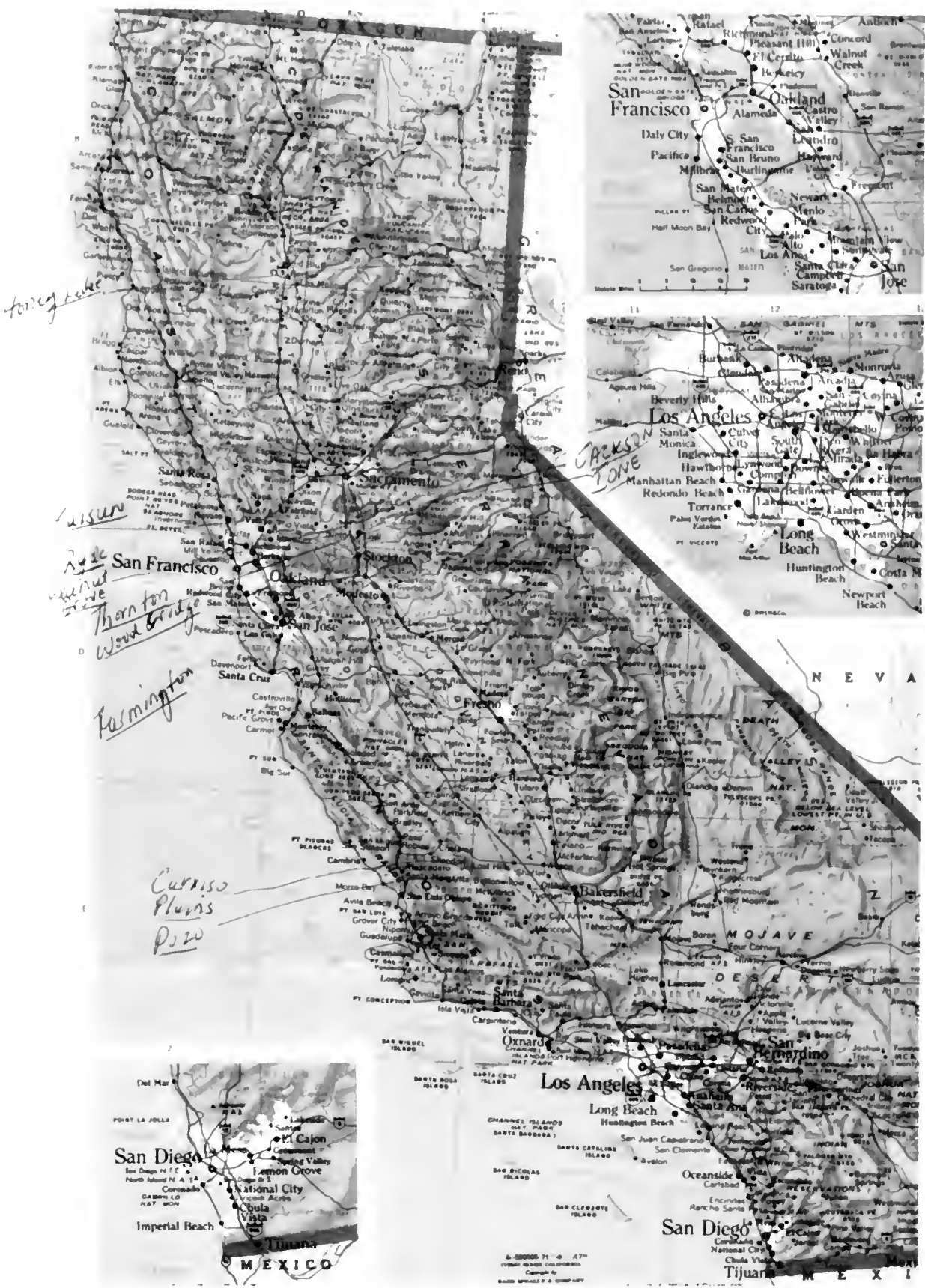
Gwerder Family Agricultural Lands