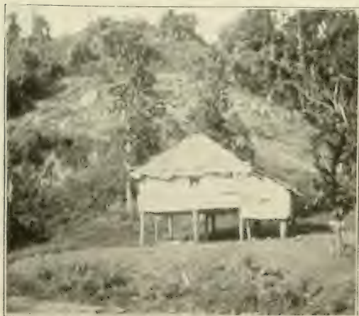
LABORER'S HUT, NEAR CARMEN.