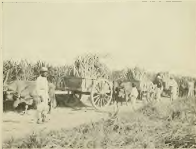
HAULING CANE TO MILL.