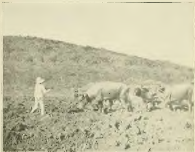
PLOWING FOR SUGAR CANE.