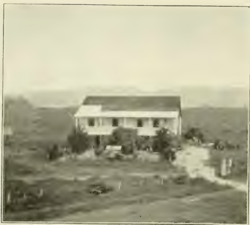
SUGAR PLANTER'S HOUSE, ARCIBO.