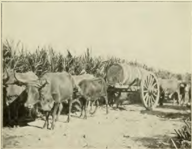
HAULING MOLASSES TO MARKET.