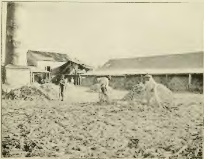
SPREADING BAGASSE TO DRY.