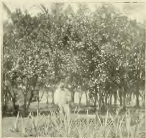
THREE-YEAR-OLD ORANGE TREES.