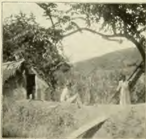
LABORER'S HUT, COFFEE PLANTATION.