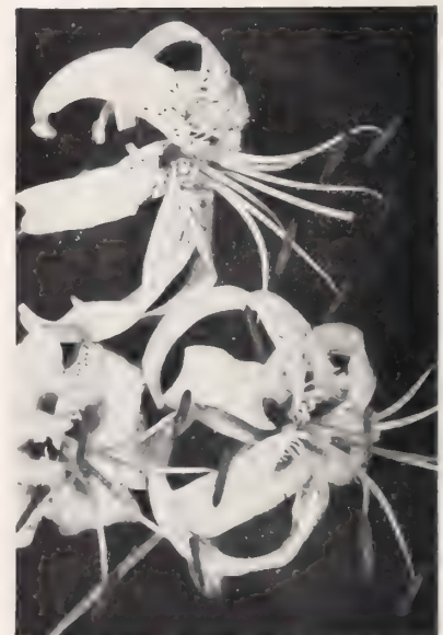
PINK SNOW LILY

Goldband Lily ( L. auratum ). A very popular but usually short lived species. Grows 2 to 6 ft. and bears up to 20 large very fragrant trumpet shaped flowers. Color, white with a gold band down the middle of each petal. Blooms in August. 50c each, $5.00 per 12.