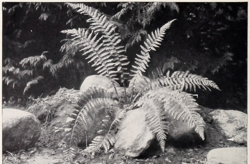
BRAUNS HOLLY FERN

Virginia Chainfern ( W. virginica ). Another swamp species growing to 30 inches. Spreads from the roots. 3 for 60c, 12 for $2.00.