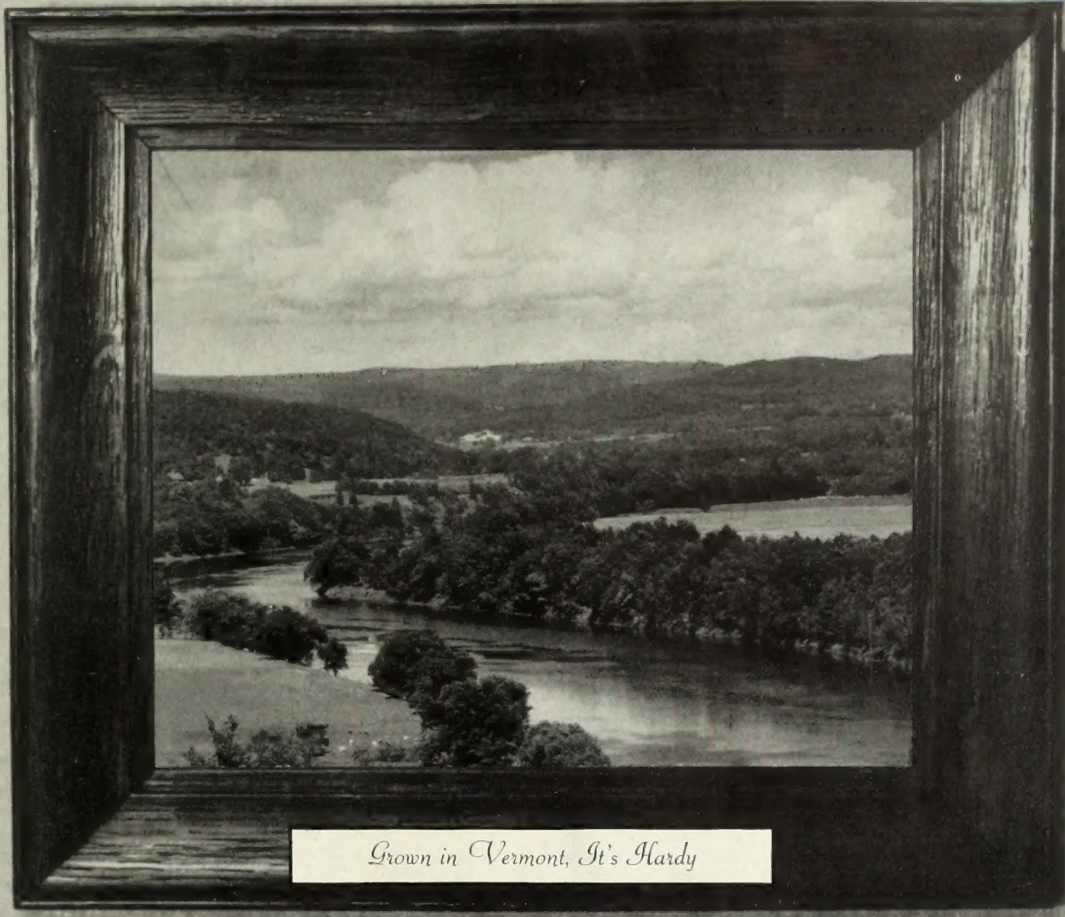
Grown in Vermont, It's Hardy

LIBRARY RECEIVED ★ FEB 9 1970 ★ U. S. Department of Agriculture