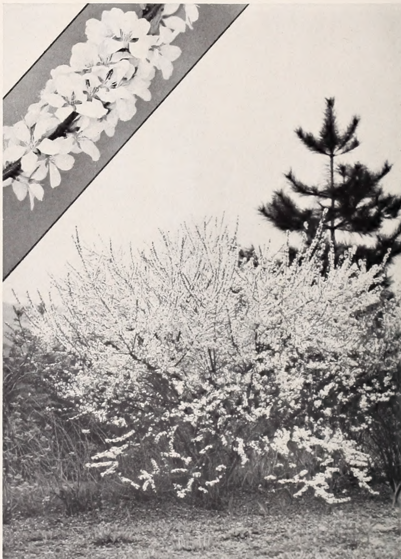
NANKING CHERRY—PRUNUS TOMENTOSA

Common Snowberry ( S. racemosus ). Pale pink flowers in spring, but the snow white fruit in autumn and winter are its most attractive feature. Will often grow under shade trees where other shrubs fail. 2-3 ft. 50c each, $4.50 per 10.