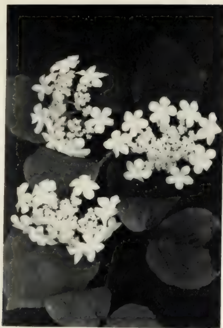
V. ALNIFOLIUM HOBBLEBUSH

Coralberry ( S. vulgaris ). Useful for planting gravelly banks and in the shrubby border. Red berries thickly set along the arching branches persist well into the winter and are useful for winter bouquets. 2-3 ft. 50c each, $4.50 per 10; 3-4 ft. 60c each, $5.50 per 10.