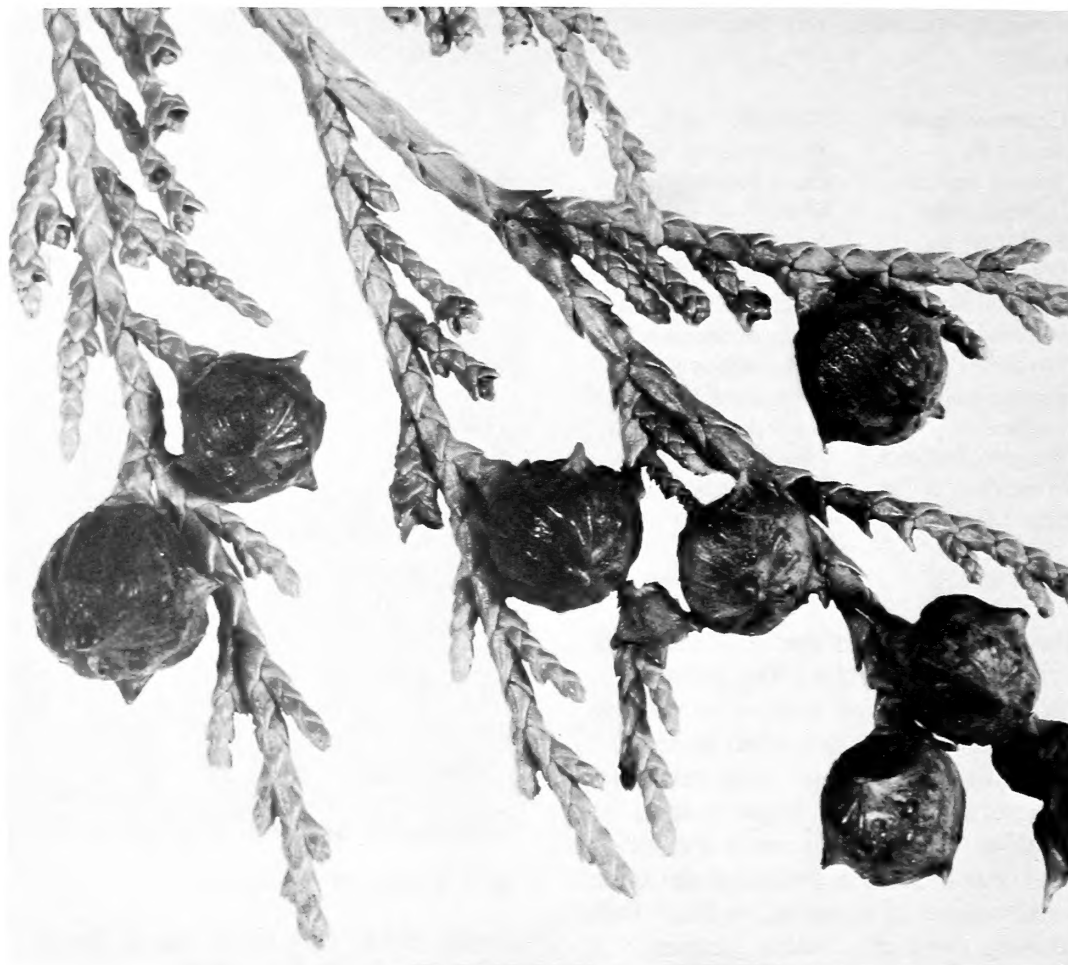
Figure 3—Foliage and cones of Alaska-cedar.

Because trees are often scattered and at high elevations, much of the timber is inaccessible. But as logging moves to