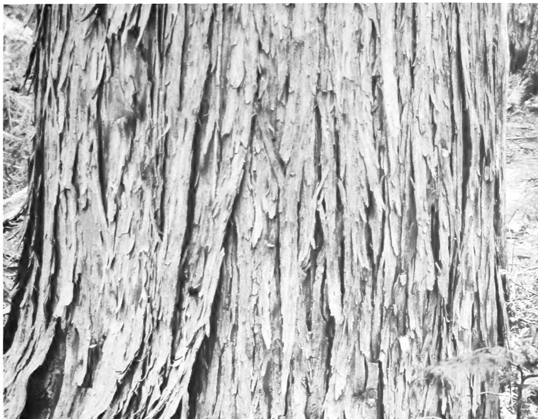
Figure 2—Bark of Alaska-cedar.

Growth is especially slow at timberline, and trees may resemble sprawling