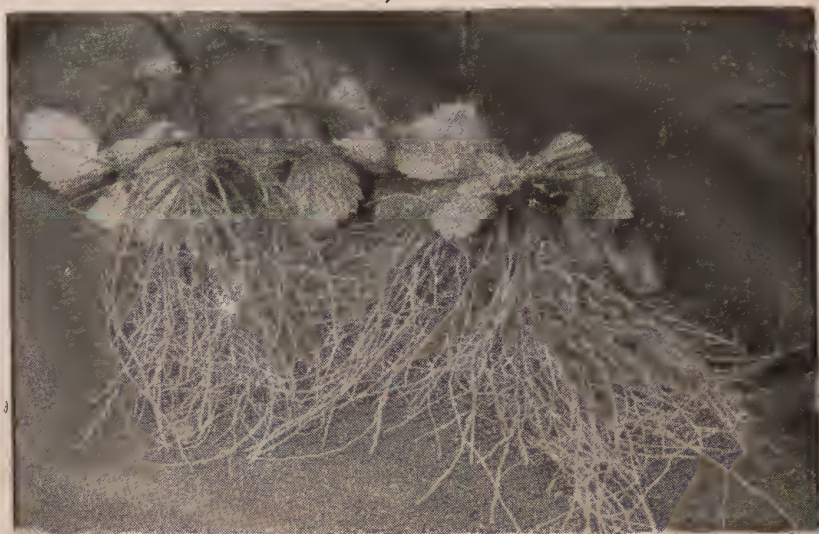
Our plants have a fine root-system