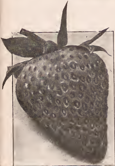
Kellogg's Prize Strawberry