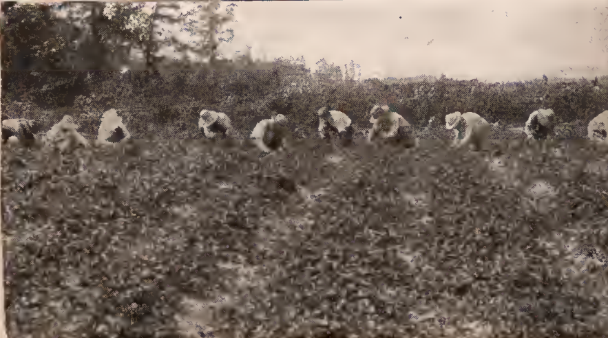
Picking Big Joe. One of the best