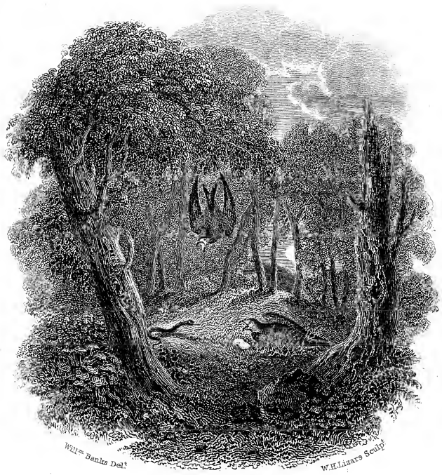
THE NIGHT HAWK.