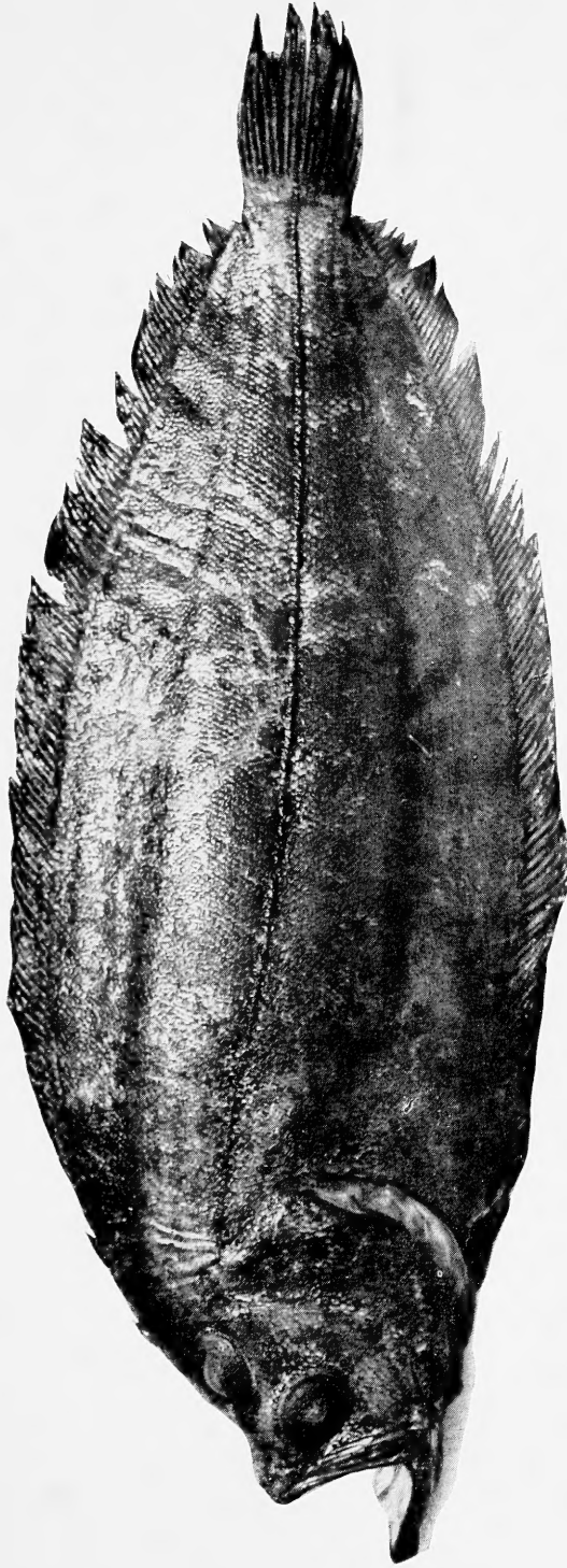
Mancopsetta milfordi Holotype.