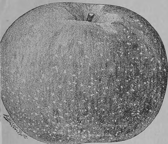
THE ANNETTE APPLE.