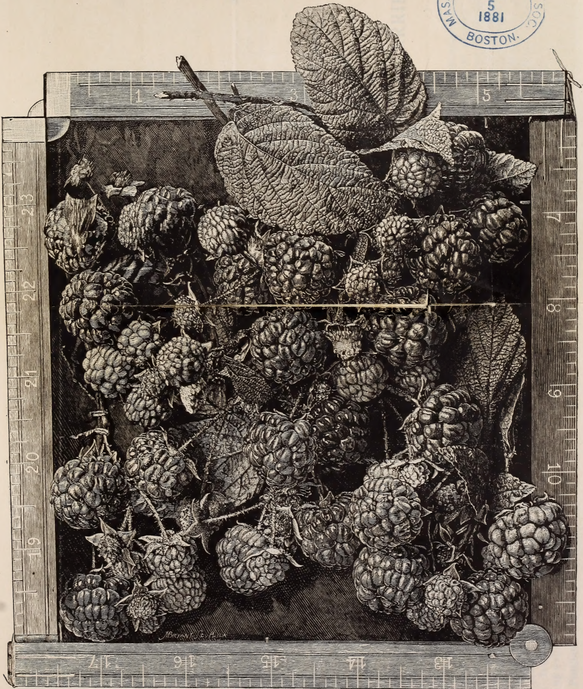
This cut is an exact copy by J. M. BRYANT, of No. 708 Chestnut Street, Philadelphia, from a Photograph by O. B. DE MORAT No. 2 S. Eighth Street, Philadelphia; true to size as shown by the FOOT RULE BORDER. A Photograph from the original negative, will be mailed to any one wishing to verify it, upon receipt of 15 cents to cover cost.