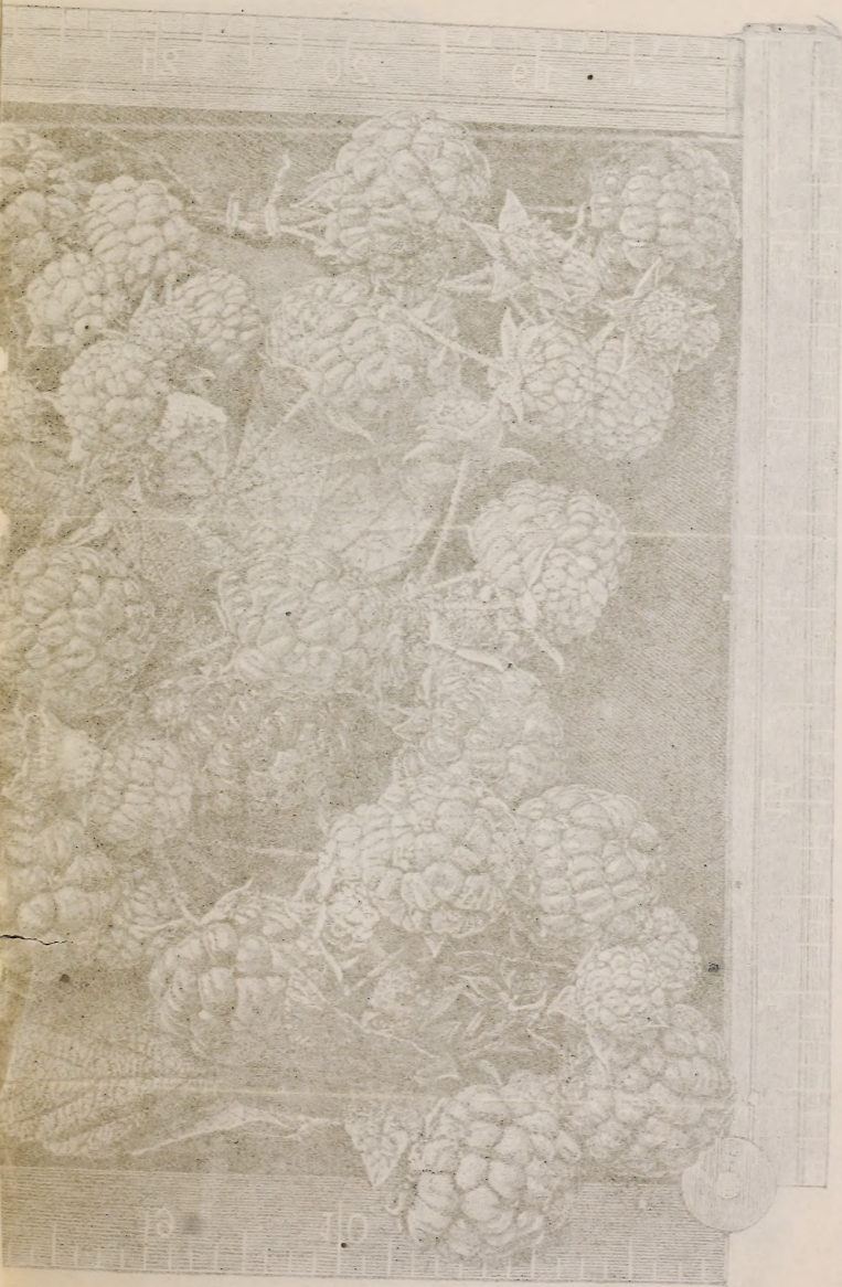
Fig. 1. Rubus strigosus , var. strigosus , in fruit. The fruit is a cluster of drupelets. The leaves are serrated. A photograph from the original. No. 2. Rubus strigosus , var. strigosus , in fruit. The fruit is a cluster of drupelets. The leaves are serrated. A photograph from the original. This one is an exact copy of the one in the original. No. 2. Rubus strigosus , var. strigosus , in fruit. The fruit is a cluster of drupelets. The leaves are serrated. A photograph from the original.