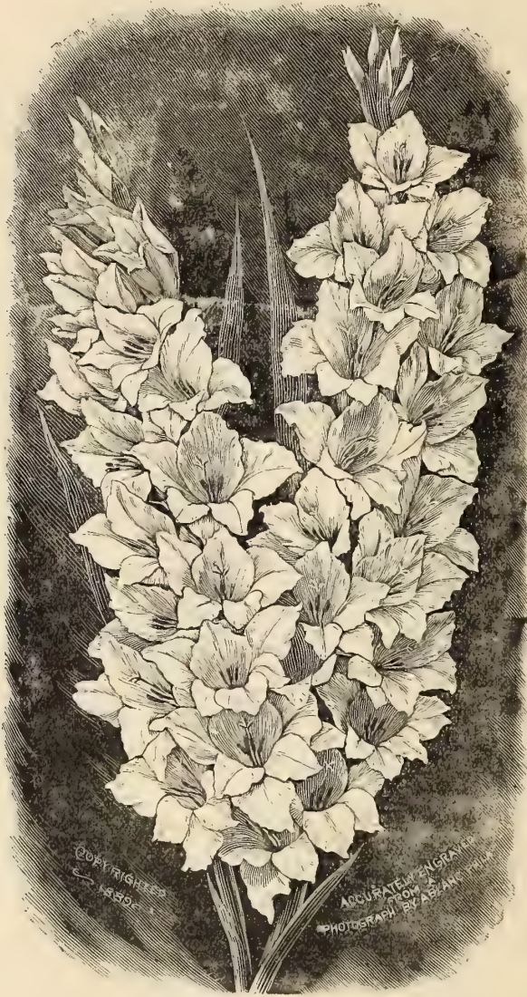
SNOW WHITE GLADIOLUS.

These are the most beautiful of our summer flowering bulbs, the flower spikes rising from 2 to 4 feet in height—often several spikes from the same bulb. The flowers have almost every desirable color, from creamy white to different shades of salmon, pink, scarlet, crimson, striped, blotched and spotted.