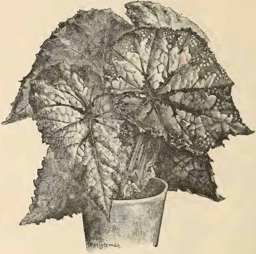
ROI FERD. MAJOR.

In 50 different Varieties, all named. (15 cents each.)