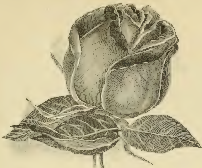
MME. HOSTE (LUCIOLE).