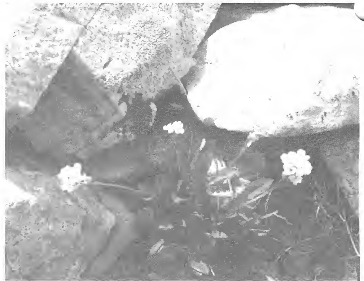
Draba crassa . Image by Rebecca Day-Skowron, July 2001. http://www.rmrp.com/