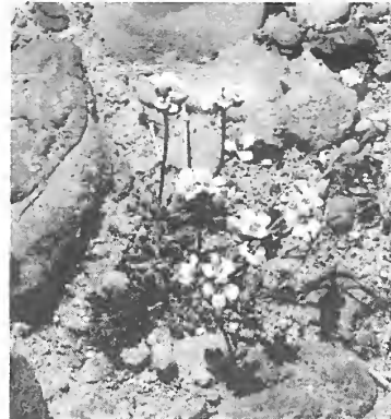
Draba fladnizensis var. pattersonii.