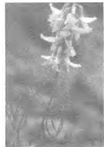
Kremmling milkvetch, Astragalus osterhoutii.