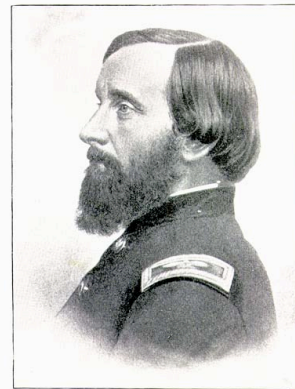
THOMAS WENTWORTH HIGGINSON COLONEL FIRST SOUTH CAROLINA VOLUNTEERS Afterwards 33d U. S. C. T.

These pages record some of the adventures of the First South Carolina Volunteers, the first slave regiment mustered into the service of the United States during the late civil war. It was, indeed, the first colored regiment of any kind so mustered, except a portion of the troops raised by Major-General Butler at New Orleans. These scarcely belonged to the same class, however, being recruited from the free colored population of that city, a comparatively self-reliant and educated race. (From the text)