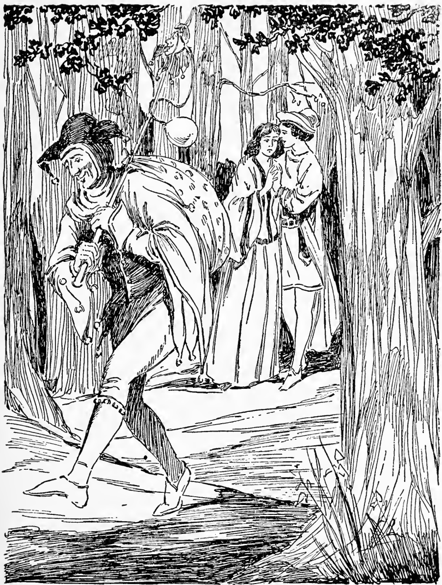
TOUCHSTONE: Ay, now am I in Arden; the more fool I— Act II, Scene 4.