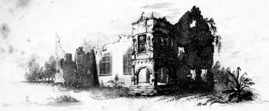
GORHAMBURY, A. D. 1821.