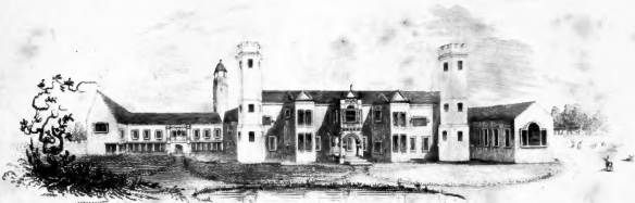
GORHAMBURY, A. D. 1568.