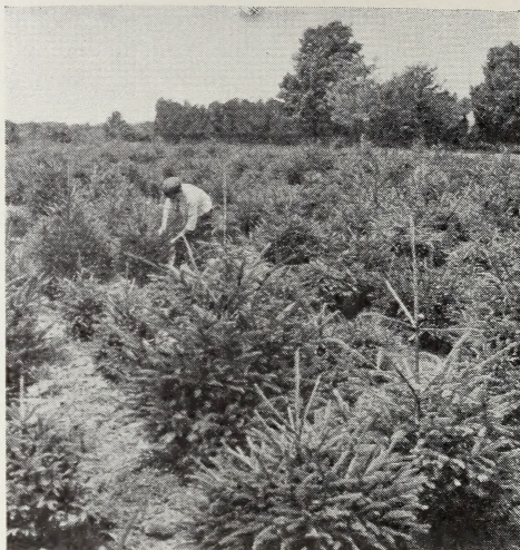
5,000 Norway Spruce, 2 to 12 feet