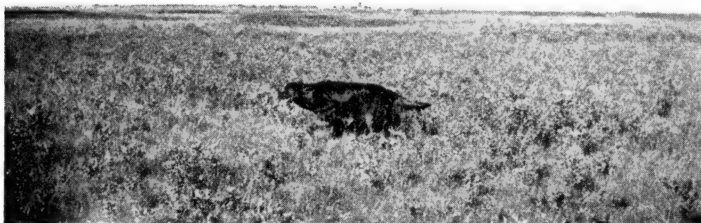
CARTWRIGHT, ET AL —NESTING HABITAT OF BAIRD'S SPARROW AT DEER LODGE, MANITOBA. THE DOG IS A SCALE TO THE HEIGHT OF THE GRASS AND SNOWBERRY.