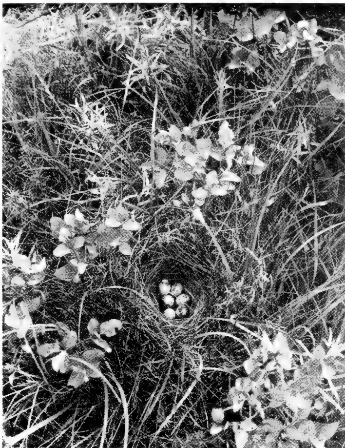
CARTWRIGHT, ET AL —NEST AND EGGS IN SITUATION, DEER LODGE, WINNIPEG, MAN., JULY 13, 1930.