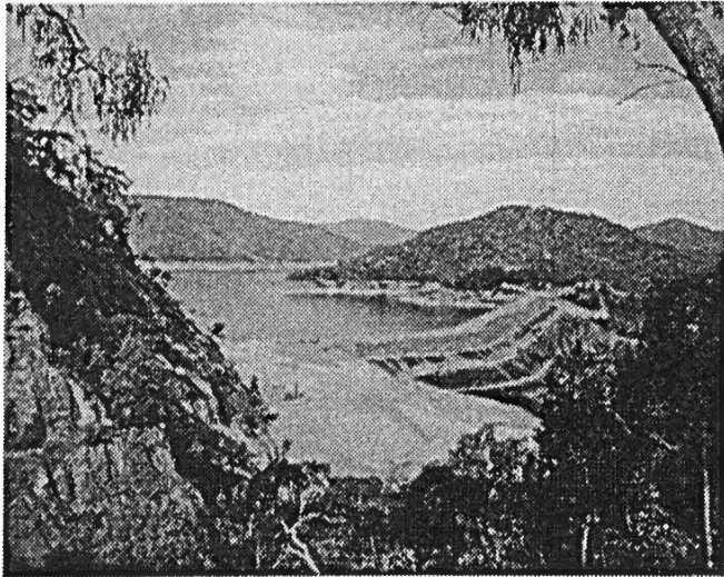
Lake Eildon wall being raised