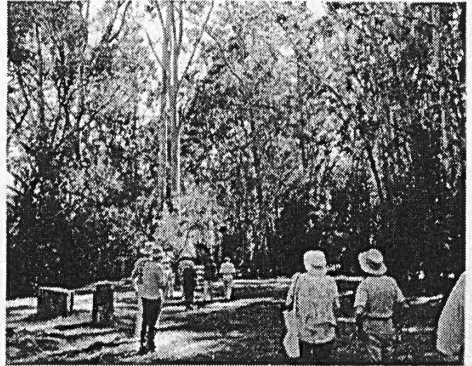
Ideal spot for twitchers on Goulburn River bank

Those who visited the Snobs Creek Freshwater Discovery Centre were taken behind the scenes where Murray Cod and Trout Cod are reared, as well as Rainbow and Brown Trout for commercial stocking.