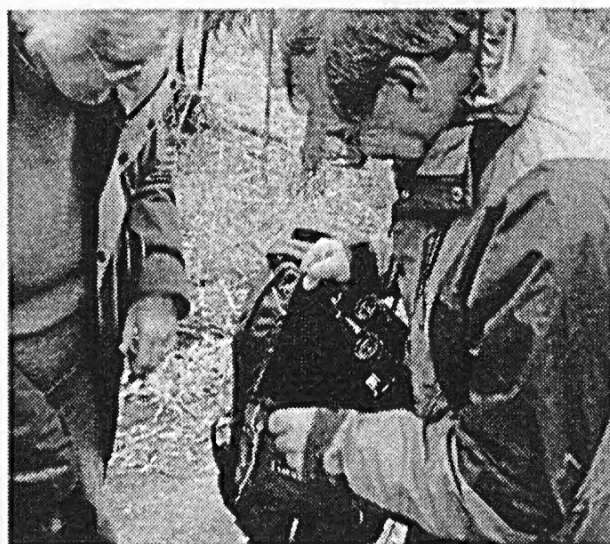
Where are the crane flies gone?

Common Brown Butterflies were seen in good numbers as we walked up the hill. At one bird hotspot we saw Grey Shrike-thrush, Satin Flycatcher, Rufous Whistler, Brown Thornbill and Grey Fantail and heard Spotted and Striated Pardalote. Two raptors flew overhead. The first was a Brown Goshawk while the second, a falcon with very pointed wings, may have been a Black Falcon. It has recently been sighted at the Ballarat North Sewage Treatment Plant.