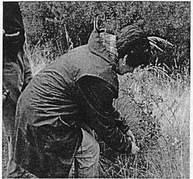
Ah juicy blackberries

Woody plants that were regenerating included Common Cassinia Cassina aculeata , Drooping Cassinia C. arcuata , eucalypts and sheoak. Weeds, including hemlock and