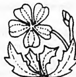
Trailing Goodenia Goodenia lanata (Club Logo)