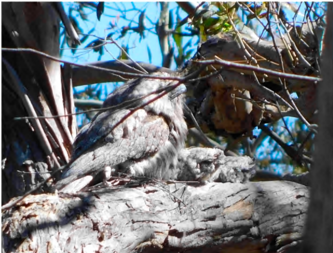
Tawny Frogmouth ( Podargus strigoides ) mother and chicks