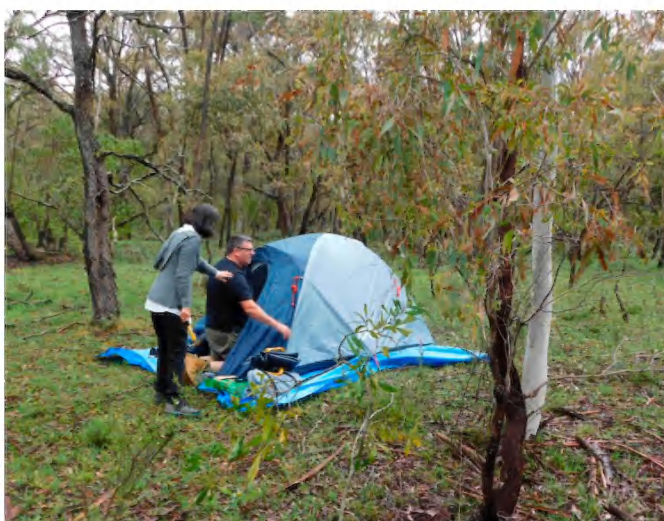
Setting up on Saturday

Peregrine Falcon Black Kite Wedge-tailed Eagle Long-billed Corella Sulphur-crested Cockatoo Galah White-faced Heron Superb Blue Wren New Holland Honeyeater