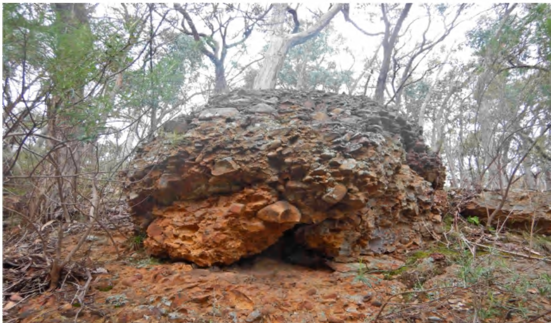
Large boulder of Goat Rocks Conglomerate 1

The basal member of the Kerrie Group is now known as the Goat Rocks Conglomerate (Srg) . (Goat Rocks was the original name of the property before it was reserved).