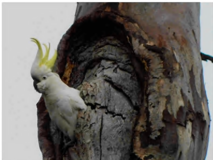
A curious Cocky checking out the juniors at Enfield

Olive-backed Oriole Crimson Rosella Eastern Rosella Rufous Whistler Pallid Cuckoo Fantailed Cuckoo Spotted Pardalote Striated Pardalote Restless Flycatcher Sulphur-crested Cockatoo Grey Fantail Striated Thornbill Black-faced Cuckoo- Shrike White-throated Treecreeper Long-billed Corella Pobblebonk Frog