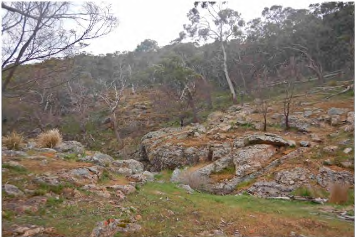
View of Gorge of Conglomerate Gully

Conglomerate Gully has large exposure of conglomerate rocks along a creek valley. An interpretation sign at the entrance explained the geology and history of the reserve. Heathy Dry Forest and Grassy Dry Forest vegetation types are found in the reserve with Broad-leaved Peppermint Eucalyptus dives and Messmate Eucalyptus obliqua forming the canopy