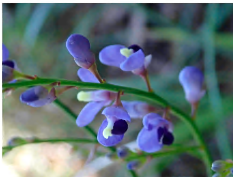
Love Creeper Comesperma volubile