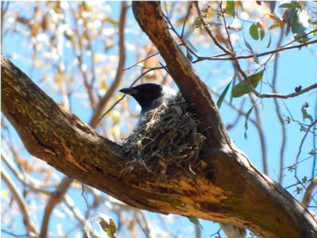
Black-faced Cuckoo-shrike ( Coracina novaehollandiae ) on the nest