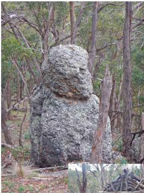
Very large boulder covered in lichens