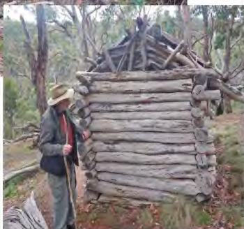
Bush Shelter near lookout