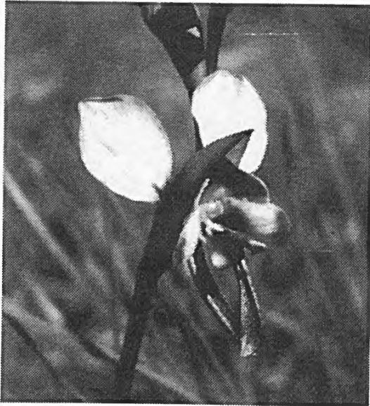
Leopard Orchid, Diuris pardina

flowering plants included Creamy Candles Stackhousia monogyna , the Running Postman Kennedia prostrata , Common Correa C. reflexa , and Common Flat-pea Platylobium obtusangulum .