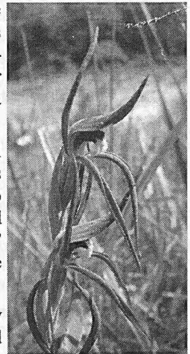
Brown Beak Orchid

Monday excursions took us to Inverloch and Wonthaggi areas, where some visited the Inverloch-Bunurong coastal cliffs, site of the dinosaur digs. Others walked in the Wonthaggi Heathland area discovering more orchids and other plants along the slashed track areas. We gathered for lunch at Wonthaggi Guide Park and then departed home.