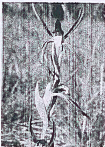
Brown beak orchid