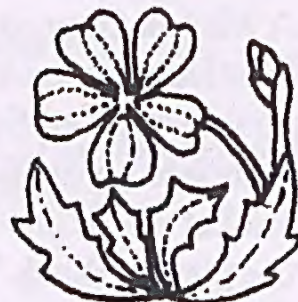
Trailing Goodenia Goodenia lanata (Club Logo)