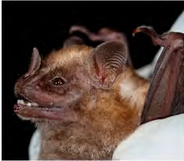
Figure 5. Photograph of a male Artibeus jamaicensis from swimming pool of the Kings Well Resort on the island of St. Eustatius. Note the large nose-leaf, white stripe over the eye, and brown coloration, all characteristic of this species.

Hispaniola, Puerto Rico, St. John, and Dominica (Genoways et al. 2001). P. Larsen et al. (2007) included 10 individuals of A. jamaicensis collected from St. Eustatius in their phylogenetic analysis of the Artibeus jamaicensis complex. Their results show a single mitochondrial cytochrome- b haplotype shared among the 10 individuals and this haplotype was also shared with individuals collected from a wide geographical distribution, ranging from Quintana Roo, Mexico, eastward to Jamaica and Puerto Rico, throughout the northern Lesser Antilles, and as far south as Carriacou in the Grenadines. The results of P. Larsen et al. (2007) support the hypothesis of a recent Caribbean colonization by A. jamaicensis (perhaps within the last ~25,000 years) originating from Central American populations and expanded rapidly to the east across the Greater Antilles and Lesser Antilles. Carstens et al. (2004) identified a similar lack of genetic variation across the northern Lesser Antilles; however, their analyses also identified three A. schwartzi mitochondrial haplotypes on the islands of Montserrat, Nevis, and St. Kitts (see P. Larsen et al. 2007 and P. Larsen et al. 2010). The existence of A. schwartzi mitochondrial haplotypes circulating in northern Lesser Antillean populations of A. jamaicensis provides evidence of historical or ongoing hybridization (P. Larsen et al. 2010). Moreover, this observation suggests gene-flow from southern