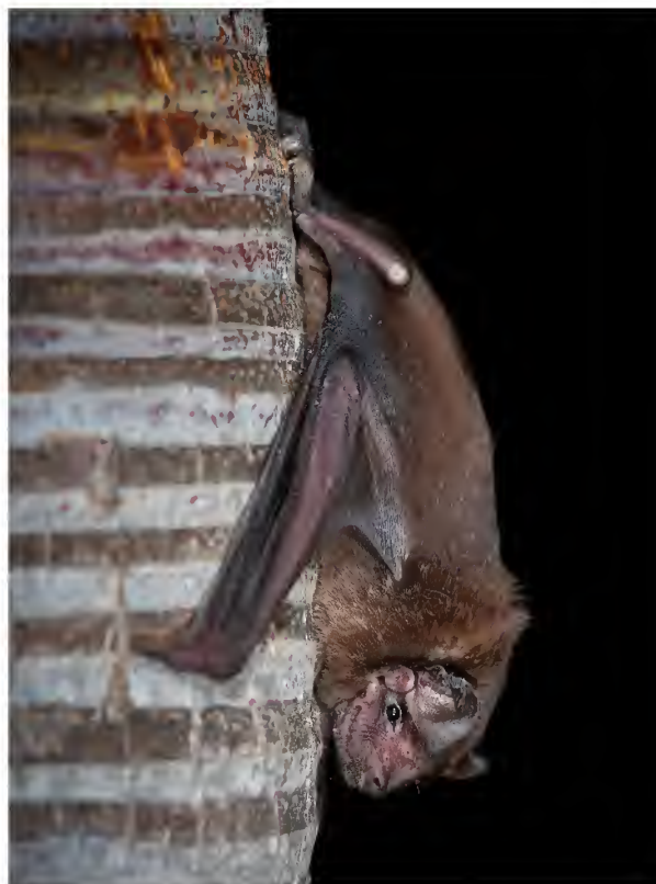
Figure 7. Photograph of Molossus molossus from swimming pool of the Kings Well Resort on the island of St. Eustatius. Note the short, rounded ears, nearly naked face, and chestnut-black coloration characteristic of this species. The tail that is free beyond the edge of the uropotagium, characteristic of all bats of the family Molossidae, is difficult to see between the feet of this individual.

Remarks. —This common “house bat” is widely distributed throughout the archipelago and was expected on St. Eustatius (Fig. 7). Koopman (1968) first reported specimens of this species from St. Eustatius without reference to specific specimens or localities. Husson (1962) restricted the type locality of M. molossus to the island of Martinique, which led Dolan (1989) based on morphometrics to apply the name M. m. molossus to this species throughout the Lesser Antilles. Lindsey and Ammerman (2016) included specimens