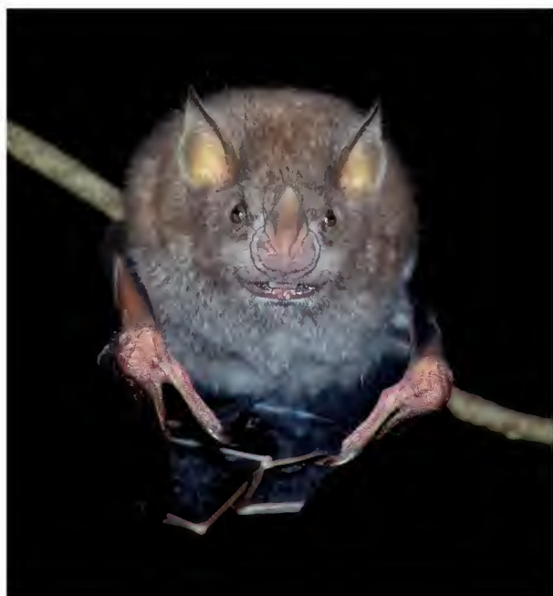
Figure 6. Photograph of a female Ardops nichollsi from the edge of the crater of The Quill on St. Eustatius. Note the large, complex nose-leaf, the white shoulder spot that is visible above the left wing, and the long, grayish pelage characteristic of this species.

Remarks. —Previously, Jones and Schwartz (1967) recognized five subspecies of Ardops nichollsi , where the subspecies montserratensis was comprised of individuals of Ardops nichollsi from Montserrat and St. Eustatius (Fig. 6). Subsequently, this subspecies was reported from Saba (Genoways et al. 2007a), St.