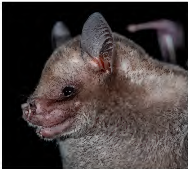
Figure 4. Photograph of a female Brachyphylla cavernarum taken from a mango tree near the F. D. Roosevelt Airport on the island of St. Eustatius. Note the greatly reduced nose-leaf and gray coloration characteristic of this species.

Martinique confirming the placement of St. Eustatius individuals in the nominate subspecies. Individuals from St. Eustatius and Barbuda averaged among the largest in measurements for the subspecies. Carstens et al. (2004) examined the genetic structure of northern Lesser Antillean populations of B. cavernarum , and they included two individuals collected from St. Eustatius in their analyses. Their results showed low genetic diversity (within the mitochondrial cytochrome- b gene) across the islands of St. Maarten, St. Eustatius, Saba, Nevis, and Montserrat. The two individuals examined from St. Eustatius differed by a single nucleotide in cyt-b sequences and these haplotypes were identified on neighboring islands (Carstens et al. 2004). Despite the lack of genetic structure observed in cyt-b gene variation, we recommend additional genetic analyses, perhaps using advanced genetic approaches appropriate for population-level genetic resolution (for example, high-throughput Restriction site Associated DNA Sequencing; RAD-seq), of Caribbean populations of B. cavernarum .