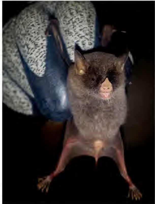
Figure 3. Photograph of a female Monophyllus plethodon , which was the first individual of this species captured on St. Eustatius. This bat was taken at the edge of the crater of The Quill. Note the elongated rostrum, simple nose-leaf, and presences of a tail characteristic of this species.

On this evening the Dutch Team set a 3-m net at a height of 5 m in the middle of the hiking trail from Yellow Rock where it comes near to the edge of the crater of The Quill, and a 7-m net was placed at a right angle to the 3-m net along the rim of the crater. These nets were undoubtedly set near where the American Team