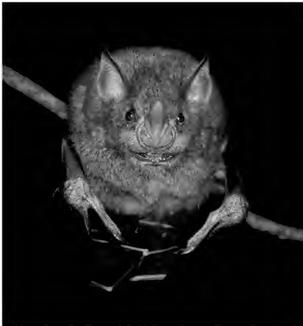
Figure 6. Photograph of a female Ardops nichollsi from the edge of the crater of The Quill on St. Eustatius. Note the large, complex nose-leaf, the white shoulder spot that is visible above the left wing, and the long, grayish pelage characteristic of this species.

Remarks. —Previously, Jones and Schwartz (1967) recognized five subspecies of Ardops nichollsi , where the subspecies montserratensis was comprised of individuals of Ardops nichollsi from Montserrat and St. Eustatius (Fig. 6). Subsequently, this subspecies was reported from Saba (Genoways et al. 2007a), St.