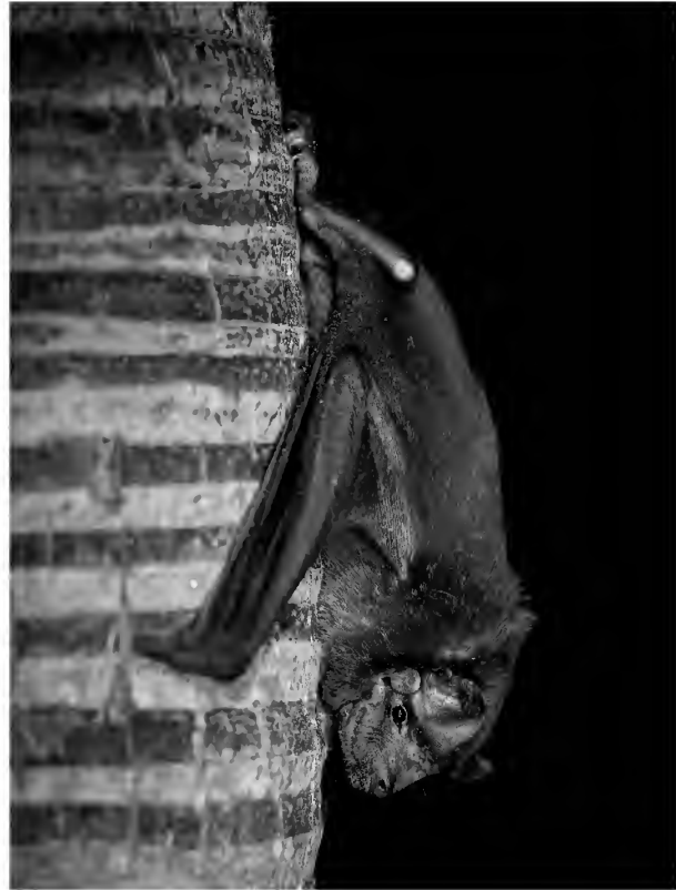
Figure 7. Photograph of Molossus molossus from swimming pool of the Kings Well Resort on the island of St. Eustatius. Note the short, rounded ears, nearly naked face, and chestnut-black coloration characteristic of this species. The tail that is free beyond the edge of the uropotagium, characteristic of all bats of the family Molossidae, is difficult to see between the feet of this individual.

Remarks. —This common “house bat” is widely distributed throughout the archipelago and was expected on St. Eustatius (Fig. 7). Koopman (1968) first reported specimens of this species from St. Eustatius without reference to specific specimens or localities. Husson (1962) restricted the type locality of M. molossus to the island of Martinique, which led Dolan (1989) based on morphometrics to apply the name M. m. molossus to this species throughout the Lesser Antilles. Lindsey and Ammerman (2016) included specimens