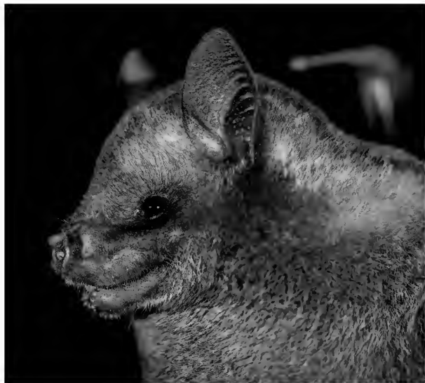
Figure 4. Photograph of a female Brachyphylla cavernarum taken from a mango tree near the F. D. Roosevelt Airport on the island of St. Eustatius. Note the greatly reduced nose-leaf and gray coloration characteristic of this species.

Martinique confirming the placement of St. Eustatius individuals in the nominate subspecies. Individuals from St. Eustatius and Barbuda averaged among the largest in measurements for the subspecies. Carstens et al. (2004) examined the genetic structure of northern Lesser Antillean populations of B. cavernarum , and they included two individuals collected from St. Eustatius in their analyses. Their results showed low genetic diversity (within the mitochondrial cytochrome- b gene) across the islands of St. Maarten, St. Eustatius, Saba, Nevis, and Montserrat. The two individuals examined from St. Eustatius differed by a single nucleotide in cyt-b sequences and these haplotypes were identified on neighboring islands (Carstens et al. 2004). Despite the lack of genetic structure observed in cyt-b gene variation, we recommend additional genetic analyses, perhaps using advanced genetic approaches appropriate for population-level genetic resolution (for example, high-throughput Restriction site Associated DNA Sequencing; RAD-seq), of Caribbean populations of B. cavernarum .