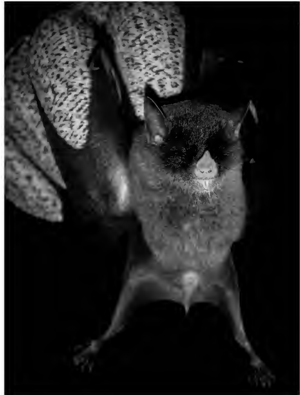
Figure 3. Photograph of a female Monophyllus plethodon , which was the first individual of this species captured on St. Eustatius. This bat was taken at the edge of the crater of The Quill. Note the elongated rostrum, simple nose-leaf, and presences of a tail characteristic of this species.

On this evening the Dutch Team set a 3-m net at a height of 5 m in the middle of the hiking trail from Yellow Rock where it comes near to the edge of the crater of The Quill, and a 7-m net was placed at a right angle to the 3-m net along the rim of the crater. These nets were undoubtedly set near where the American Team