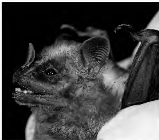
Figure 5. Photograph of a male Artibeus jamaicensis from swimming pool of the Kings Well Resort on the island of St. Eustatius. Note the large nose-leaf, white stripe over the eye, and brown coloration, all characteristic of this species.

Hispaniola, Puerto Rico, St. John, and Dominica (Genoways et al. 2001). P. Larsen et al. (2007) included 10 individuals of A. jamaicensis collected from St. Eustatius in their phylogenetic analysis of the Artibeus jamaicensis complex. Their results show a single mitochondrial cytochrome- b haplotype shared among the 10 individuals and this haplotype was also shared with individuals collected from a wide geographical distribution, ranging from Quintana Roo, Mexico, eastward to Jamaica and Puerto Rico, throughout the northern Lesser Antilles, and as far south as Carriacou in the Grenadines. The results of P. Larsen et al. (2007) support the hypothesis of a recent Caribbean colonization by A. jamaicensis (perhaps within the last ~25,000 years) originating from Central American populations and expanded rapidly to the east across the Greater Antilles and Lesser Antilles. Carstens et al. (2004) identified a similar lack of genetic variation across the northern Lesser Antilles; however, their analyses also identified three A. schwartzi mitochondrial haplotypes on the islands of Montserrat, Nevis, and St. Kitts (see P. Larsen et al. 2007 and P. Larsen et al. 2010). The existence of A. schwartzi mitochondrial haplotypes circulating in northern Lesser Antillean populations of A. jamaicensis provides evidence of historical or ongoing hybridization (P. Larsen et al. 2010). Moreover, this observation suggests gene-flow from southern