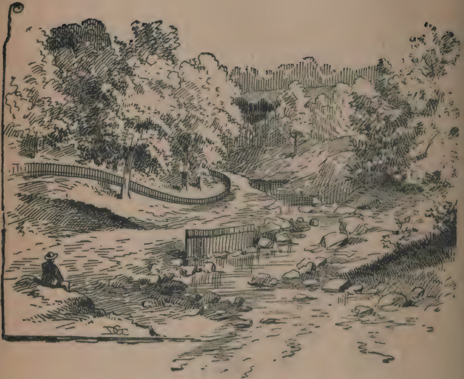
BURNETT'S CREEK AND BATTLE GROUND, FROM THE WEST.