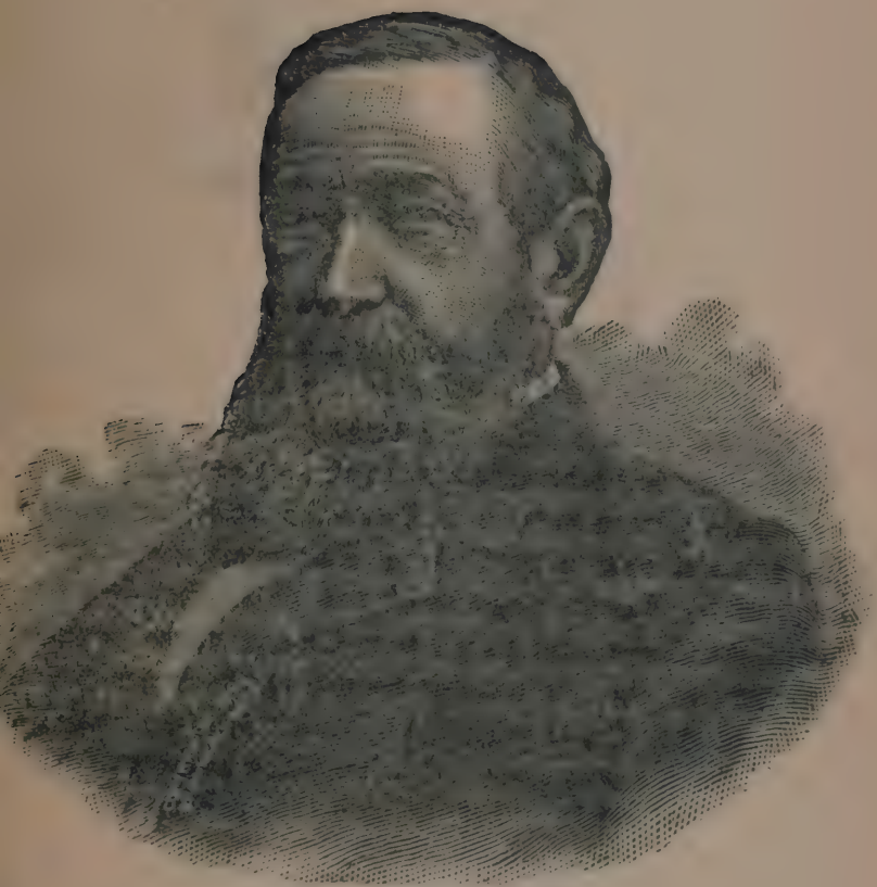
GENERAL BENJAMIN HARRISON.