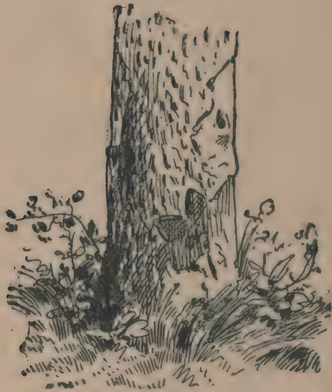
A BATTLE-SCARRED OAK.