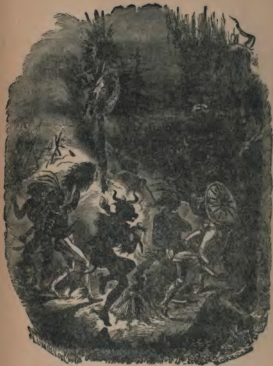
INDIAN WAR DANCE.

[From Famous Frontiersmen. Pioneers and Scouts; published by W. H. Harrison, Jr., Publishing Co., Chicago.]