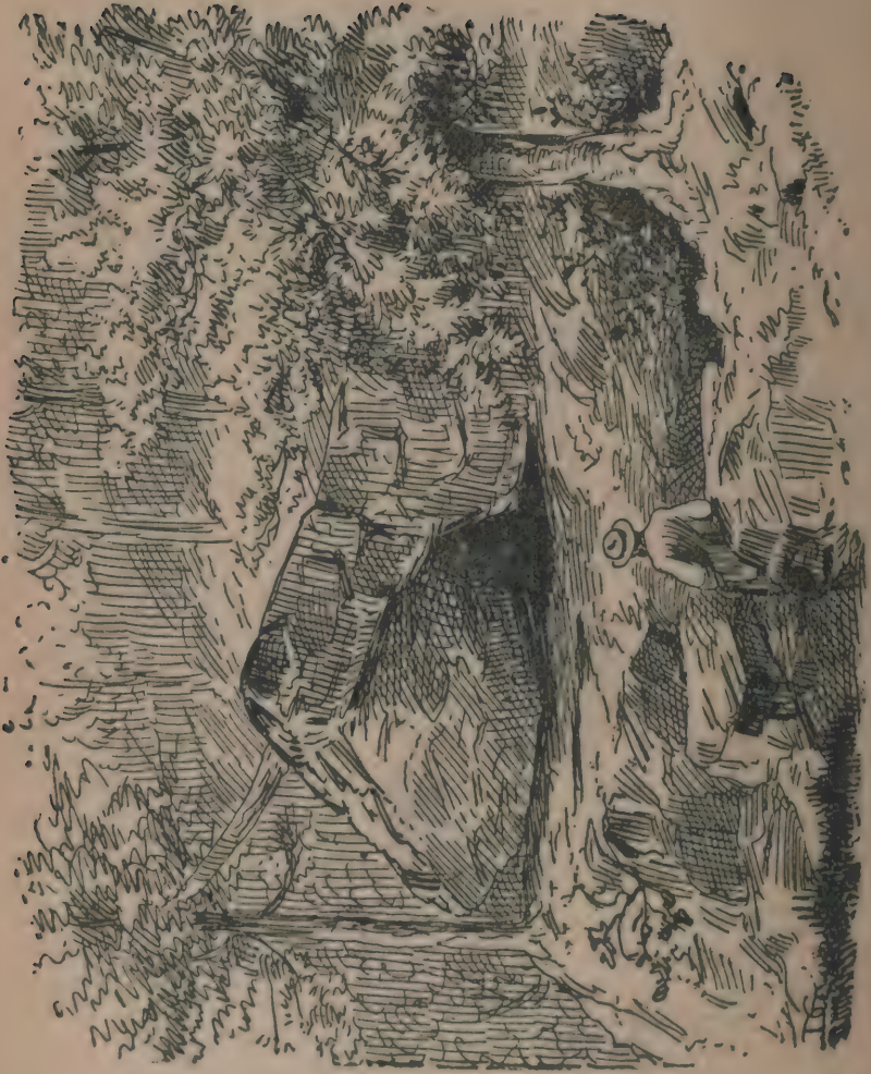
PROPHET'S ROCK AND RATTLE-SNAKE CAVE.