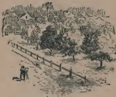
PRESENT SITE OF PROPHET'S TOWN.

number of horses belonging to settlers were stolen. They were tracked to the town of Tippecanoe and were surrendered to the searching company, but were retaken by the Indians who appeared to regret that they had delivered them to the whites.