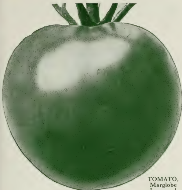
TOMATO, Marglobe Improved