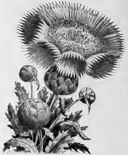
Centaurea imperialis (see page 11)