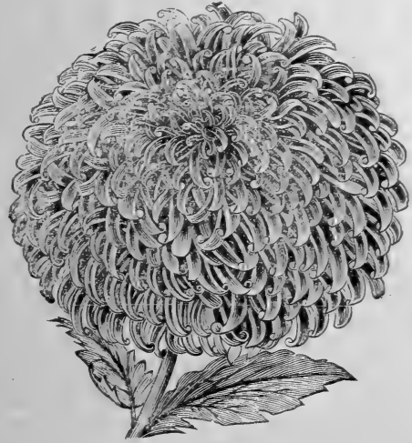
Giant Comet Aster