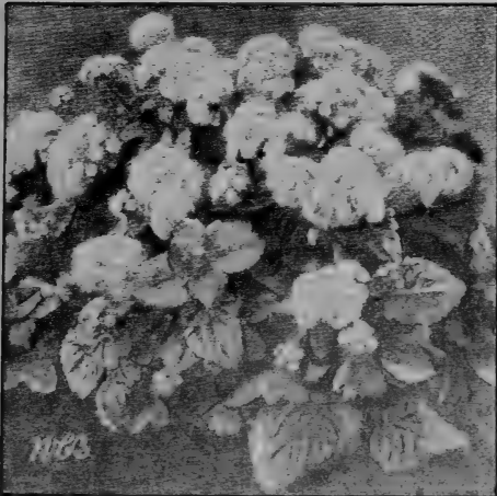
Blue Perfection Ageratum