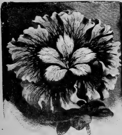
Petunia grandiflora quadricolor (see page 14)