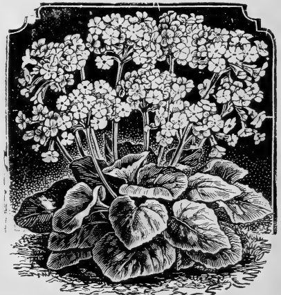
Primula obconina grandiflora