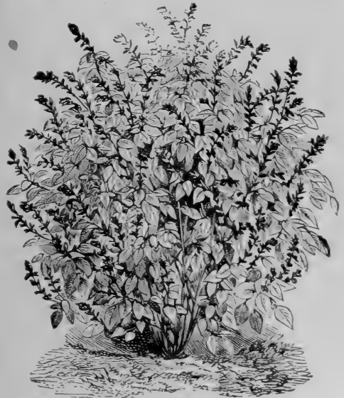
Salvia splendens, Bonfire