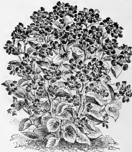
Begonia Dwarf Vernon