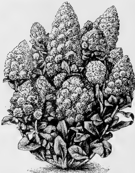
Mignonette Machet (see page 13)