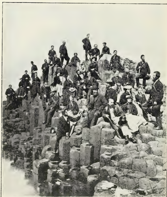
B.N.F.C. at Giant's Causeway, 1868.