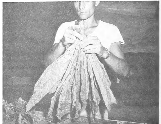
Figure 2.--A uniform hand of good quality Maryland leaf.

The 1953 crop, which brought 54 cents a pound, was supported under the Federal loan program, as were the 1949 and 1950 crops. Of the 40 million pounds produced in 1953, 33 millions went directly to users on the Maryland markets. About 7 millions were placed under Government loan. The 1954 crop brought slightly less than