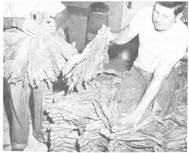
Figure 3.--Care in packing the basket can pay off at the auction.

Changes in daily average prices paid for Maryland tobacco are to a considerable extent the result of variations in quality of leaf offered for sale. However, prices of tobacco of the same quality, as measured by Federal grades, do fluctuate from day to day. There is little price variation in the very top grades and in the lowest grades, but the medium grades, which sold at 20 to 60 cents a pound in 1955, fluctuate considerably.