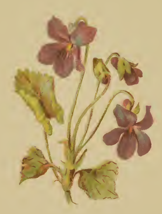
"The flower fadeth: but the word of our God shall stand for ever." Isaiah xl. 8.

"Consider the lilies of the field."-MATT. vi. 28.