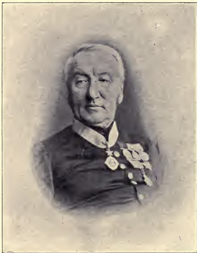
MAJOR-GENERAL SIR H. M. DURAND, R.E., C.B., K.C.S.I.