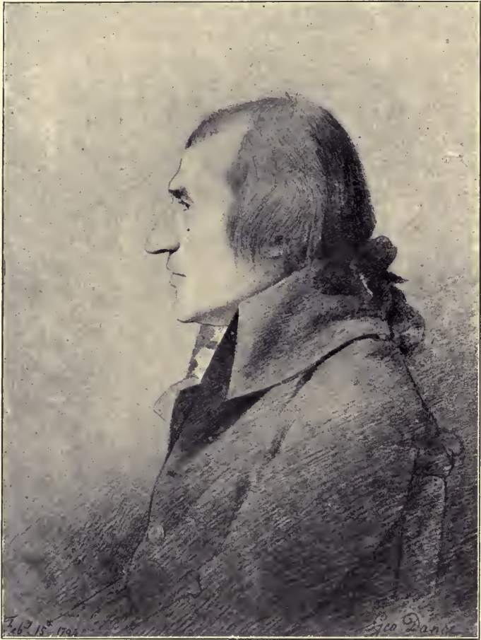
MAJOR JAMES RENNELL, F.R.S.