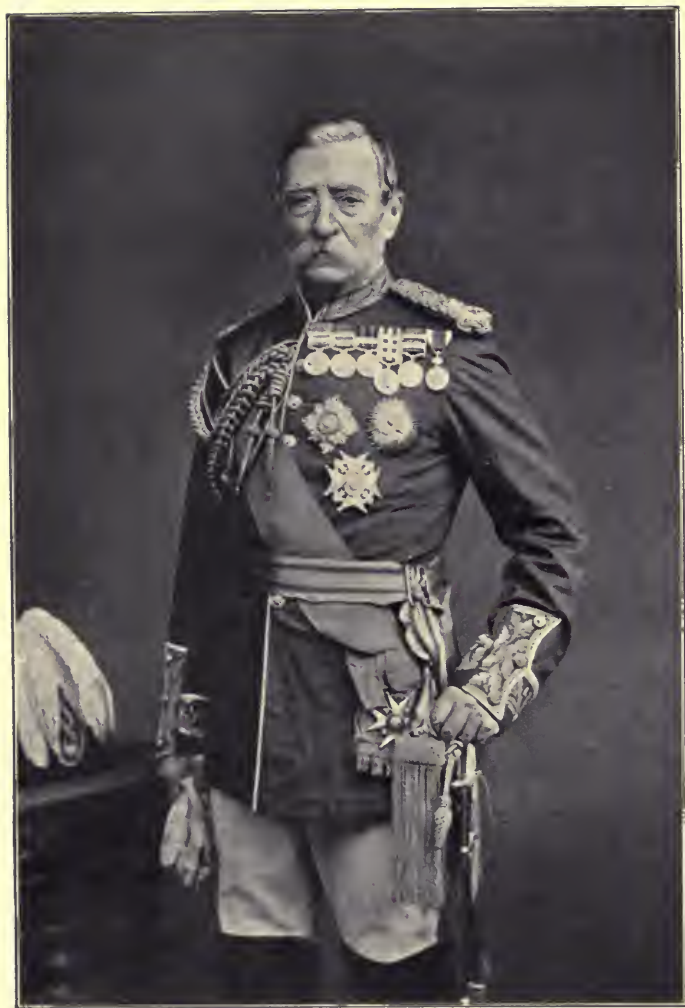
FIELD-MARSHAL LORD NAPIER OF MAGDALA.