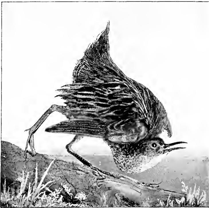
Florida Clapper-rail. Rallus longirostris scottii (Senn).

Not wishing in any way to disparage the many patient workers whose lives have been given to the preservation of birds and other animals, yet one must seek in these