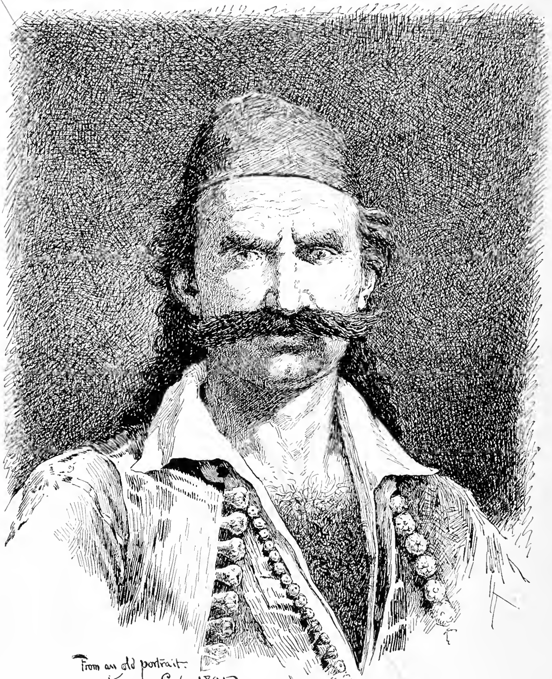
From an old portrait. Kenyon Cox, 1895.