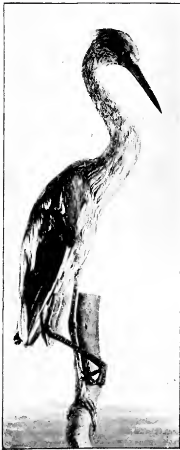
Little Blue Heron.