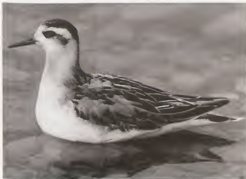
Grey Phalarope, Phalaropus fulicarius , Winterset, 15th–18th September. (R. C. Hart)