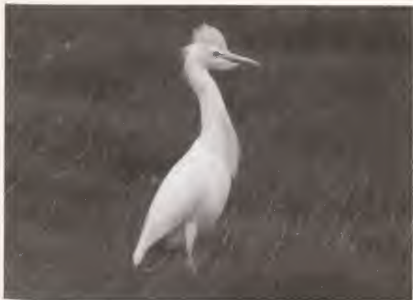
Cattle Egret, Bubulcus ibis, Hornsea Mere, 6th–14th May.