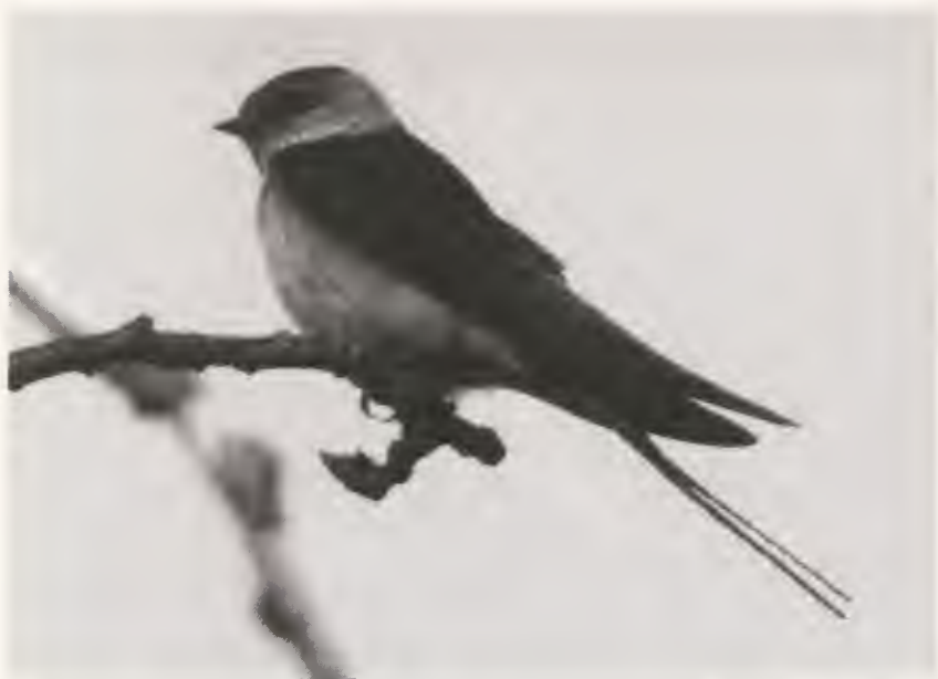
Red-rumped Swallow, Hirundo daurica, Flamborough, 28th–31st May.