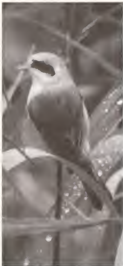
Penduline Tit, Remiz pendulinus, Hay-a-Park G.P., 19th–20th September.