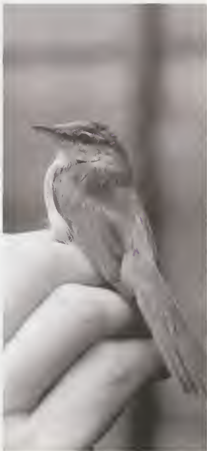
Paddyfield Warbler, Acrocephalus agricola , Flamborough, 27th September. ( P. A. Lassey )