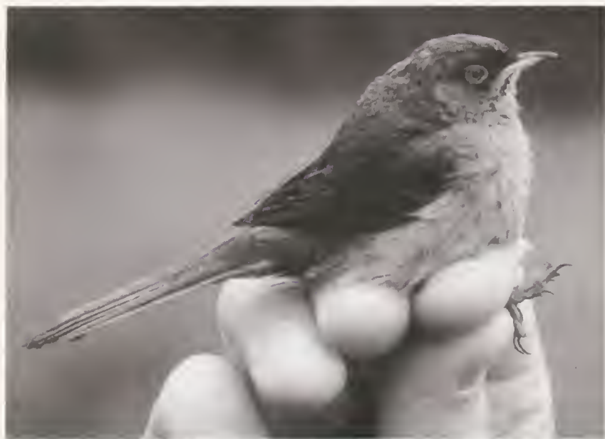
Marmora's Warbler, Sylvia sarda, Spurn, 8th–9th June.