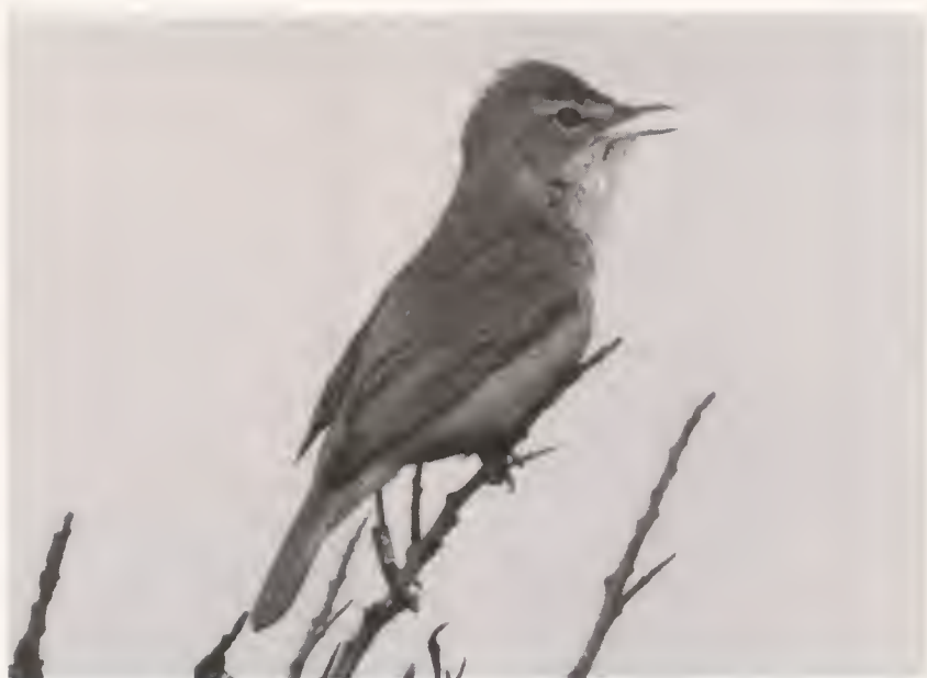
Booted Warbler, Hippolais caligata, Spurn, 11th–22nd June.