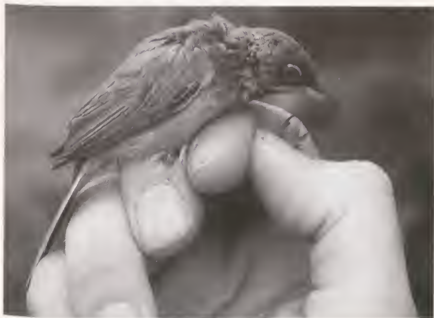
Spectacled Warbler, Sylvia conspicillata , Filey, 24th–29th May. (I. Robinson)