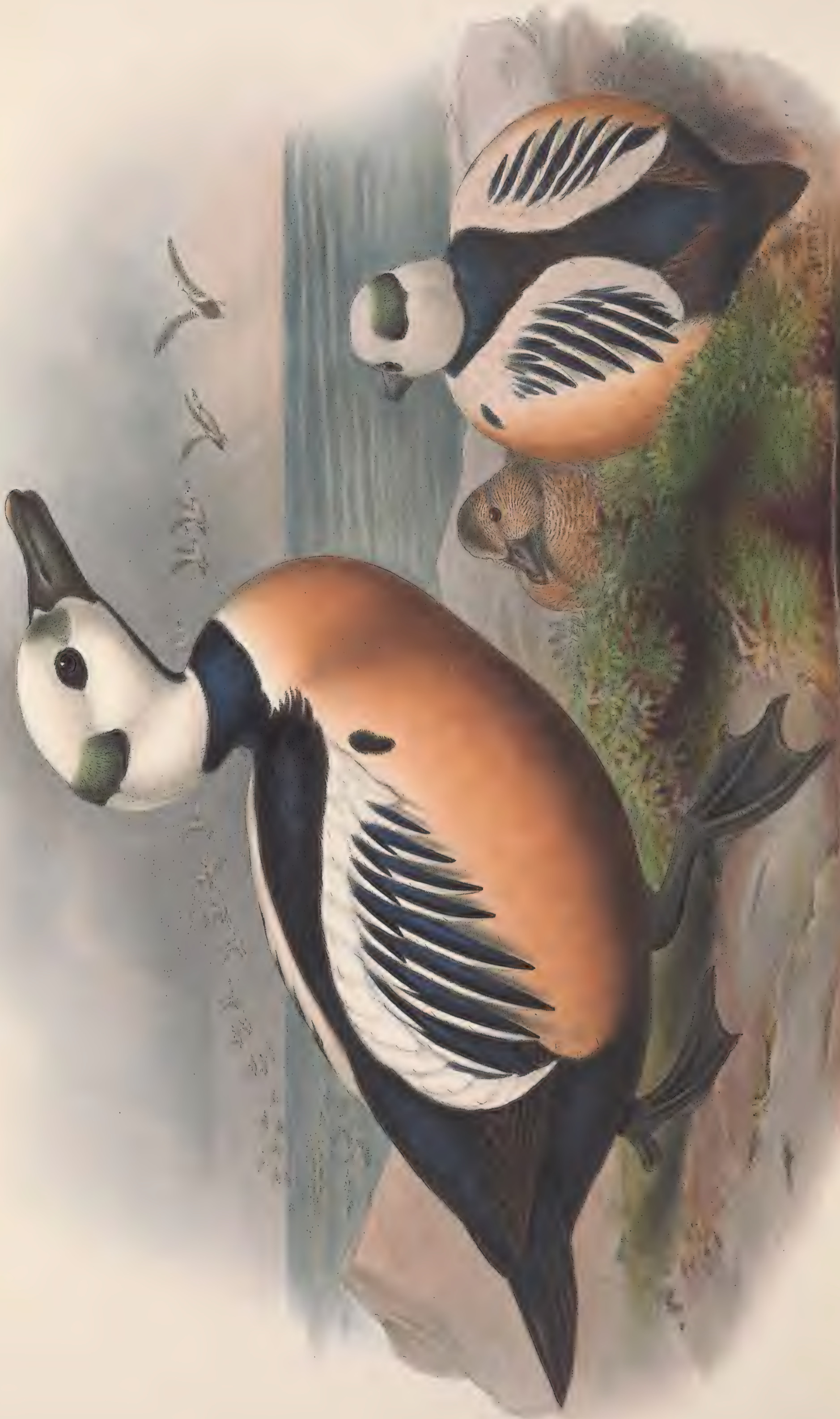
W. N. COOPER'S STELLER'S