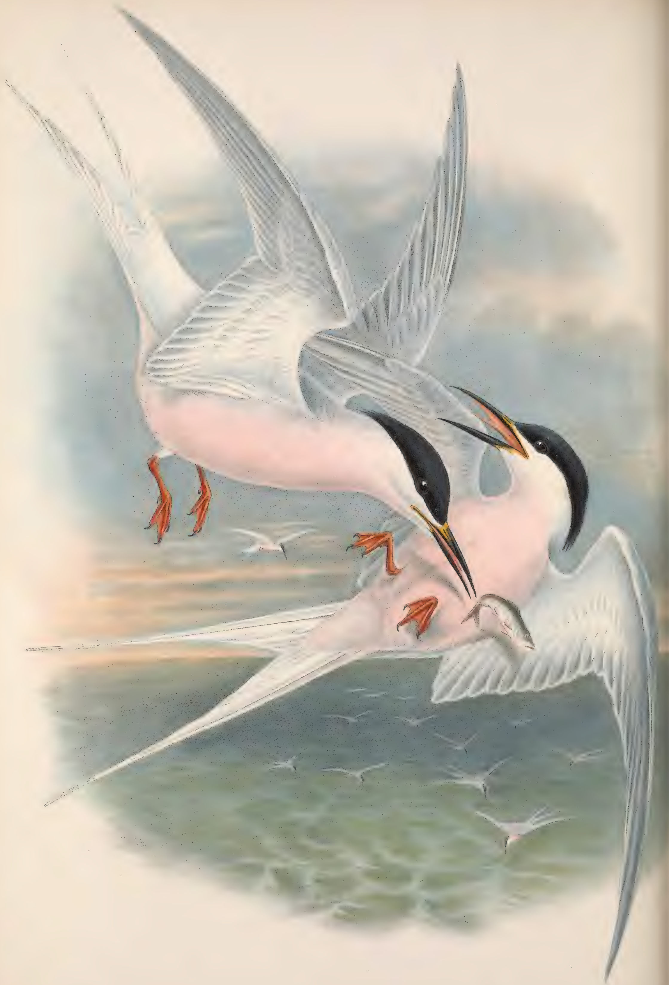
STERNA PARADISEA. Brunn.