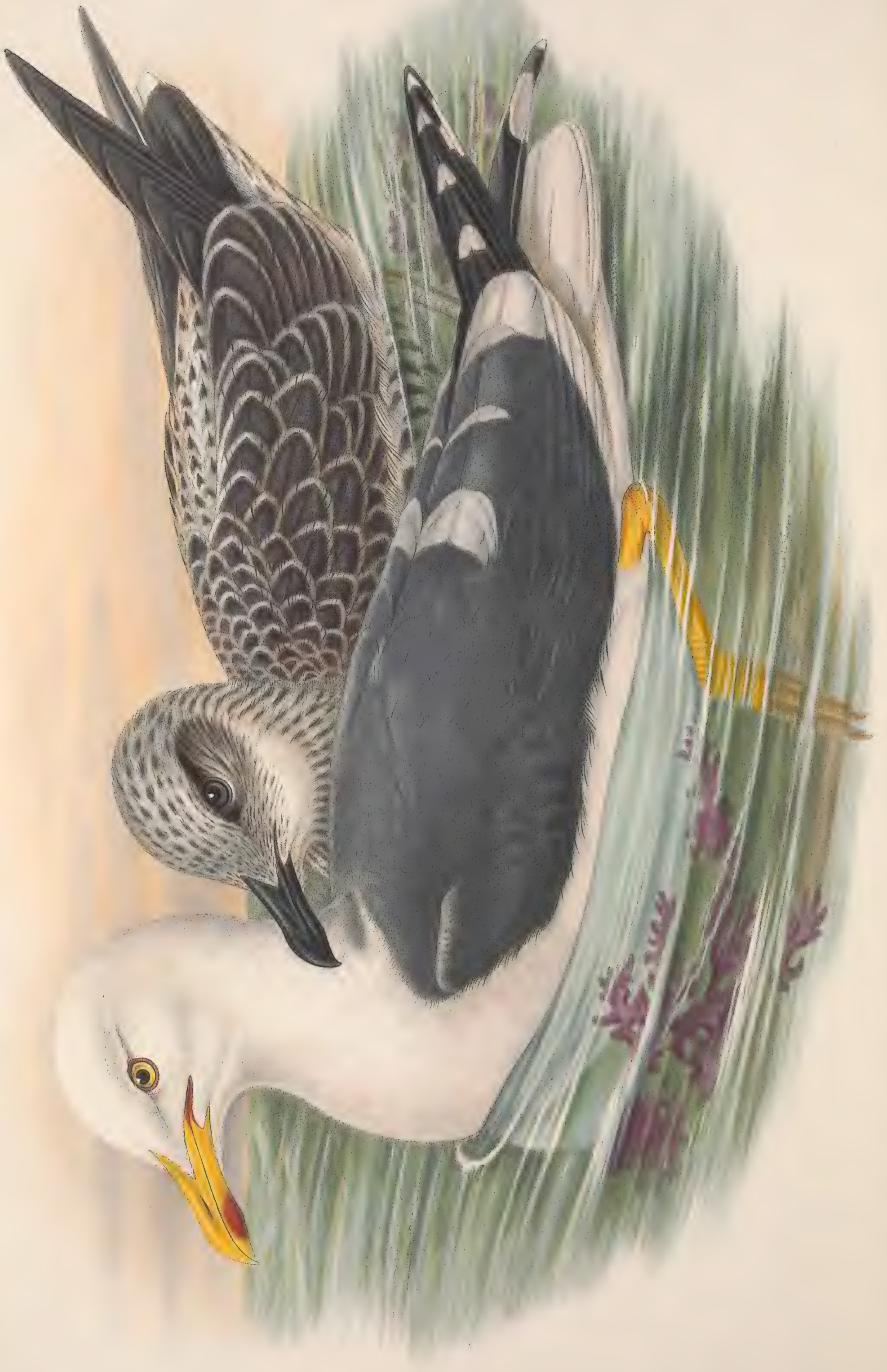
LARUS FUSCUS, Linn.