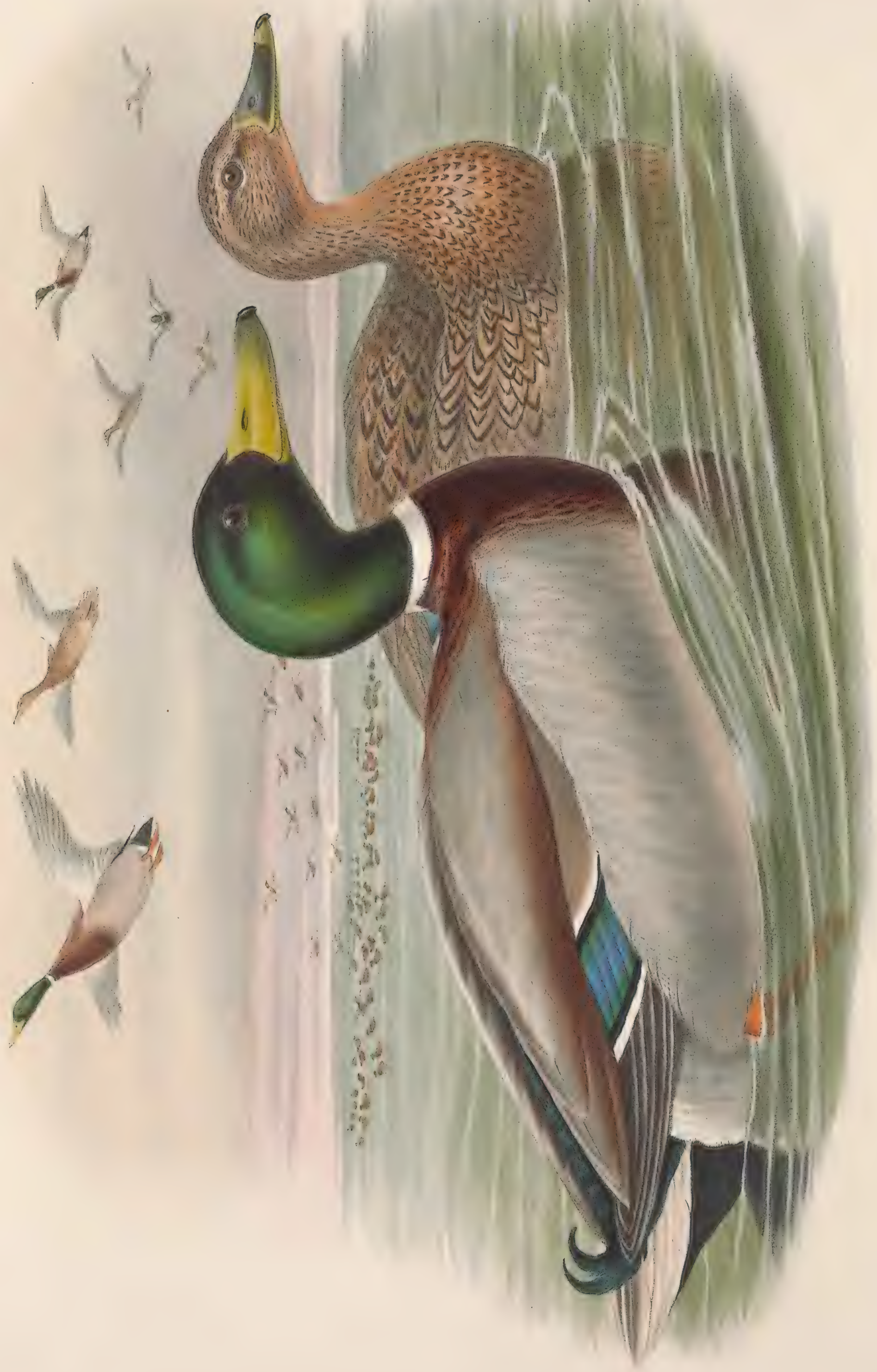
ANAS BOSCHAS, Linn.