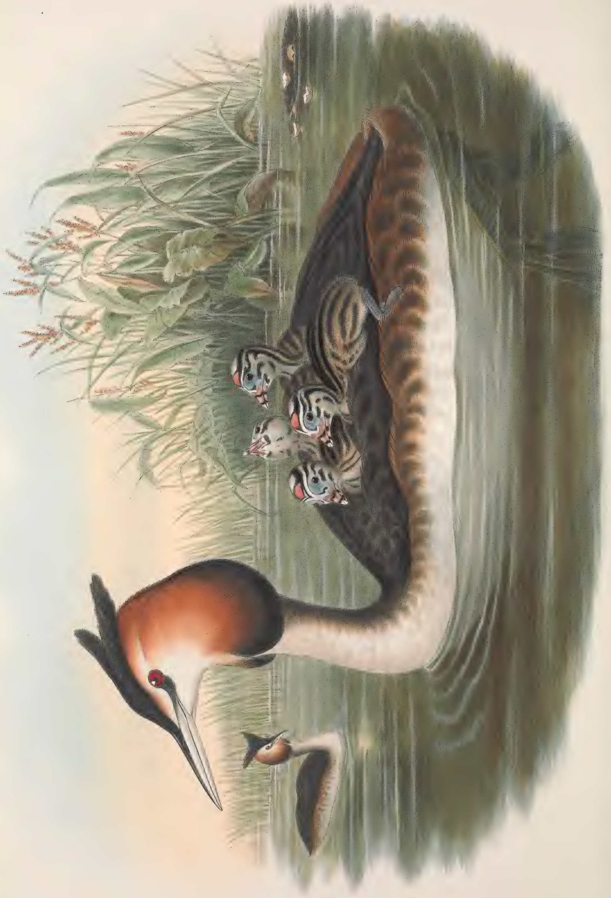
PODICEPS CRISTATUS, Linn.