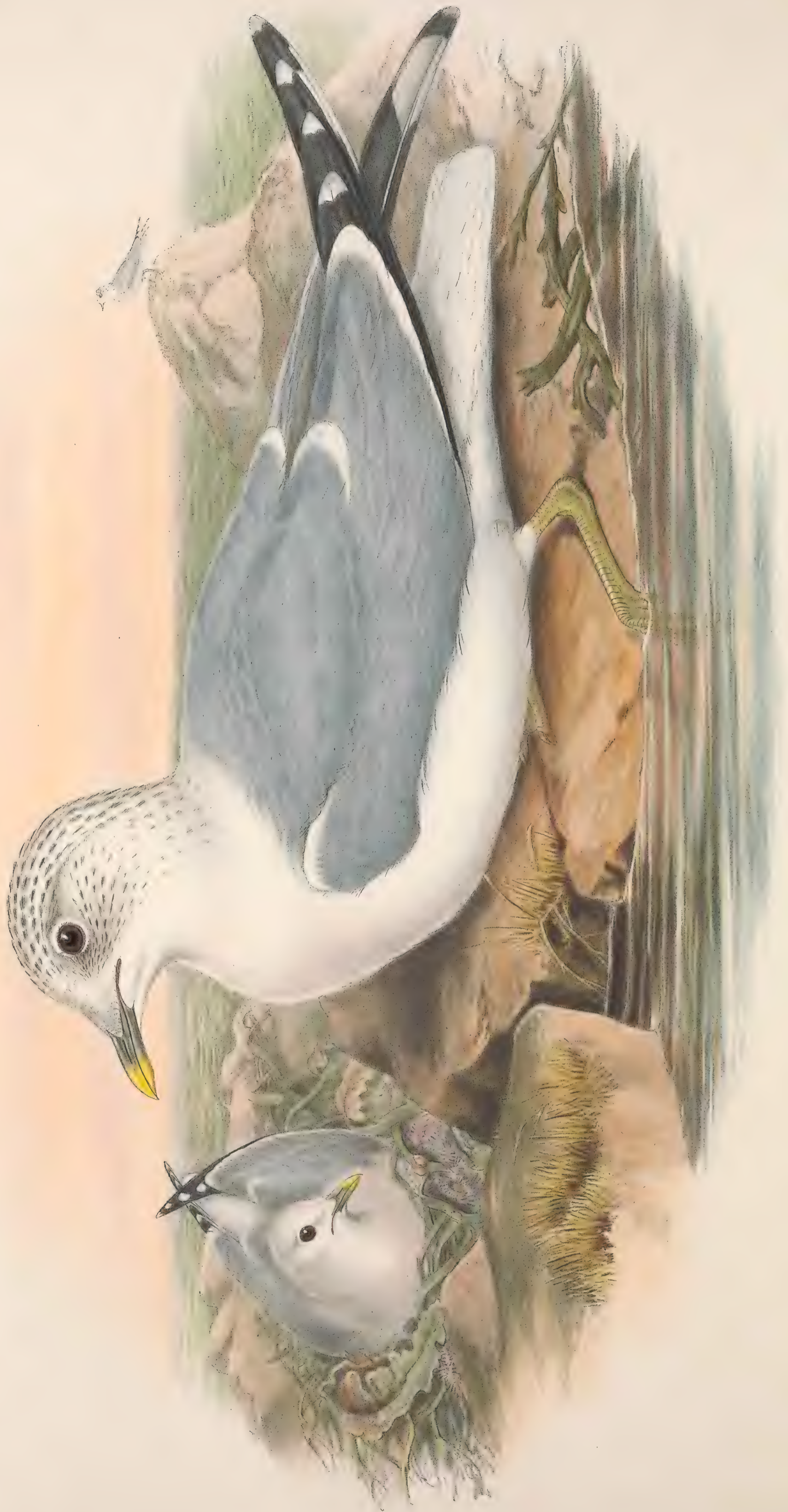
LARUS CANUS. Linn.