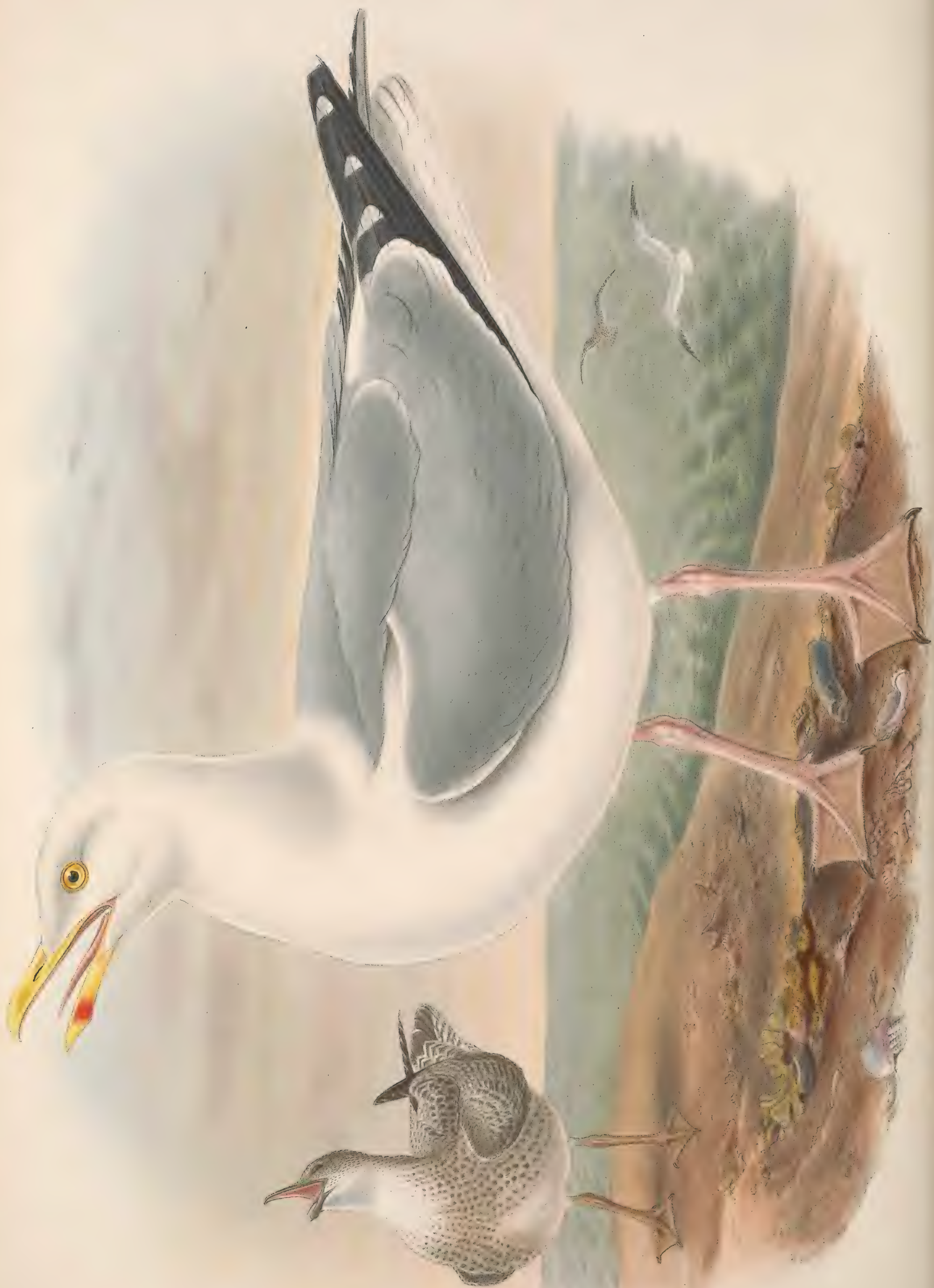
LARUS ARGENTATUS. Herring