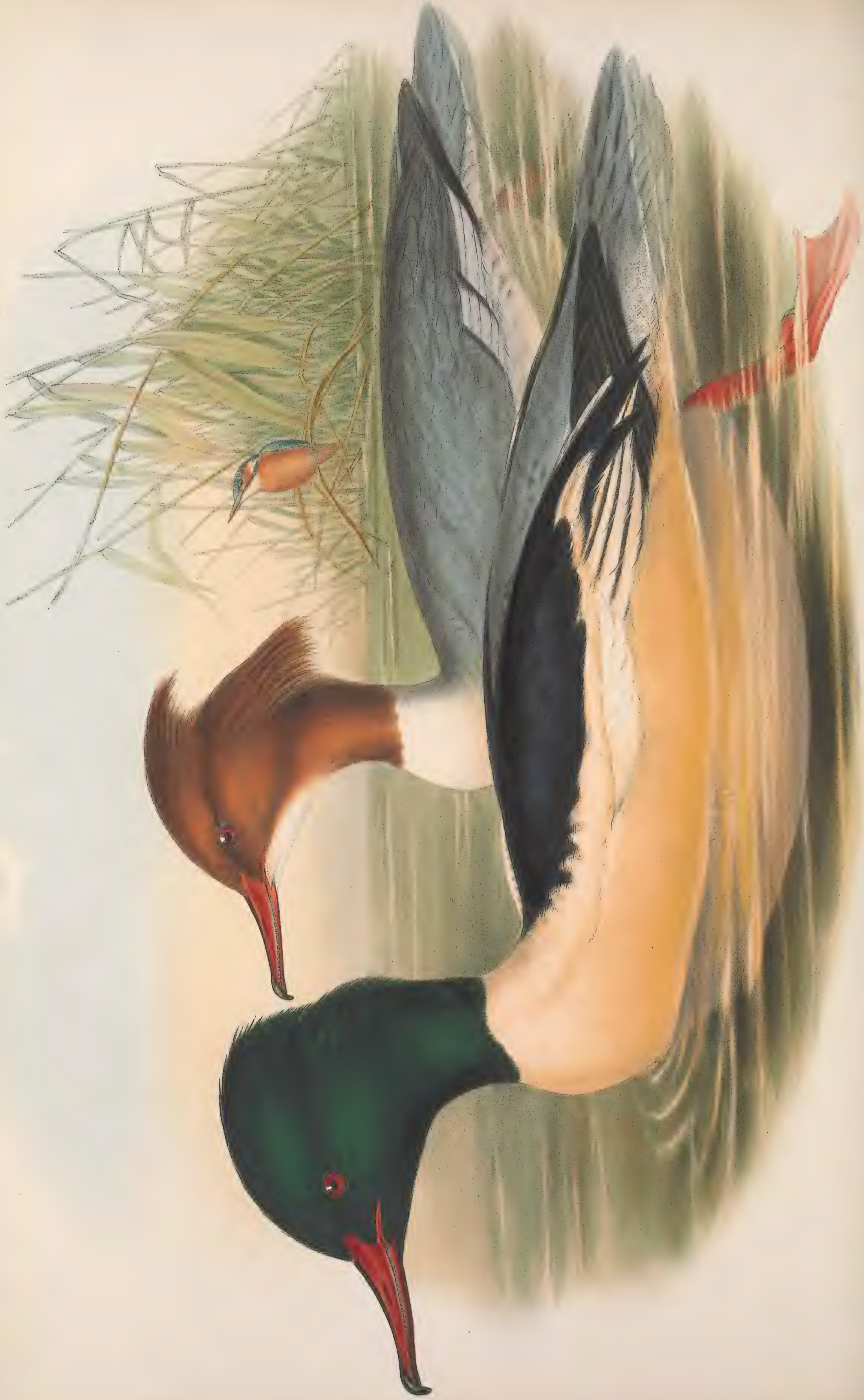
MERGUS CASTOR, Linn.