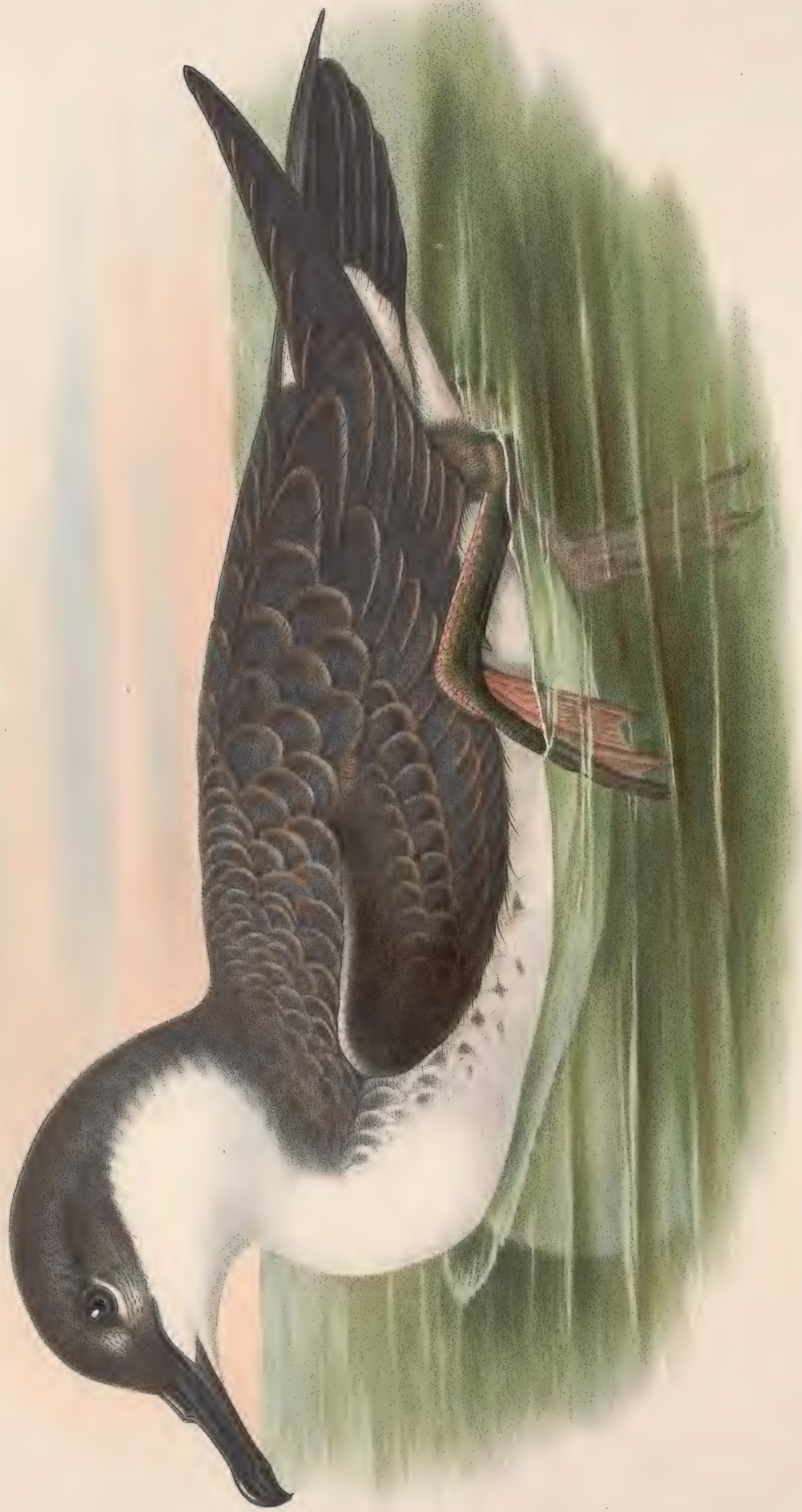
PUFFINUS MAJOR, Fab.