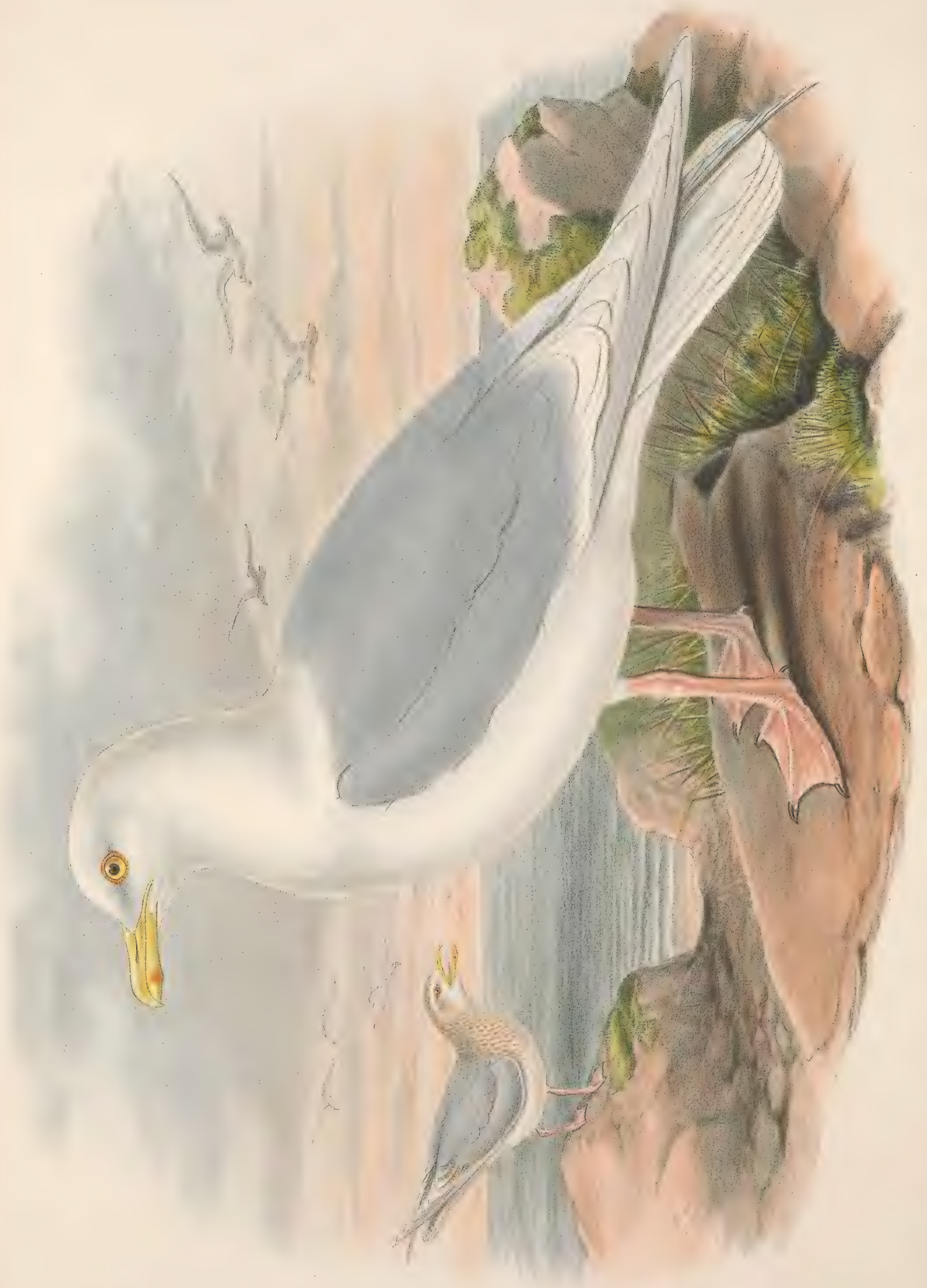
HARUS ISLANDICUS, Edm.