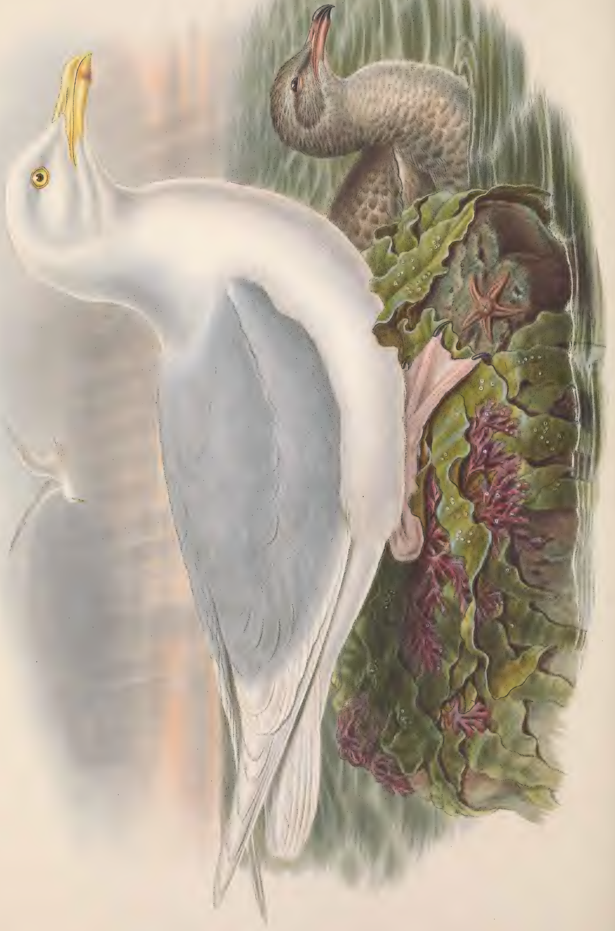
LARUS GLAUCUS, Brunn.