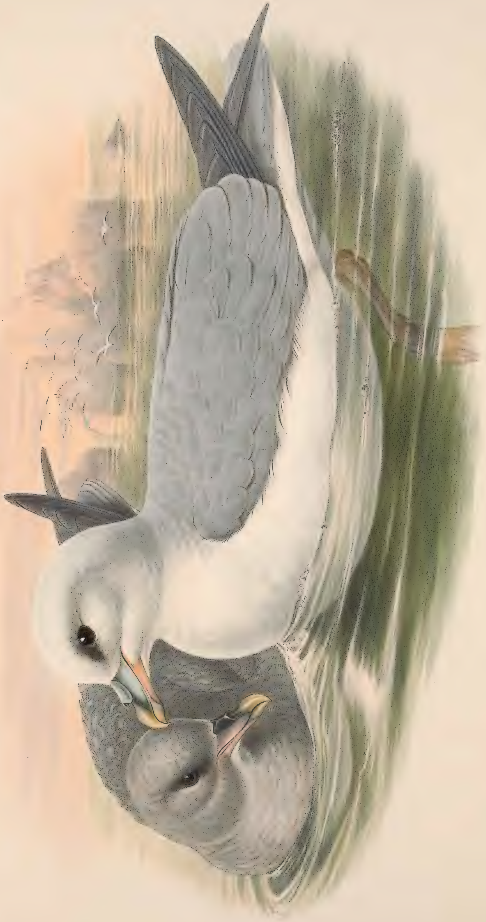
PROCELLARIA GLACIALIS, Linn.