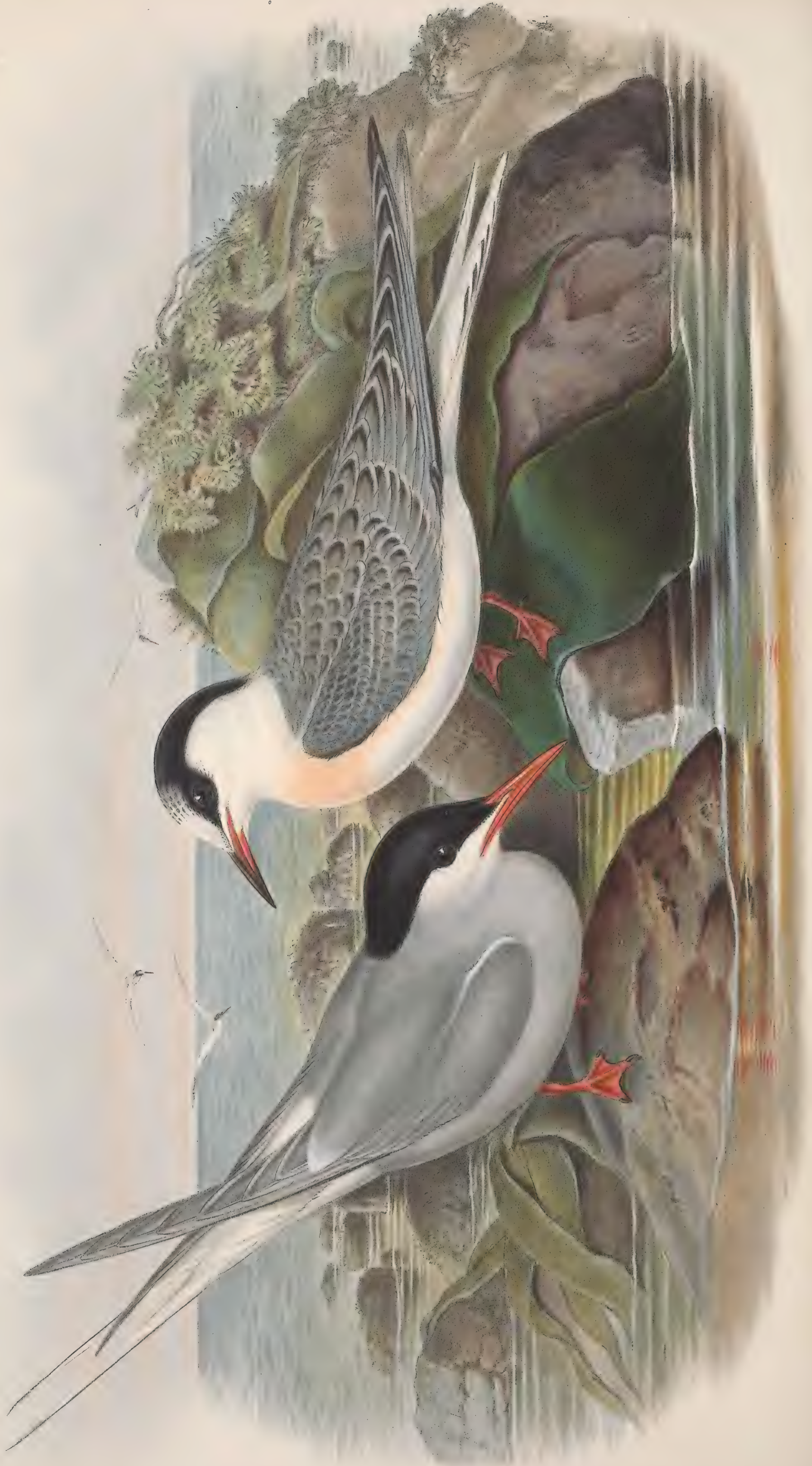
S T ERNA M A C R U R A, Naum.