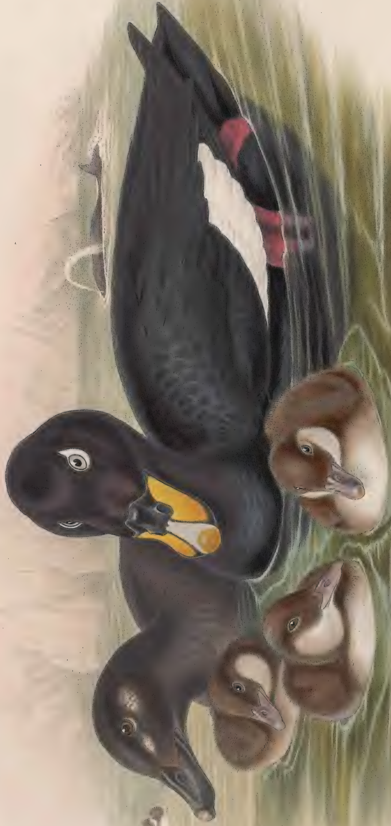
OIDEMIA FUSCA .