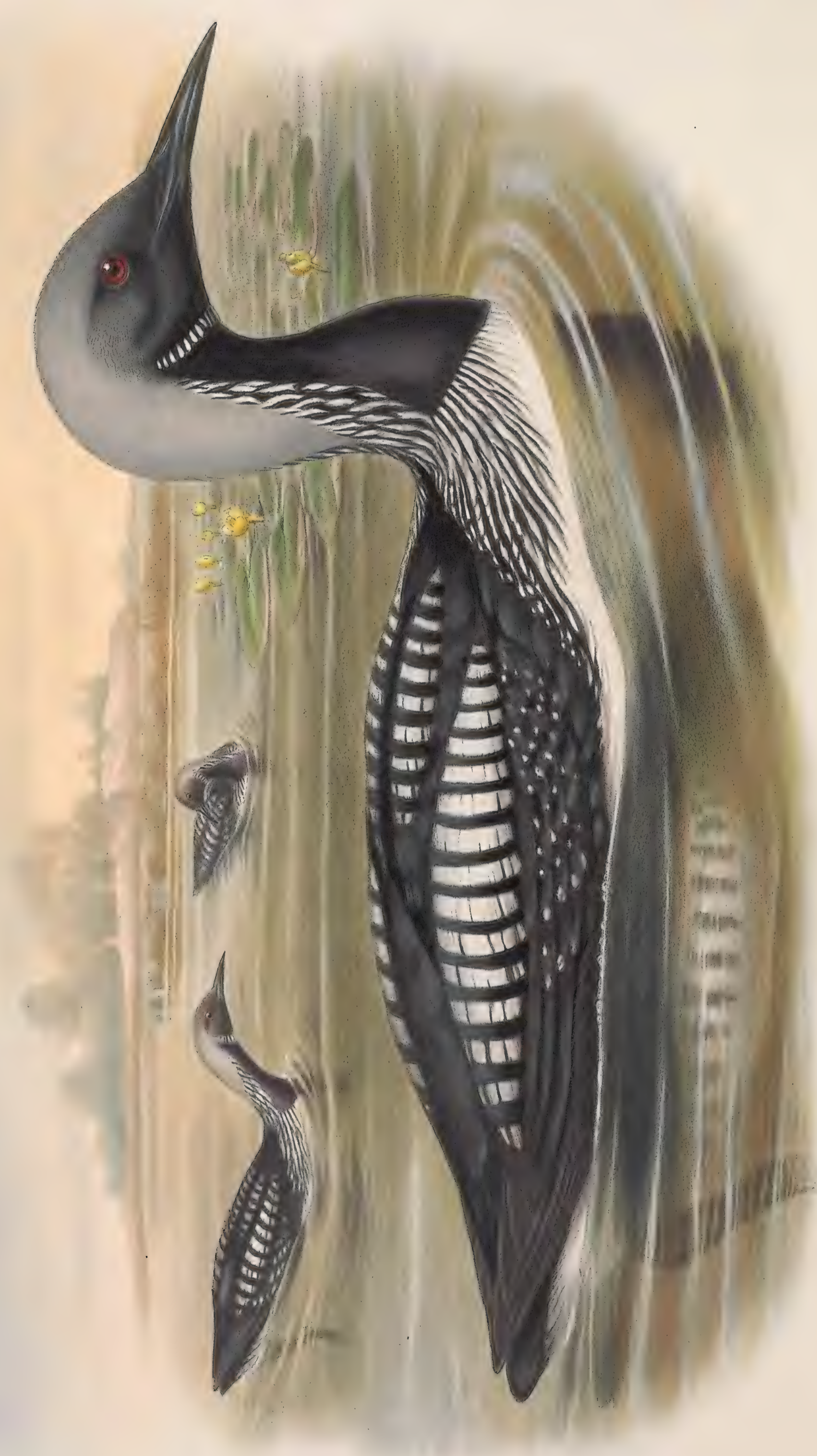
COTYMBUS ARCTICUS, Linn.