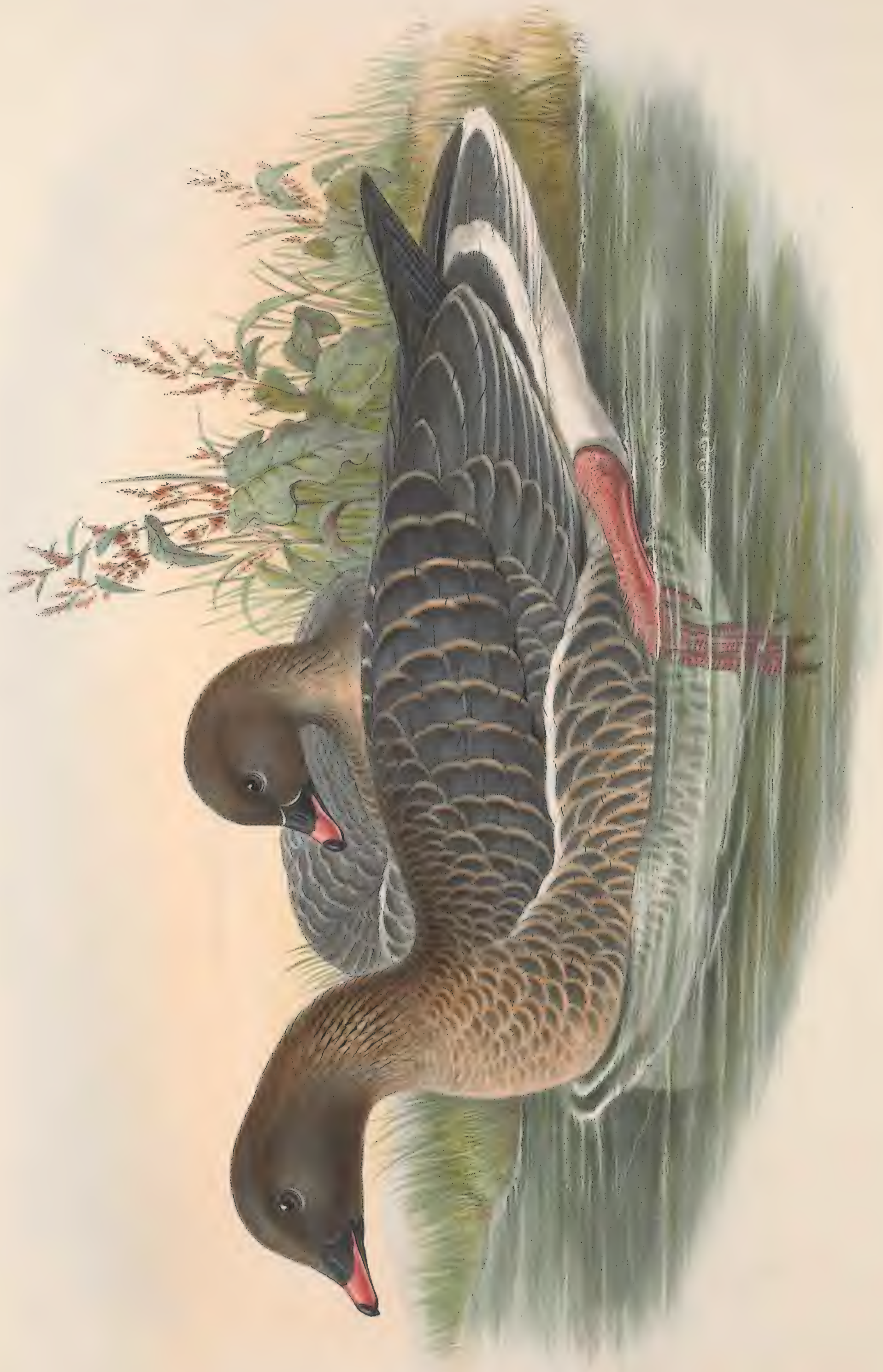
ANSER BRACHYRHYNCHUS, Baill.