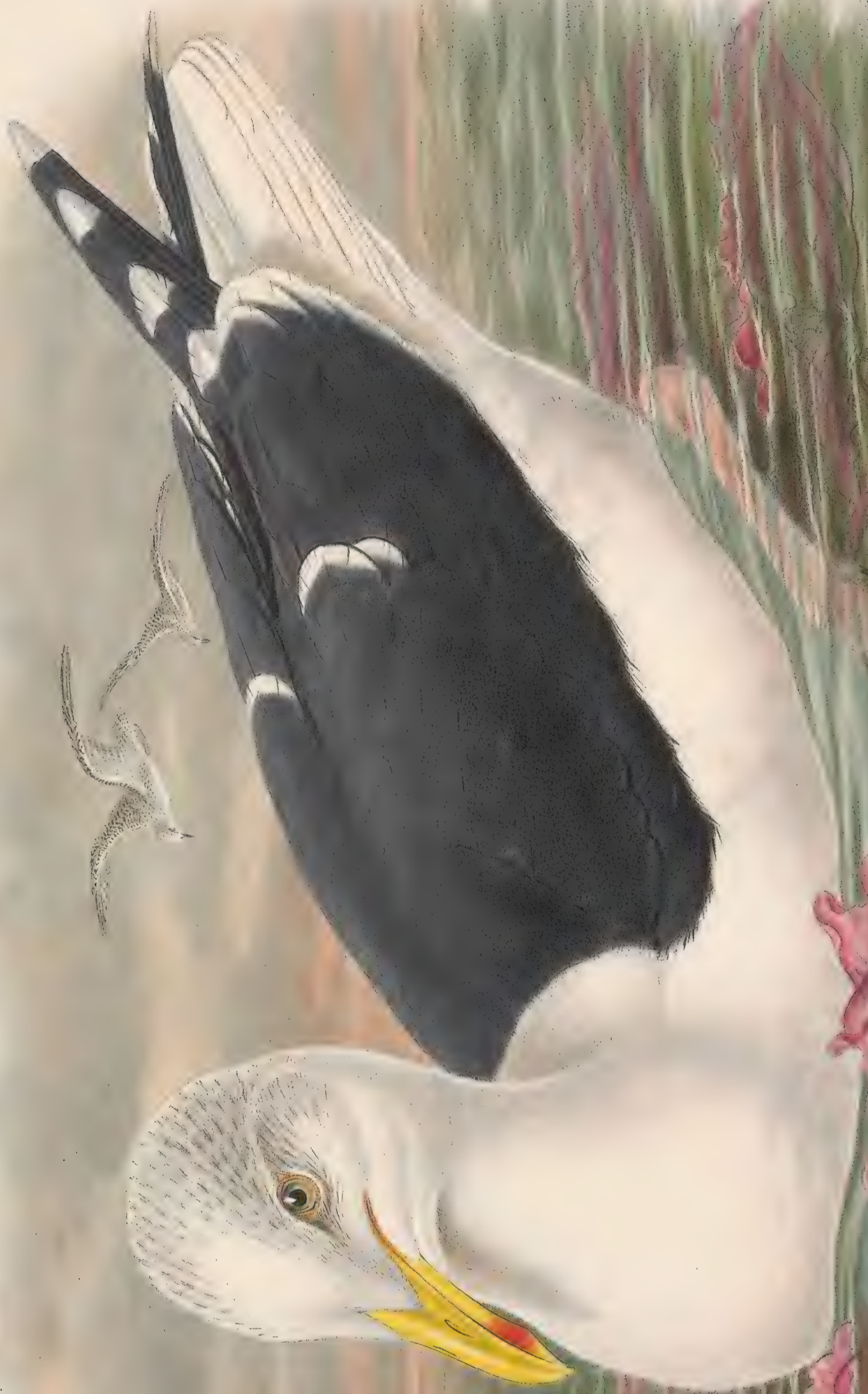
LARUS MARINUS, Linn.