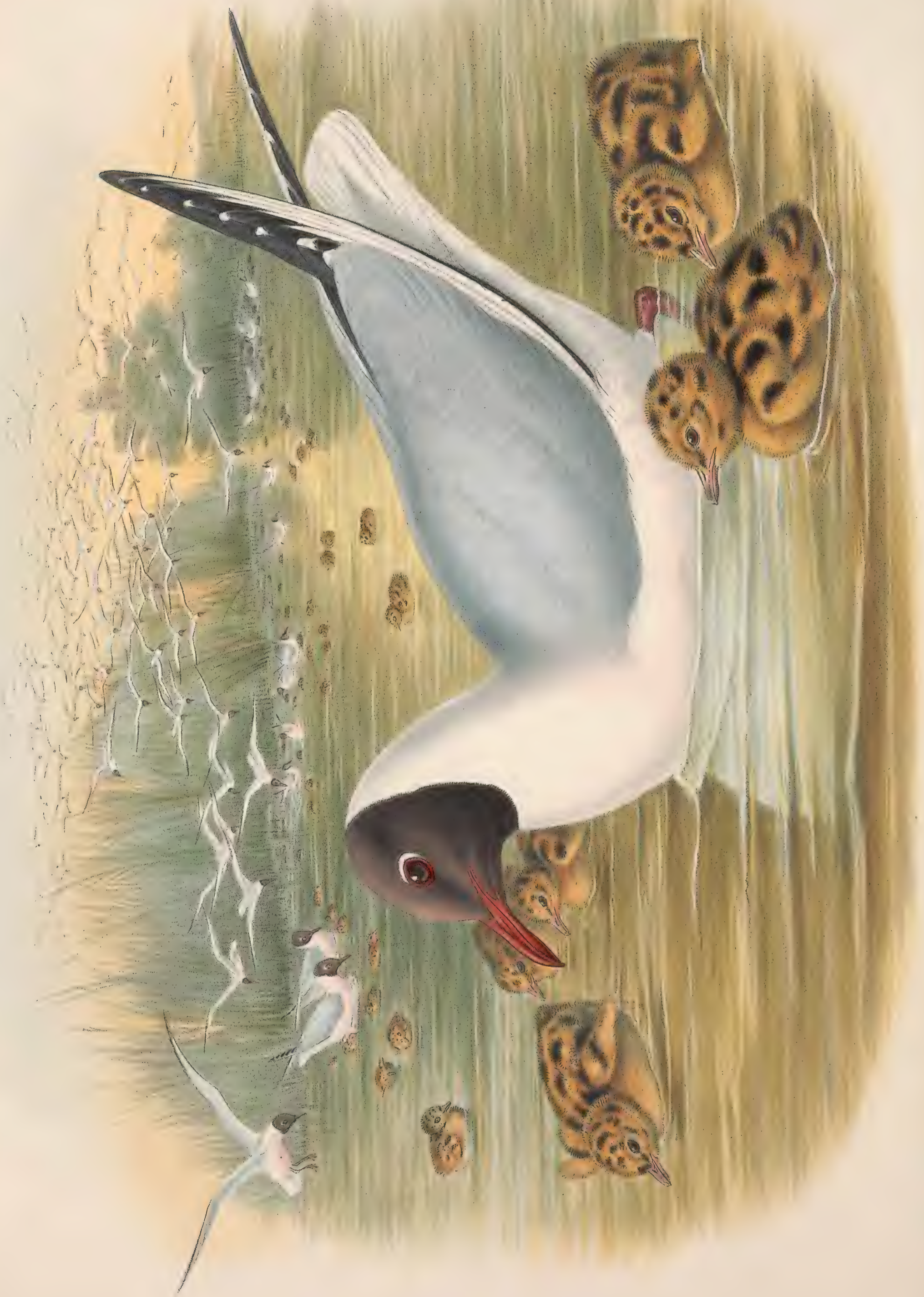
CYPRIC OCEPIALIS RUDIBUNDUS.