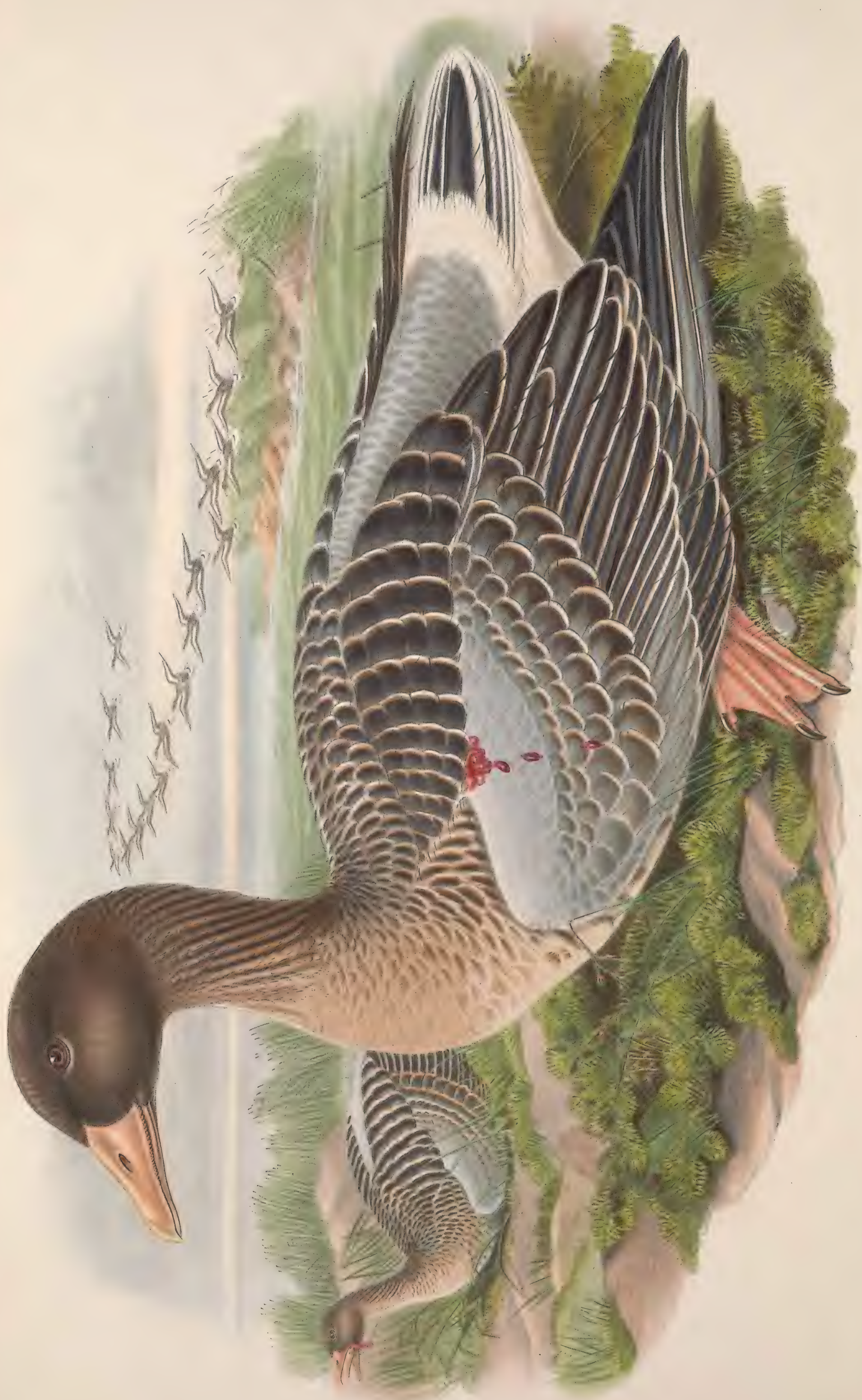
ANSER FERUS, Steph.