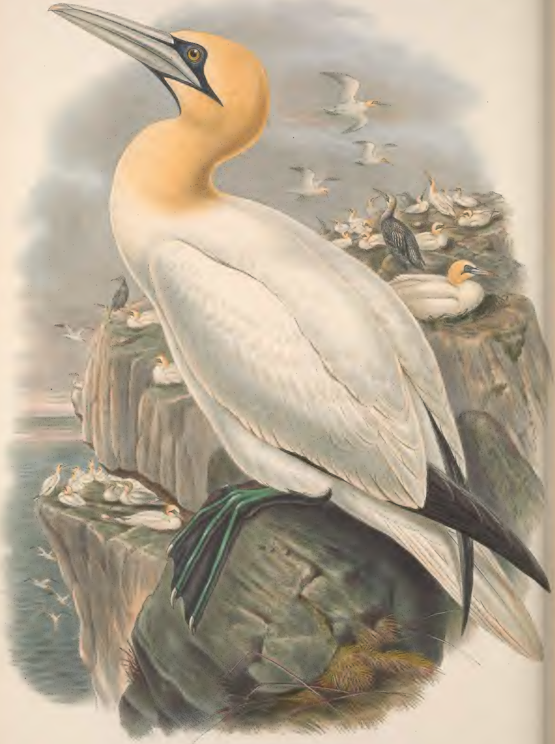
SULA BASSANA, Linn.