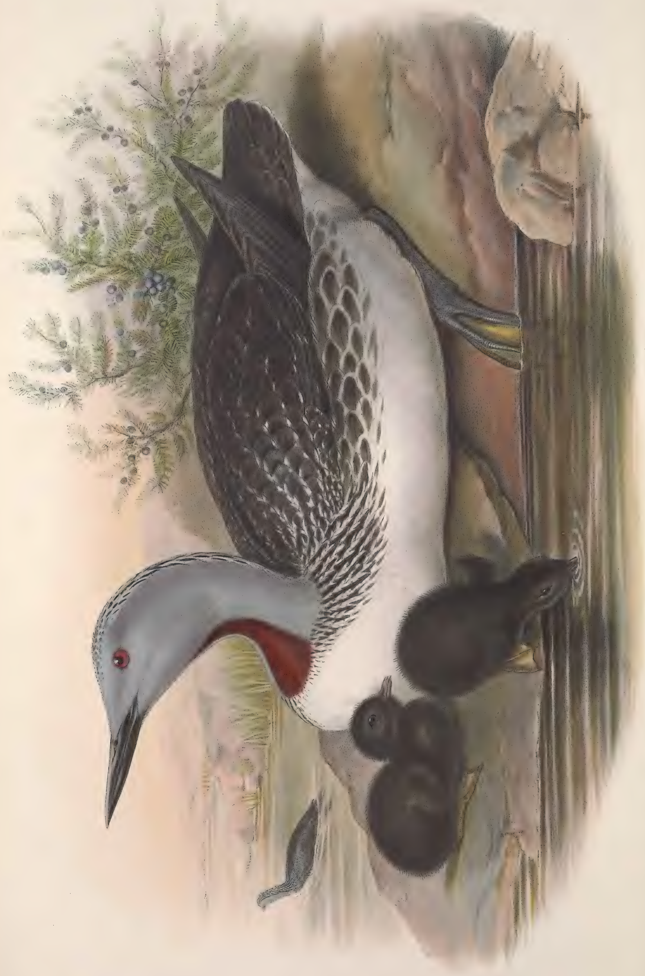
CORYMBUS SERPENTINARIUS, Linn.