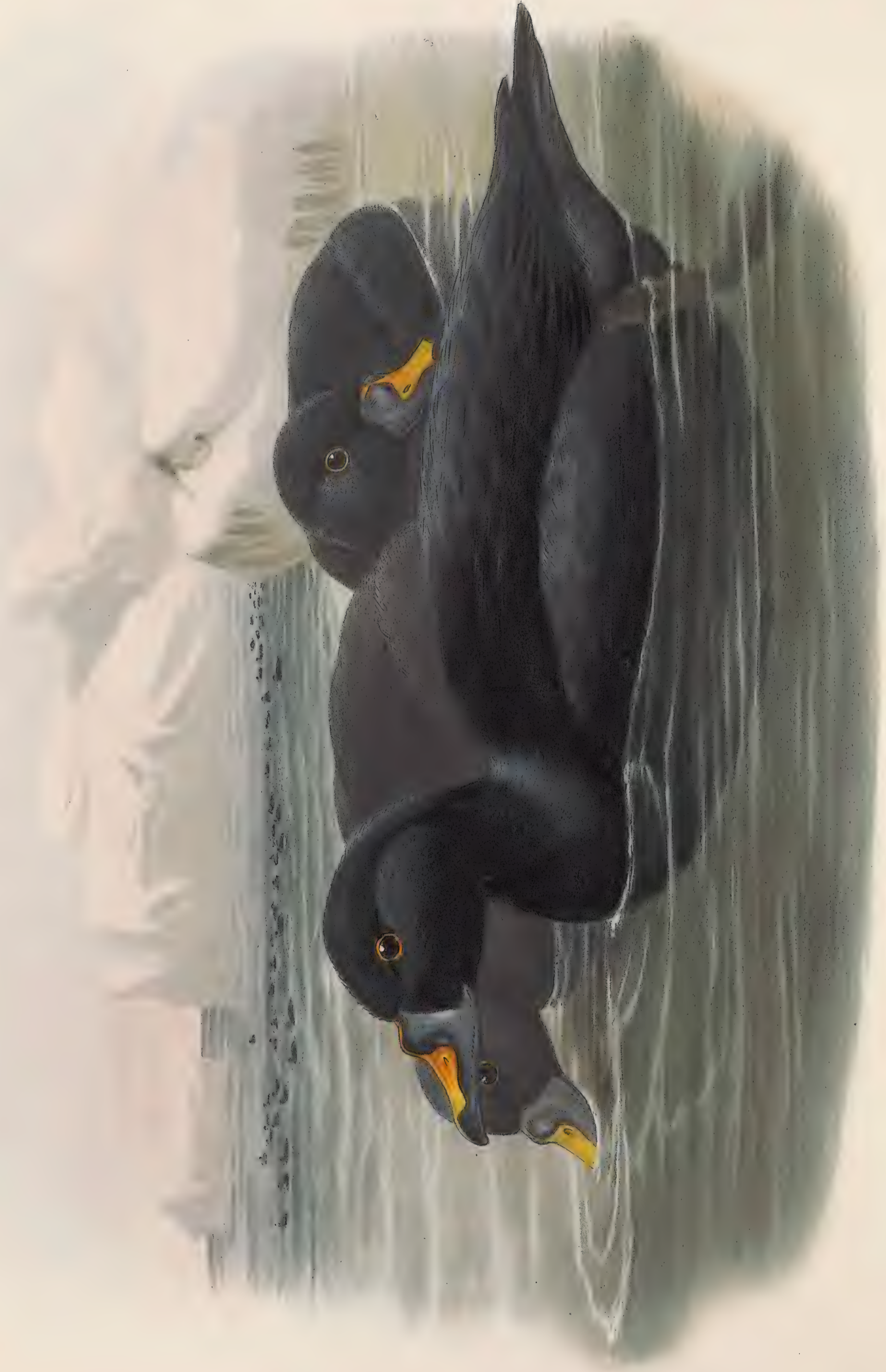
OIDE MIA NIGRA.

Oidemia nigra