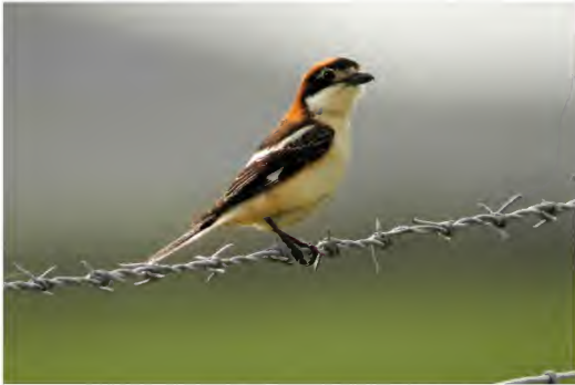
Above at Aberdaron