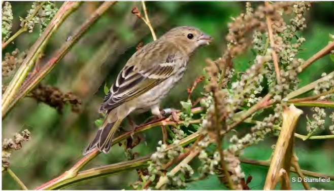
Rosefinch, Bardsey