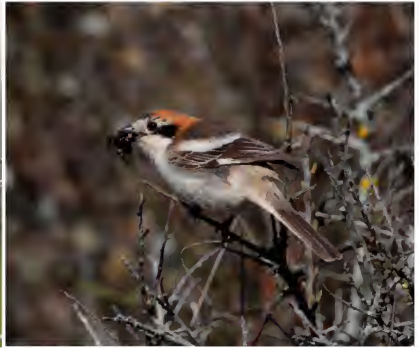
Above at St. David's.