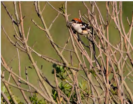
Above at Kenfig