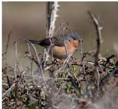
Subalpine Warblers, left at Skokholm and right at St. David's.