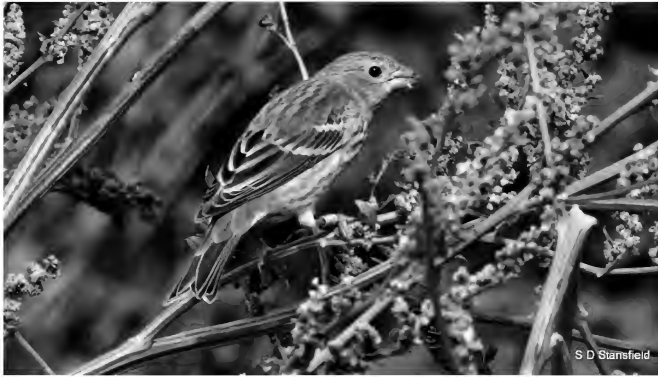
Rosefinch, Bardsey