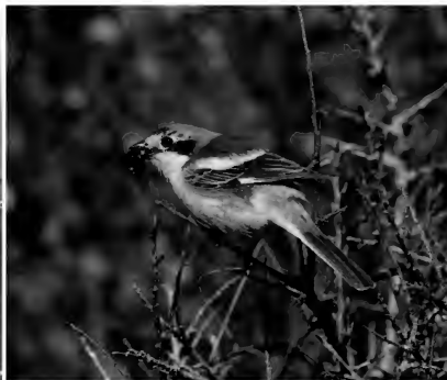
Above at St. David's