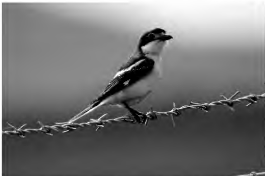
Above at Aberdaron