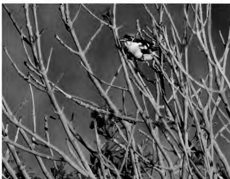
Above at Kenfig