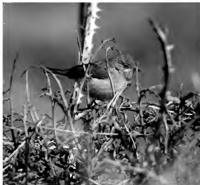
Subalpine Warblers, left at Skokholm and right at St. David's.