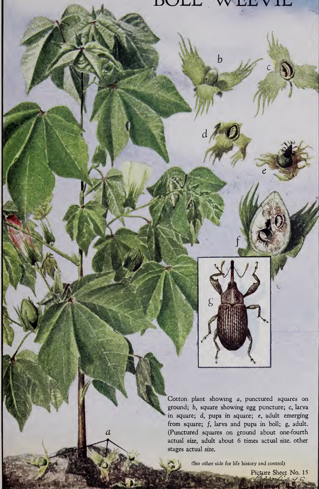
Cotton plant showing a, punctured squares on ground; b, square showing egg puncture; c, larva in square; d, pupa in square; e, adult emerging from square; f, larva and pupa in boll; g, adult. (Punctured squares on ground about one-fourth actual size, adult about 6 times actual size. other stages actual size.)

(See other side for life history and control)