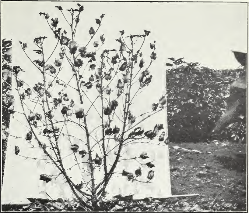
FIG. 1.—YOUNG EGYPTIAN COTTON PLANT DENUED OF LEAVES, SHOWING LARGE LIMBS ARISING AT THE BASE OF THE STEM AND SLENDER FRUITING BRANCHES FROM LOCATIONS HIGHER ON THE STEM. SECONDARY FRUITING BRANCHES BORNE BY THE LIMBS ARE ALSO SHOWN.