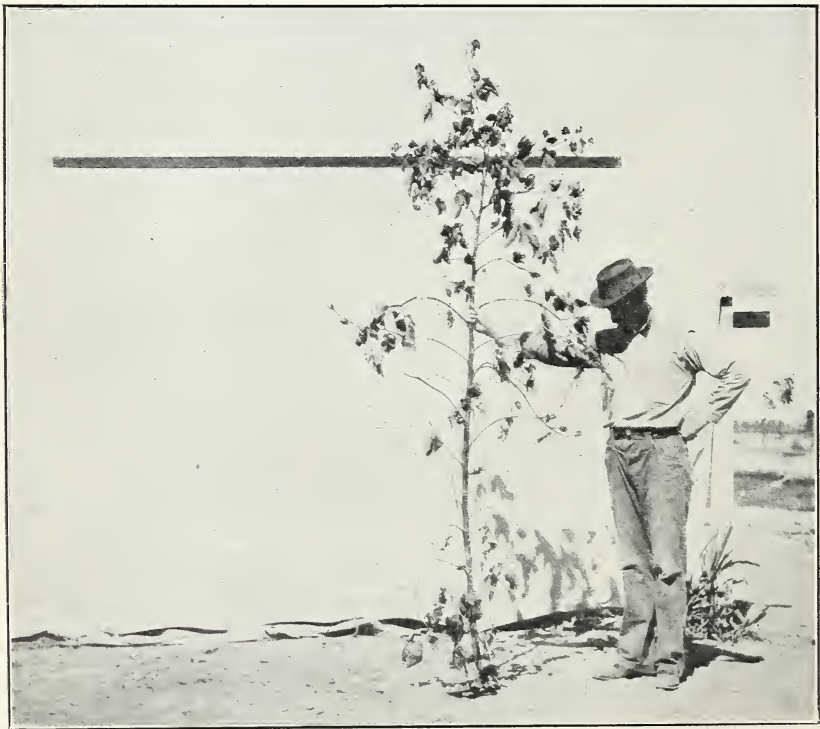
FIG. 2.—MATURE EGYPTIAN COTTON PLANT WITH LIMBS SUPPRESSED.