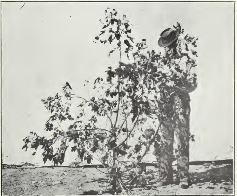
FIG. 2.—MATURE EGYPTIAN COTTON PLANT WITH EXCESSIVE DEVELOPMENT OF LIMBS.