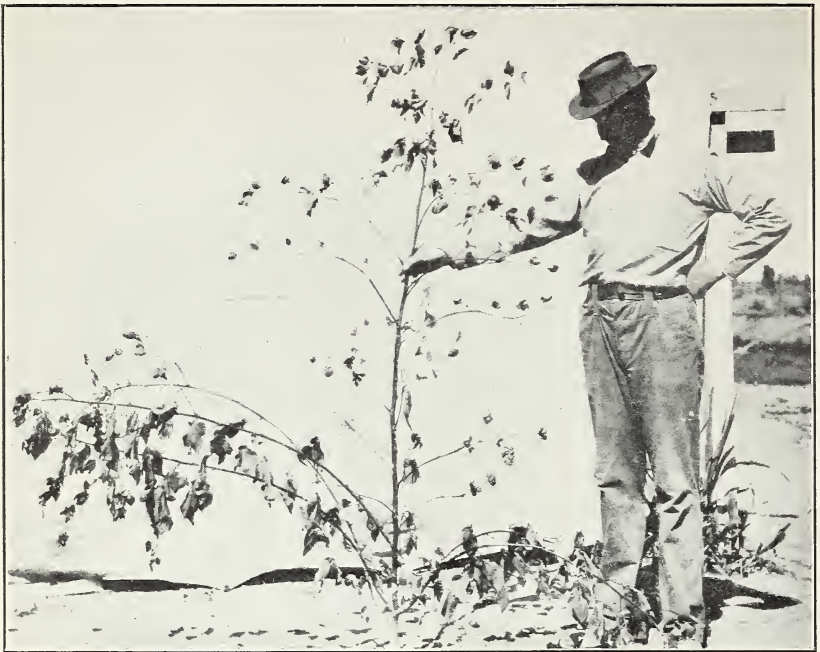
FIG. 1.—MATURE EGYPTIAN COTTON PLANT WITH A NUMBER OF MEDIUM-SIZED LIMBS, SHOWING DIFFERENCE IN SIZE AND POSITION OF LIMBS AND FRUITING BRANCHES. THE LONG BRANCHES AT THE BASE OF THE PLANT ARE LIMBS; THE SHORTER BRANCHES APPEARING JUST ABOVE THE LIMBS AND CONTINUING TO THE TOP OF THE STEM ARE FRUITING BRANCHES.