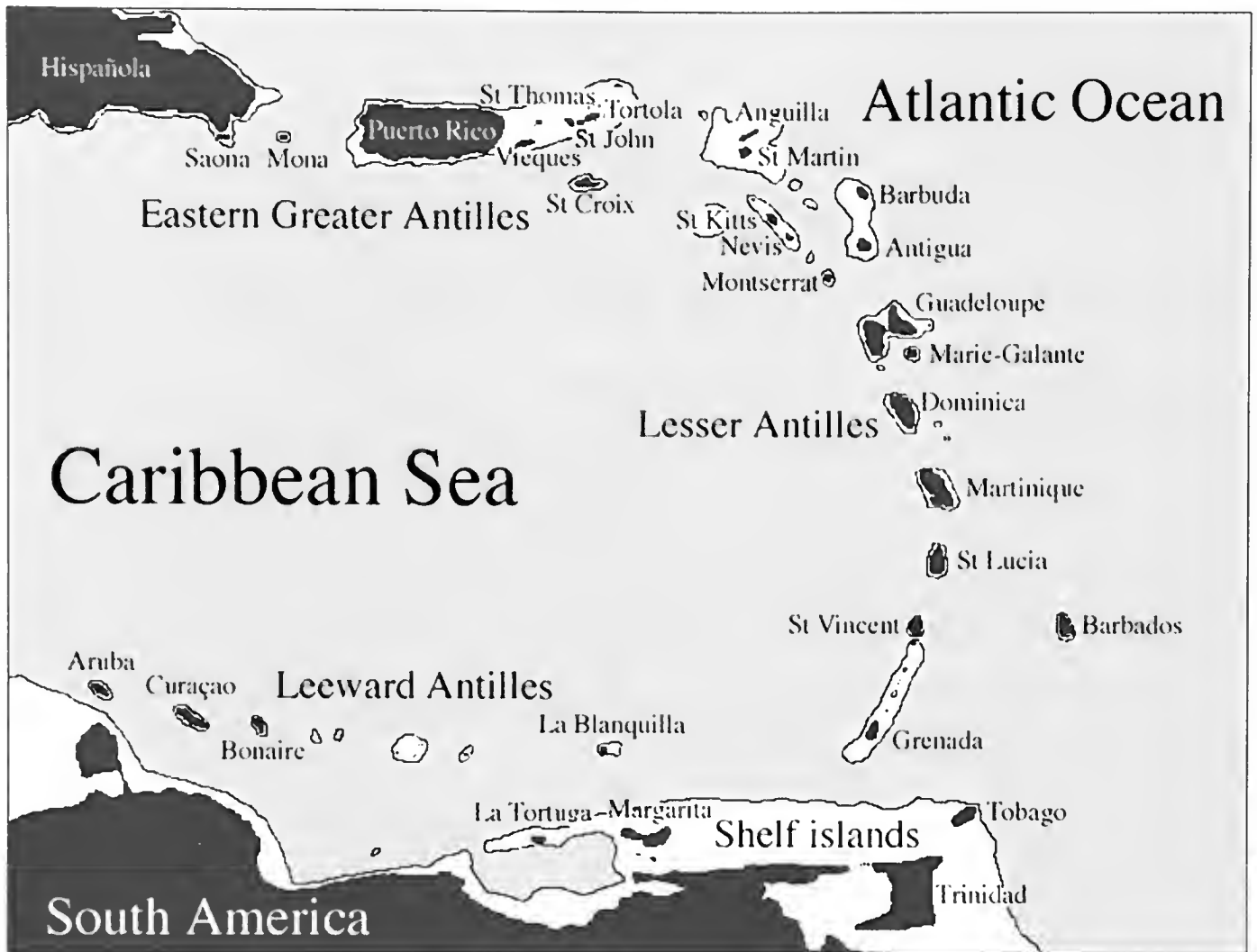
Figure 1. Major islands (>50 km 2 ) of the eastern Caribbean. Unshaded areas are now submerged but were dry land 15 kya when sea levels were ~ 150 m lower.

native vegetation remaining) (Solórzano et al. , 2005). On Caribbean islands, as elsewhere in the world, ants are critical components of virtually every terrestrial ecosystem (e.g., as scavengers, predators of other arthropods, seed dispersers, etc.) (Hölldobler and Wilson, 1990). Despite their importance, the native ants of most Caribbean islands have remained largely unknown. Now, several destructive exotic ant species are spreading through the region threatening native biodiversity. Here, we have compiled published and unpublished ant records and collected new specimens to document the diversity of ants from Barbados.