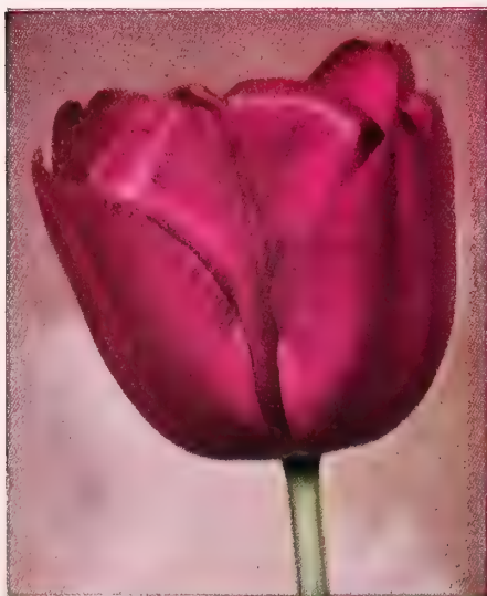
PRIDE OF HAARLEM