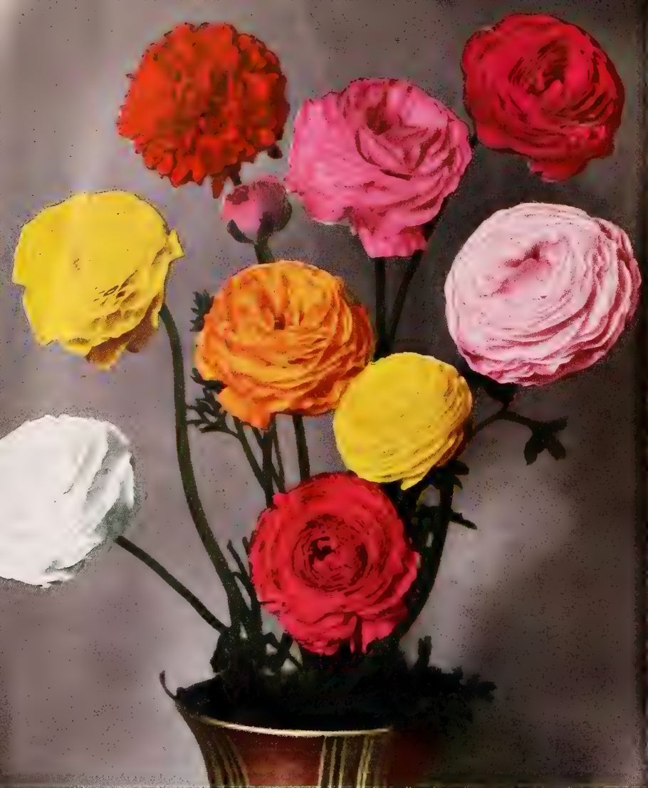
RANUNCULUS TECOLOTE GIANTS