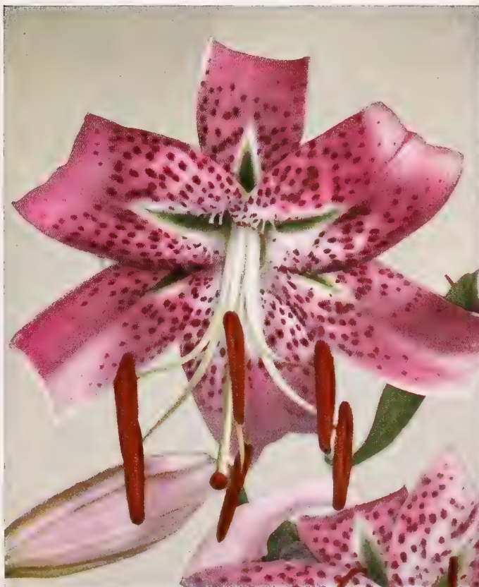
L. SPECIOSUM RUBRUM

See the new Baby White Calla described on next page.