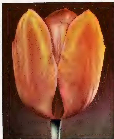
PRINCE OF ORANGE