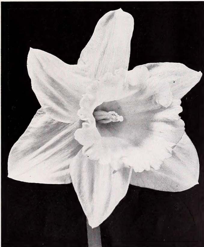
VAN WAVEREN'S GIANT

Von Sion. A full double flower of uniform golden yellow, the best known of the double Narcissi. 15c each; $1.50 per 12; $10.00 per 100.