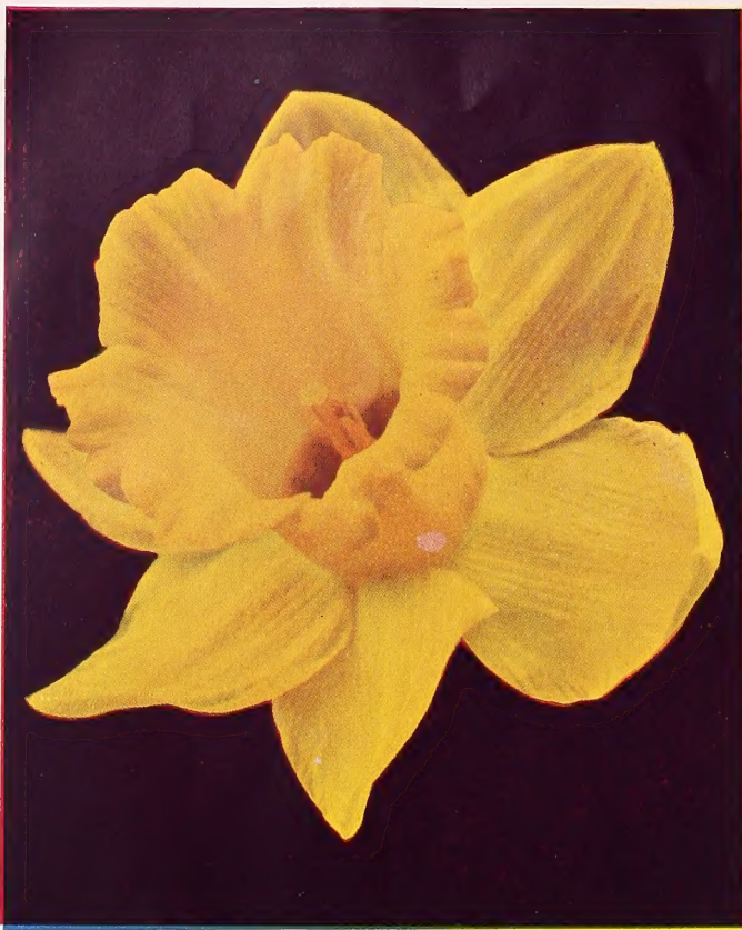
NARCISSUS KING ALFRED