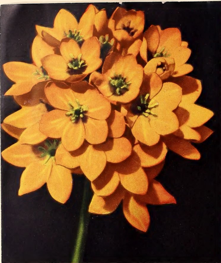
SOUTH AFRICAN GOLD STAR

Most bulbs benefit from a reasonable amount of fertilizer while imported European peat moss incorporated in the soil before planting conserves moisture and keeps the soil in better condition. Vigoro, offered on page 13 of this booklet, is an excellent fertilizer for bulbs, while peat moss is offered on page 14.