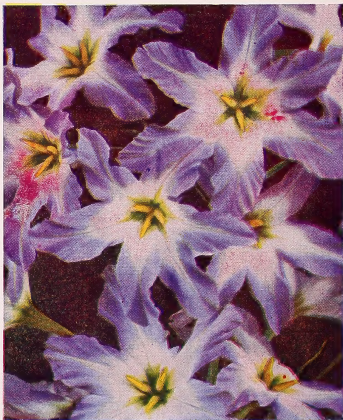
LEUCOCORYNE IXIOIDES ODORATA

THE BOOK OF BULBS, by F. F. Rockwell. With this complete and practical book you can get the utmost in beauty from every kind of bulbous plant. Clearly written by one who knows; illustrated with 187 beautiful photographs and instructive drawings. Includes tulips, daffodils, hyacinths, lilies, crocuses, glads, dahlias, peonies, irises, begonias, and scores of other beautiful but not-so-well-known bulbs. We recommend it as the best and most complete bulb book. 187 illus., 264 pages. $2.00, postpaid.