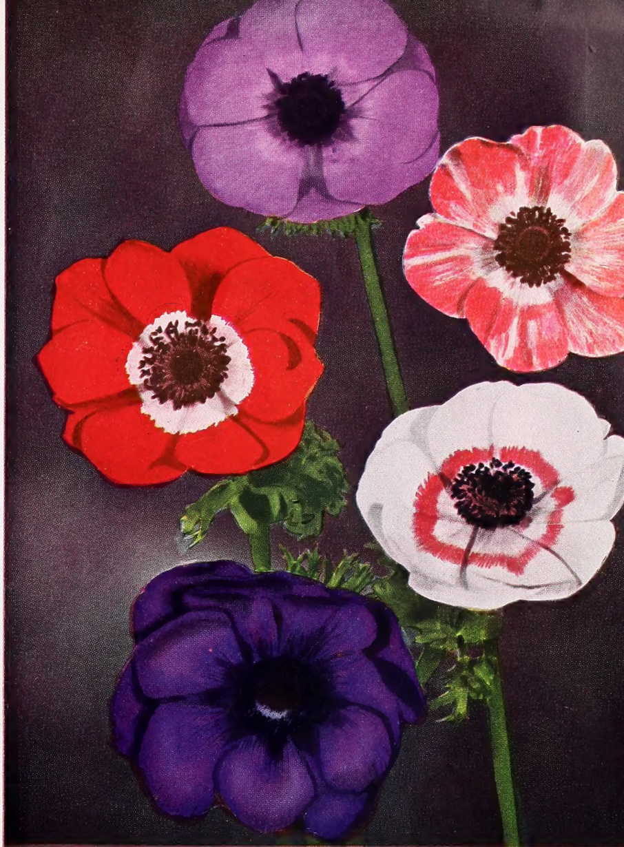
ANEMONE MONARCH DE CAEN