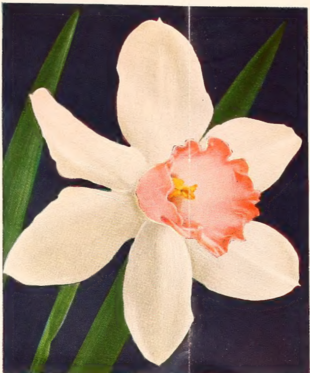
PINK DAFFODIL, MRS. R. O. BACKHOUSE

Peach Blossom. Soft rosy pink, flushed white. Flowers are fully double and long lasting. Grown chiefly for their showy effect where a display of color is desired. Well suited to forcing and bedding. Dwarf growth—6 to 8 inches—makes this variety ideal for foreground planting. An exceptionally fine forcer. 3 bulbs 40c; 12 for $1.35; 100 for $8.70, postpaid.