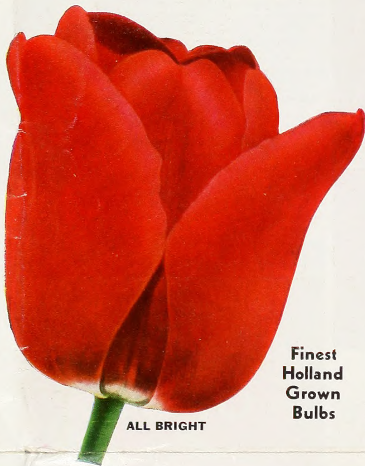
Finest Holland Grown Bulbs

Perry Como. (D) Graceful variety. The tall stems carry a magnificent well-shaped solid pink bloom, with silvery reflex at the edges. Stately and refined. Sturdy and solid. 3 bulbs 65c; 12 for $2.10; 100 for $13.80, postpaid.