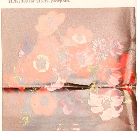
ANEMONES, ST. BRIGID

De Caen. Giant French Poppy-flowered. A fine strain bearing large, saucer-shaped flowers in brilliant colors.