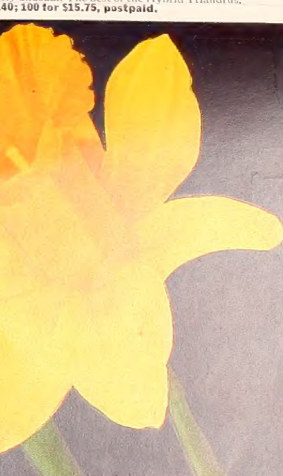
DAFFODIL, KING ALFRED

February Gold. An early-flowering, small golden Daffodil. Narrow orange-yellow trumpet with tiny orange edge. 3 bulbs 70c; 12 for $1.95; 100 for $13.15, postpaid.