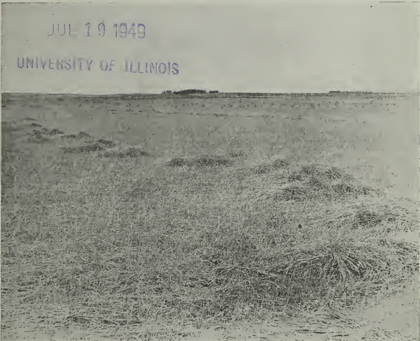
Field of wheat in Manitoba seriously damaged by Western Wheat-Stem Sawfly. (ORIGINAL)

DOMINION OF CANADA DEPARTMENT OF AGRICULTURE PAMPHLET NO. 6—NEW SERIES (REVISED EDITION)