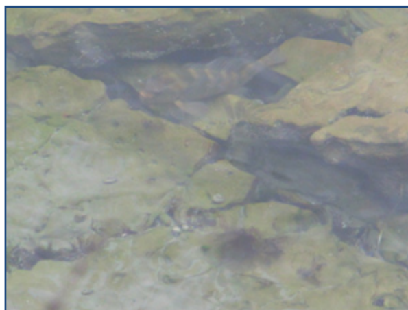
Fish swimming in water.

were ideal for bird activity. The species identified included eastern spinebill, crescent honeyeater, yellow-throated honeyeater, silveryeye, spotted pardalote, scarlet robin, brown thornbill, grey fantail, grey shrike-thrush, grey butcherbird, pied oystercatcher, white-faced heron, black-faced cormorant, Pacific gull, and a white-breasted sea eagle spotted by Geoff and Janet after most people had left.