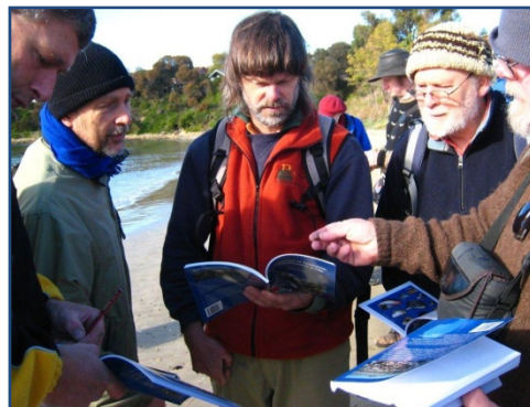
... then consult the comprehensive guide.

Number of shell species recorded in four 1x1m quadrats on Blackmans Bay Beach and in a 25 x 25 cm quadrat in a shell wash at Flower Pot Point.