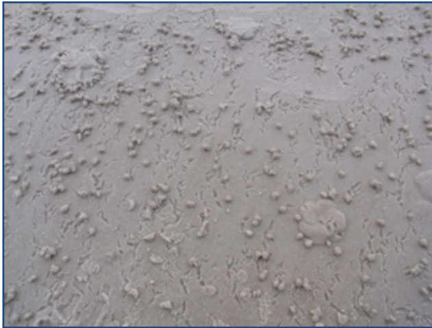
Crab tracks.