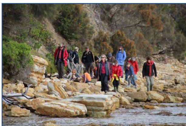
Exploring the Blackman's Bay foreshore.