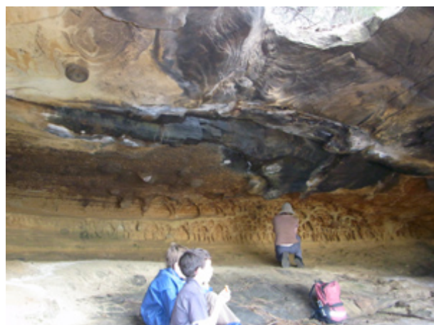
"They found a cave...."