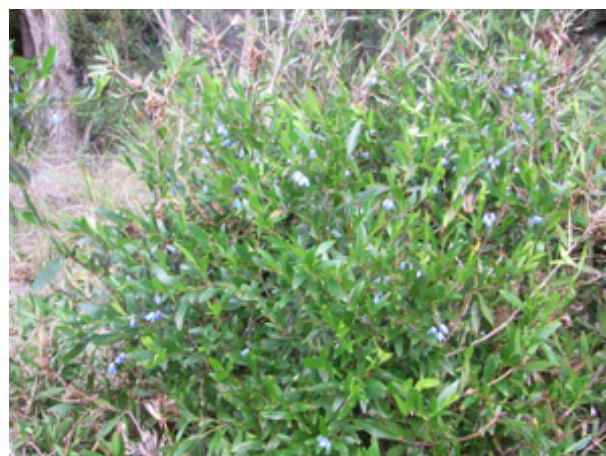
The weed Solya very out of place on the foreshore.

There were plenty of insects around. Mike identified a disappearing grasshopper Schizobothrus flavovittatus , to a chorus of "Where is it? Where is it?" from bystanders, and a common macrotona Macrotona australis .