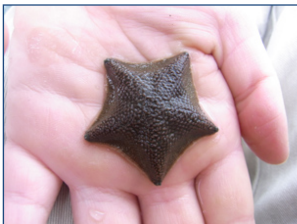
A starfish.

As we walked along we passed a small constructed pond in a gully, where I heard a brown tree frog Litoria ewingii . On the track I noted scratchings in the ground, which looked like those made by bandicoots, and scats of wallabies, possums and dogs. The cool, cloudy conditions