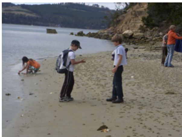
Meandering along the beach.

Apart from one area of stormwater runoff, there were few weeds present. The stormwater outlet was infested with watsonia Watsonia meriana , and also supported agapanthus Agapanthus