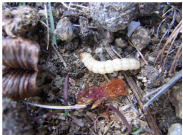
Banksia larvae. Photo Andrew Hingston

Apart from one area of stormwater runoff, there were few weeds present. The stormwater outlet was infested with watsonia Watsonia meriana , and also supported agapanthus Agapanthus