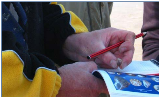
First find the shell.....