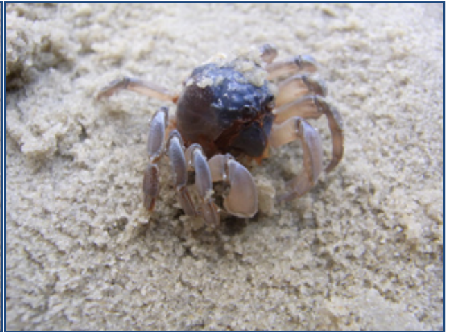
Blue crab.