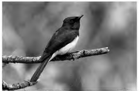
Male Satin Flycatcher

As the clouds cleared and the afternoon warmed up, the activity and numbers of nectar-feeding insects increased, providing ample engagement for the macro-photography enthusiasts. The other objects of interest, and of photographic opportunities, are the metal sculptures situated around the gardens, and other wildlife of the flesh and blood kind - frogs were calling in the pond, many skinks and a solitary blue-tongue lizard were seen basking in the sun.