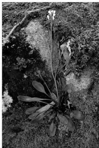
Cardamine tryssa

During the walk there was plenty of evidence of wombats and of grazing by red-necked wallabies and the feral fallow deer. A herd of over 50 Fallow deer was sighted on the drive from Miena to the Steppes Homestead.