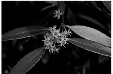
Maytenus boaria