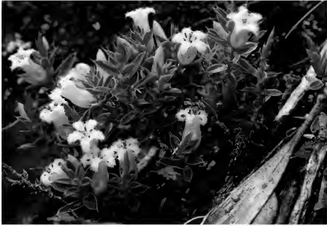
Leucopogon fraseri