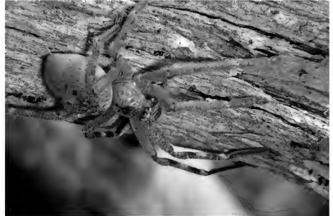
Neosparassus patellatus - Huntsman