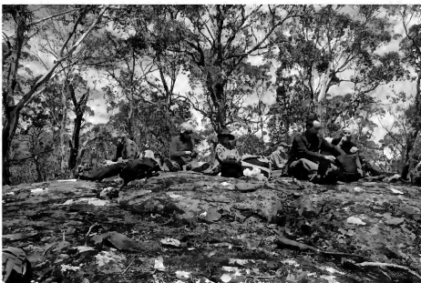
Steppes lunch time rock

James set off into the bush, as the crow flies, following his GPS reading for Cardamine tryssa with many of us all trailing and flailing behind, but after consultation we regrouped and following Anne and Ken's previously marked trail we all arrived safely up at the rock outcrops on the Steppes State Reserve, where we enjoyed our lunch.