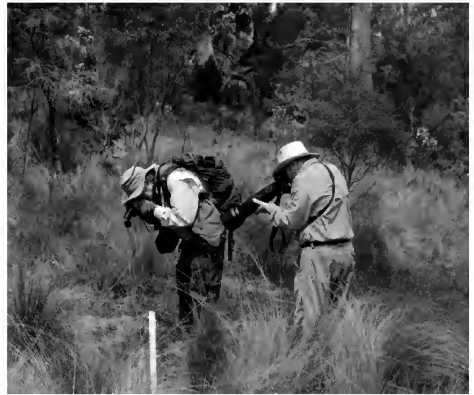
Field Nats pursue a photographic interest

As well as being an excellent display of native plants, the garden has picnic and bbq facilities, and so was a most suitable venue for a field nats gathering. As we entered the garden, members were immediately struck by the number of insects feeding on the flowering shrubs, and so progress to the bbq shelter further up the hill was slow!