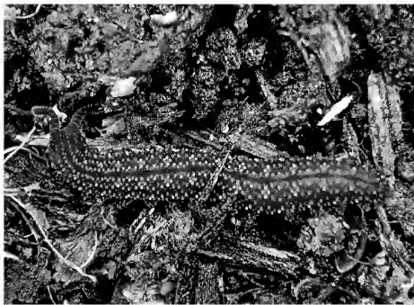
Velvet worm.

The Club members who decided to spend the weekend up on the Central Plateau and do a little field naturalising along the Poatina Road on Saturday en route for the excursion the next day, were not disappointed when they saw a number of echidnas and of particular note they found a Gondwanaland species - Velvet worm or Peripatus. Further finds from that day are listed at the end of this report.