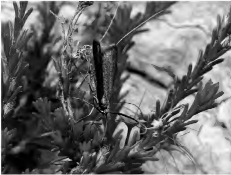
An iridescent moth