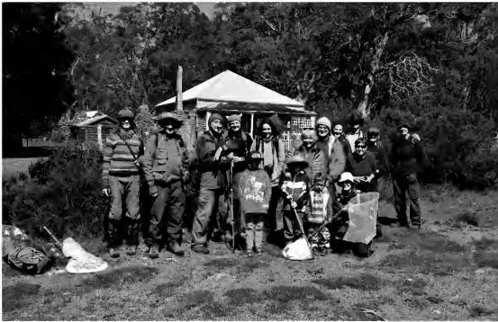
Field Nats at The Steppes Excursion, November 5th.