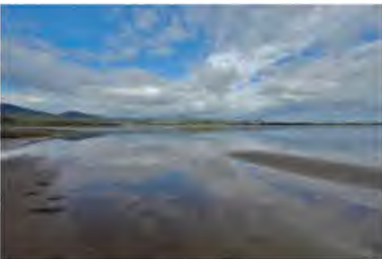
Cloudy Reflections.