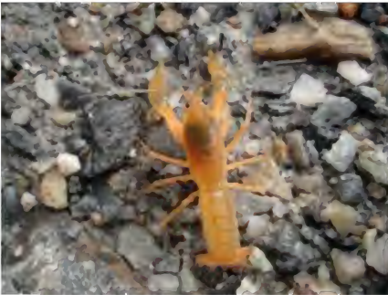
Juvenile Crayfish found on Twelvvetrees Range.