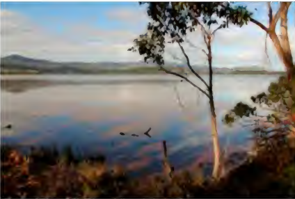
First View of Cloudy Lagoon.

Rosanna pointed out the vicinity of the tram track which in late 1800's transported timber from Cloudy Lagoon to Little Taylor's Bay. We passed through beautiful forests of E. obliqua and some E. globulus , and arrived at the beautiful vista of Cloudy Lagoon.