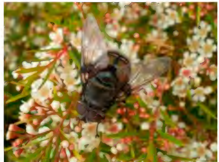
A range of amazing native flies routinely feed on B. virgata including this 20mm Tabanid in the Rutilia genus.