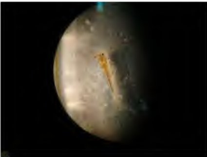
Allanaspides hickmani under the microscope.

fishing skills were up to the task and some tiny specimens were collected for closer examination with microscopes at the camp.