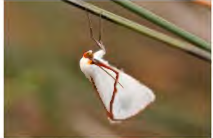
Thalaina selenaea, Satin moth.