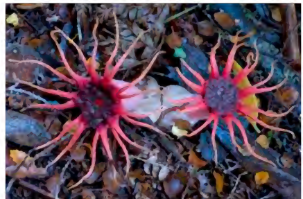
Aseroe rubra.

We then all went home to dry off after a very enjoyable Easter camp.