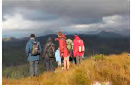
At the top on the Twelvetrees Range.