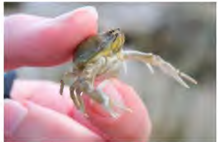
Pebble crab - Philyra laevis.