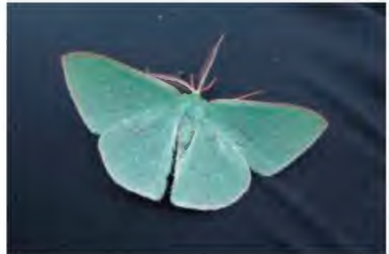
Gum Emerald moth - Prascinocyma semicrocea.