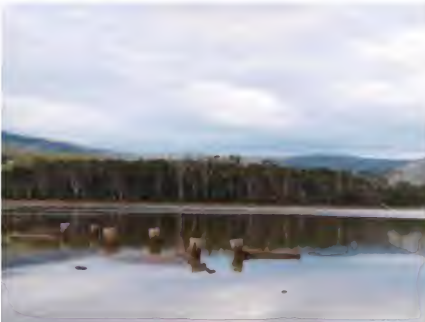
Pylon remnants of the tram track in Cloudy Lagoon.