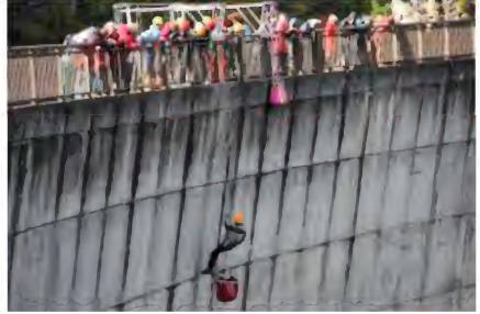
Abseiler on the Gordon Dam.

The weather crashed on day 2 but we persevered and spent the morning visiting the Gordon and Serpentine