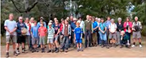
Field Nats ready for the Easter Camp.

O n Friday 6 April 2012, in great weather, 31 keen field naturalists set off for the Easter Camp.