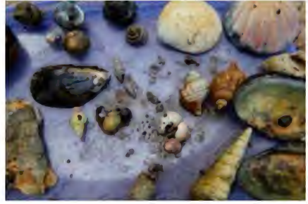
Mollusc Collection.