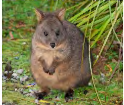
Pademelon at Ted's beach.