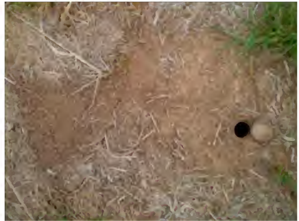
The same burrow with lid open.