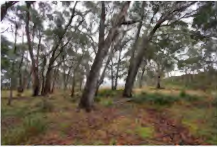
E. obliqua forest.