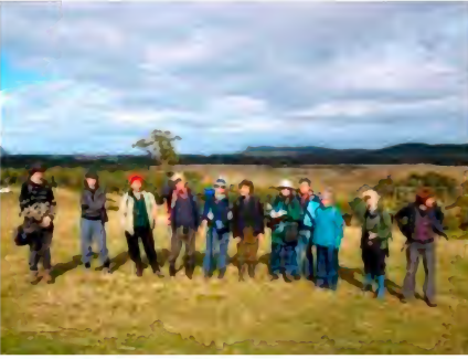
Field Nats at Lunawanna.