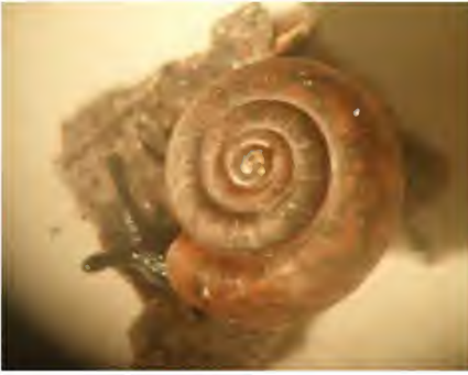
Elsothera sp. "Needles" (shell 5mm) found on the Twelvvetrees Range. This is the 8th known location for this western Tas species.