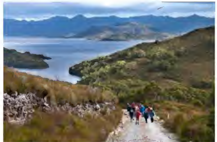
Field Nats on the Twelvetrees Track.

Dams. While at the Gordon Dam we were able to watch a group abseiling down the dam wall. Some hardy Field Nats ventured up the very steep Mt Sprent Track that started next to the Serpentine Dam wall. After lunch the weather picked up a little, and with only occasional showers, we headed up the Twelvetrees Range track for spectacular views of the area.