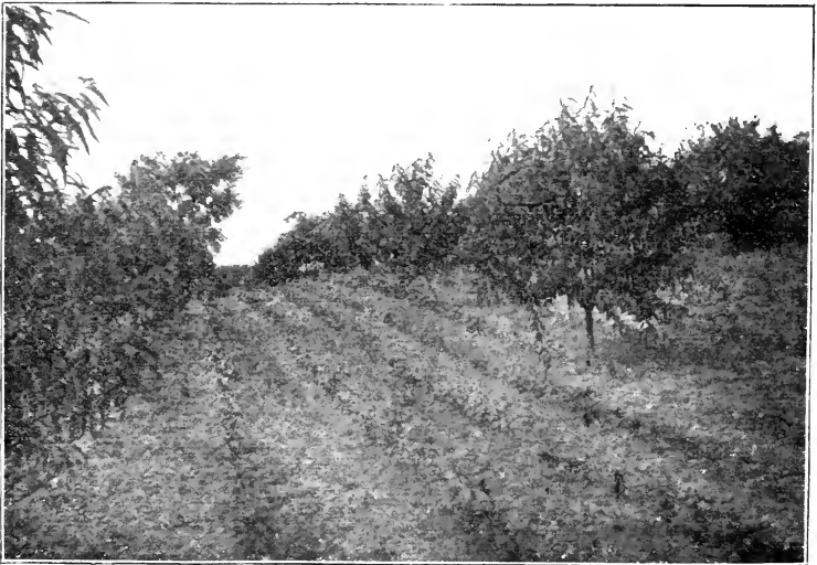
Peppers in Peach Orchard (College).