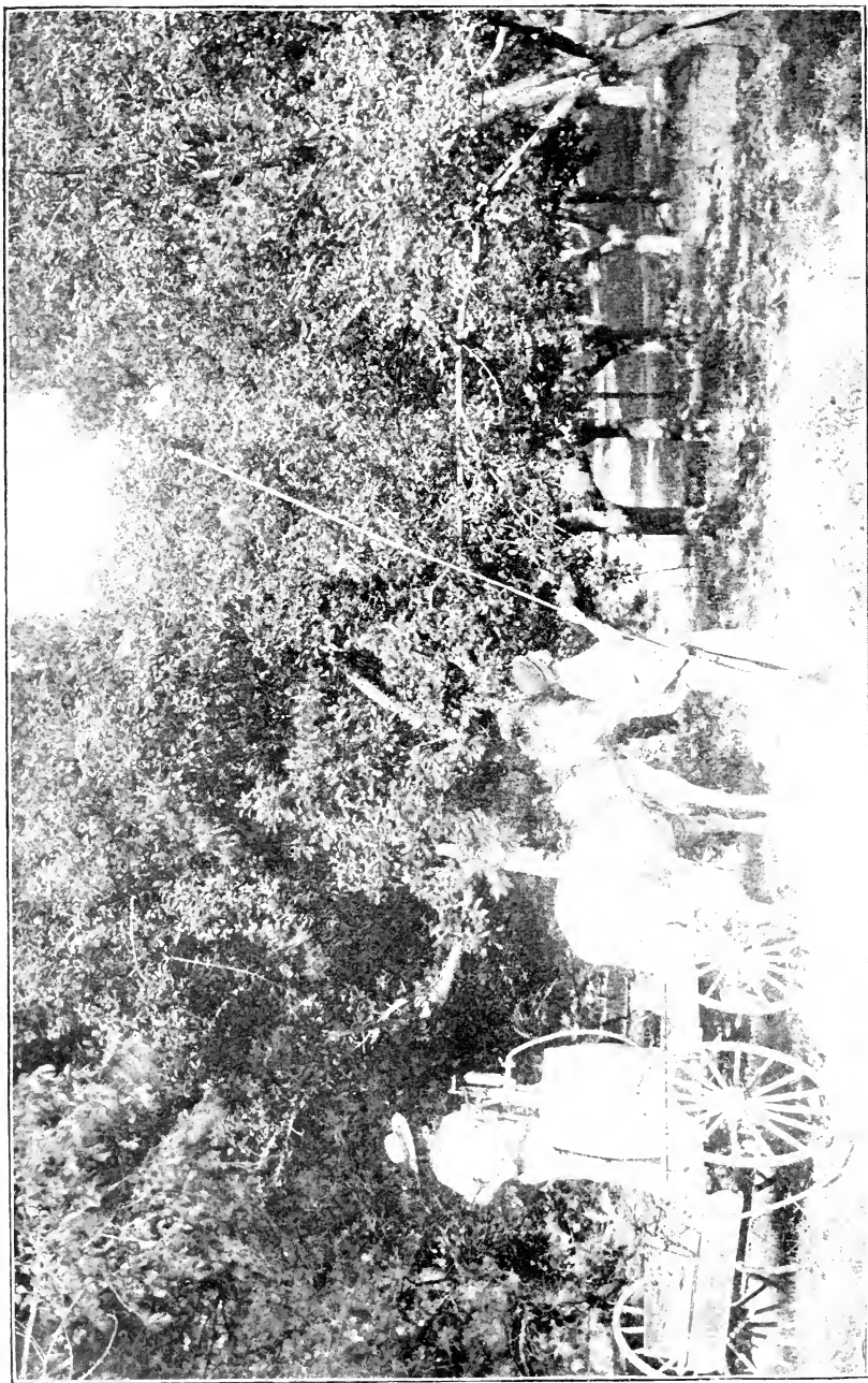
FIG. 5. Spraying the orchard. A practical equipment for the average orchard. The men can change about in their work.