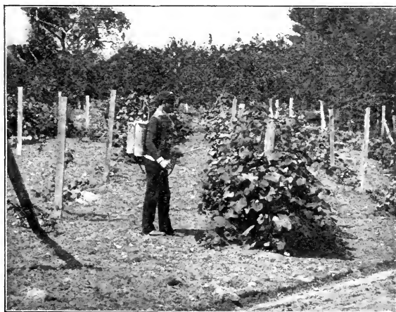
FIG. 6. The Knapsack Sprayer. A practical sprayer for small fruits, shrubs, vegetables, etc., on a limited area.

Paris Green is an excellent insecticide for the destruction of insects that eat foliage. Its use for the destruction of the potato beetle is familiar. It should be used in the proportion of one pound of the green to two hundred gallons of water, or a teaspoonful of the green to a bucket of water. The green should be first made into a thick paste with a little water before