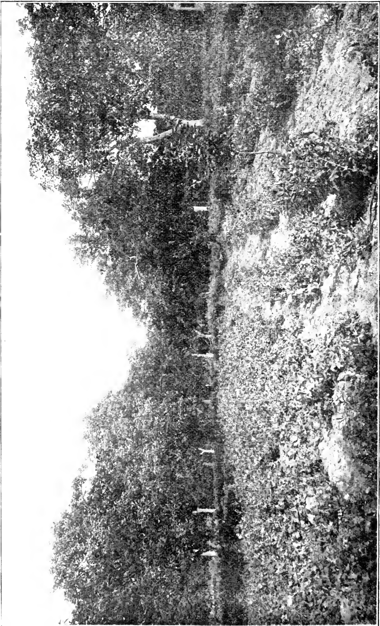
FIG. 2. Renovating an old orchard (College). A crop of Dwarf Peas. The vines are plowed under after the pods are harvested.