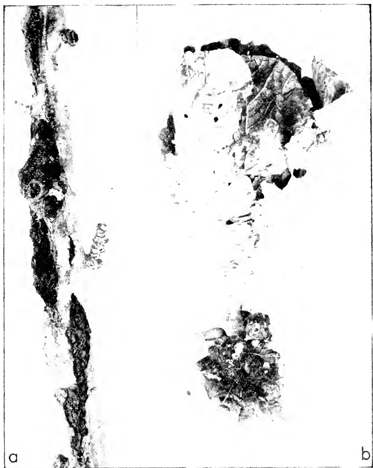
Plate 16. a . Cherry limb with early stage of Black Knot ; b , cabbage affected with club root.